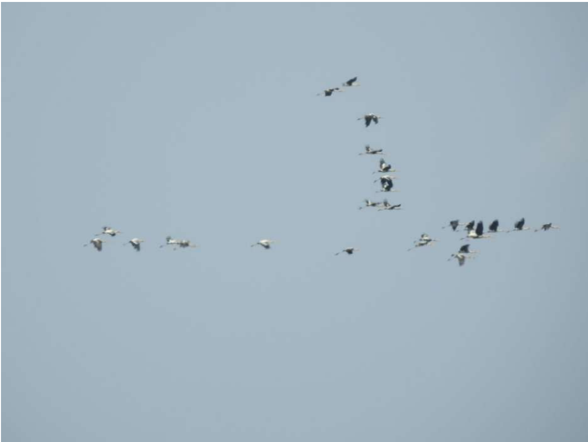
Fig 12: Flock of Painted Storks ( 25 th November 2016)