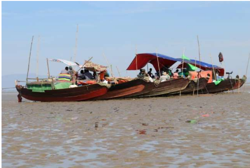
Fig 2: Survey boats in the mudflat

Team 2: The team 2 also split in small teams and surveyed surrounding Taung Gyi mudflat area which is close to Thahton district area. On Day 2, the team recorded over 1300 small waders but no Spoon-billed Sandpiper at the location (N 17.005400 E 97.052930). On Day 3, the team surveyed in the north 10 km distance from Day 2 location and there recorded 4-5 Spoon-billed Sandpipers. The team 2 also carried out the survey at Bilu Island near Dayel village on the 19 January and no Spoon-billed Sandpiper was recorded.