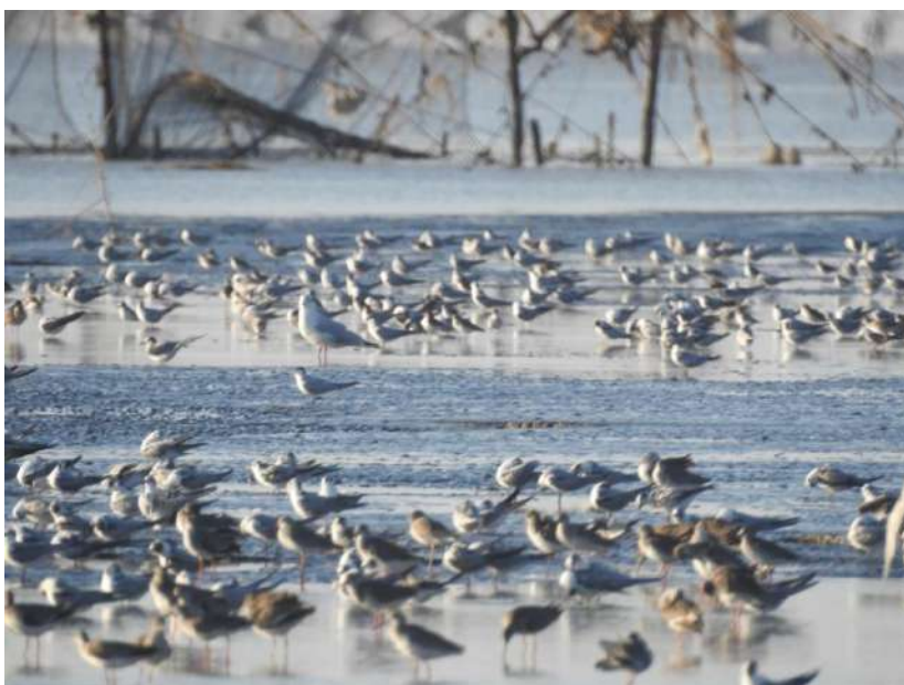
Fig 11: Flock of Terns and Common Redshanks