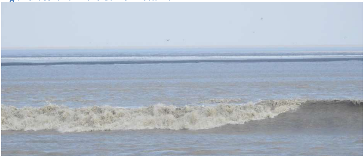
Fig 10: Tidal bore in the Gulf of Mottama