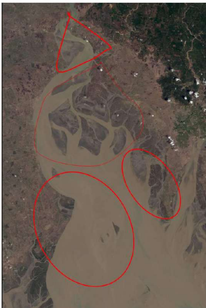
Downloaded March 2017