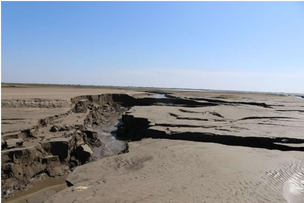
Fig 8: mudflats in Gulf of Mottama

Upper Gulf of Mottama mudflats have changed in comparison with the previous year condition. Some new mudflat are born in the west coast near the main channel of Sittaung river. Due to heavy rains in monsoon season, the water salinity is 25 ppt in January 2017, less than 2ppt in comparison with the previous year. Also, the size of small crab are smaller.