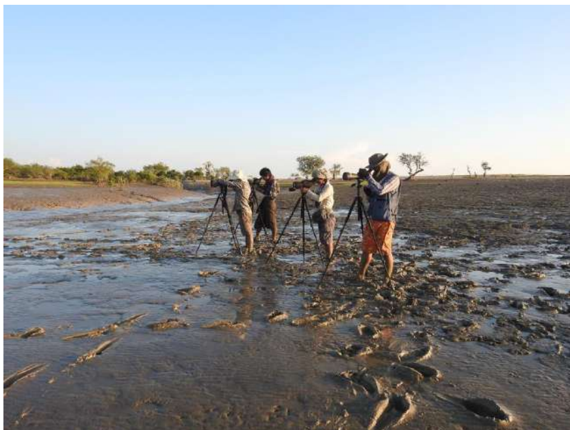
Fig 1: Survey team in the mudflat

Leaving Tawpon Village, the team arrived at Ahlat Village (north of Tawpon village) a distance of (19 km) at 1:30pm the next day. Surveys began immediately and recorded two Spoon-billed Sandpipers without flag (N: 16.51117 E 97.35708) and over 1500 small waders. The boats stayed at this location overnight, left Ahlat village at 8am and arrived at 'Army' Island, a distance 10 km from Ahlat, located north of Bilu island at 11:15am. Waiting for low tide, survey began at 2pm and recorded 2000 small waders. During the high tide at 5:30pm, the team left the island and arrived at Dayel creek at 5:50pm. Army Island has good mangrove forest and sandy mudflats. The team halted overnight at the creek, then the team moved in the morning to Dayel village where they began final survey at 8am. There were small roosting places for wader near the Dayel village and recorded about 1900 waders.