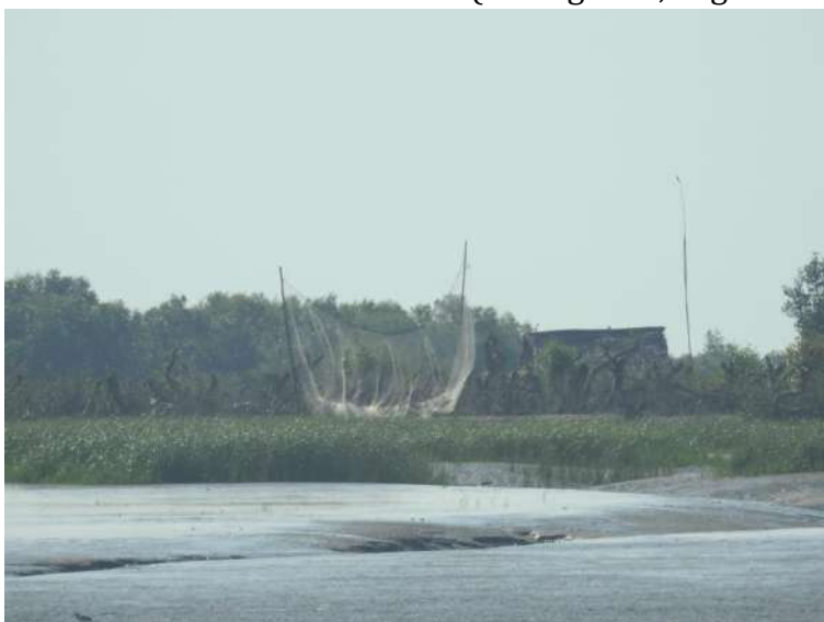
Fig 5: Mist net near Dayel village at Bilu Island

In each survey trip, the team checked hunting issues but didn't record in the Gulf of Mottama. There is no more hunting in the Gulf of Mottama according to the local fishers. But the team recorded the mist net at the Bilu Island during the survey in November 2016 near the Dayel village. The fishers said there were some bird hunting issues, where hunters come from Dayel village and some are from Paung Township. BANCA team went to Dayel village after the survey trip and met with the bird hunter and asked about the hunting information. One month later, the team provided alternative livelihoods for this bird hunter (fishing boat, engine and fishing gears) in Dayel village.