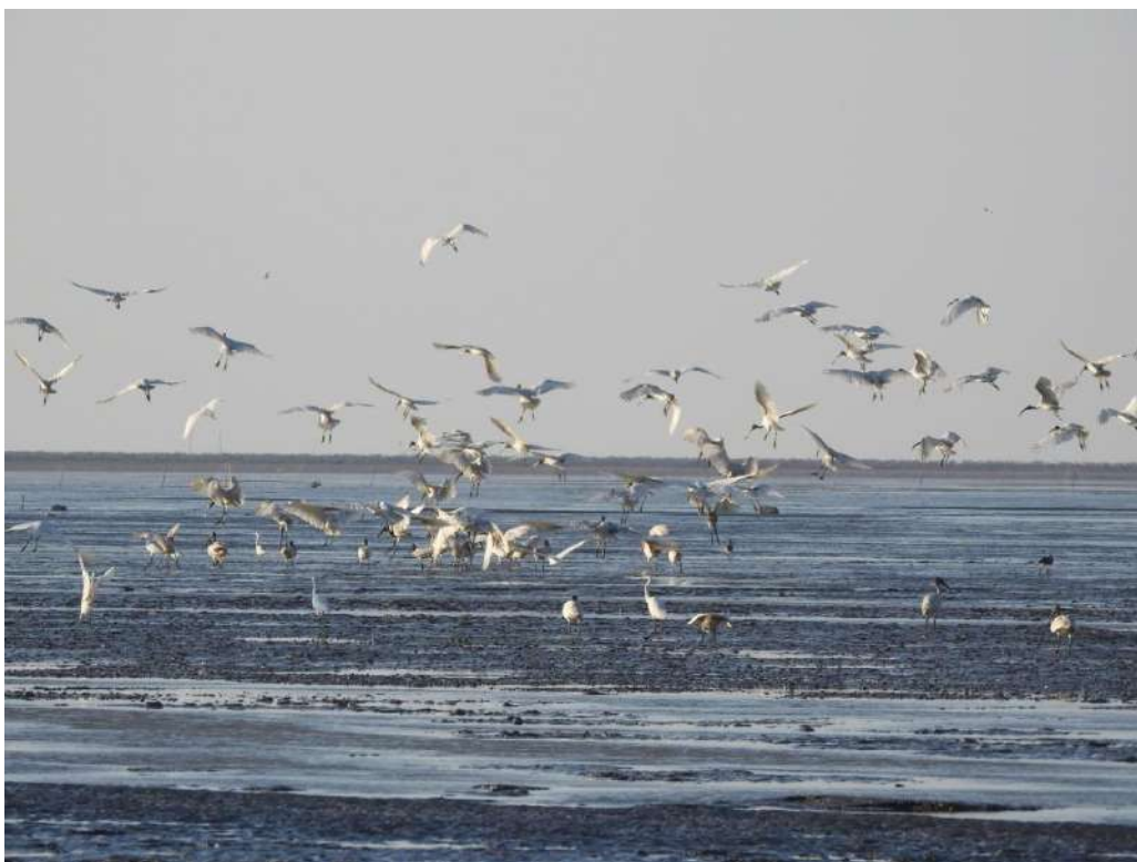
Fig 13: Flock of Black-headed Ibis (25 th November 2016 at Bilu island)