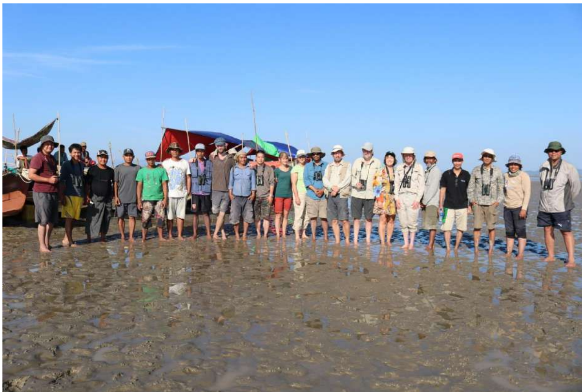
Fig: 3 Flyways survey team members