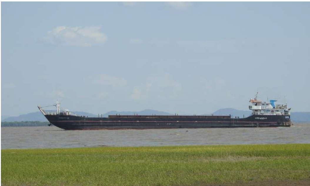
Fig: 7 Sand mining vessel at Thanlwin river mouth