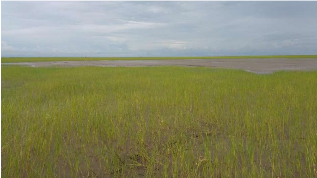
Fig 9: Grass land in the Gulf of Mottama