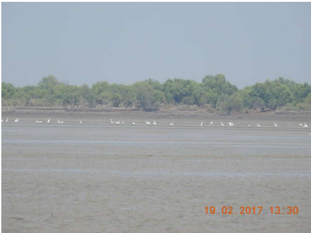
Fig 4: 1 Mangrove forests between Thahton and Paung township

The team left early the next morning and made way to Shwe Mhone mudflat (N: 16.82228 E: 097.18016). Surveys were conducted shortly after arrival; however no small waders were recorded. During high tide at 11:17am, the boats moved from this location, arriving at Saw Kae mudflat (N: 16.835380 E: 97.183830) at 11:33am. Surveys began at 12:30pm, during which few small waders but no Spoon-billed Sandpipers were identified. During high tide at 8:30pm, the boats made way back to Aung Kan Thar creek where and stayed overnight. Surveying began in this area at 7am, at this time only a few small waders were recorded with the majority of bird sightings being larger sized birds. During high tide at 12pm that day, the team moved back to Aung Kar Thar village and the survey came to an end.