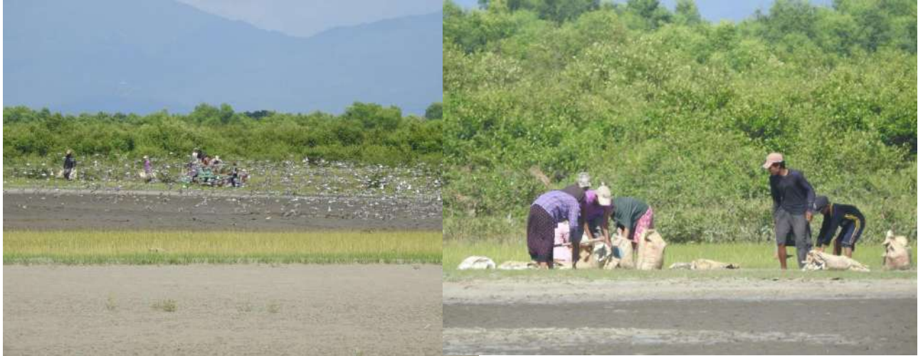
Fig 6: Small scale sand mining at the waders roosting place in Ahlat village Mon State

Two types (small scale and large scale). Small scale sand mining issues in Ahlat village at the roosting place of shore bird area. Many vessels could be seen in the Southern Gulf of Mottama, Mawlamyine and Thanlwin river mouth for large scale sand mining. The sand extraction is one of the impact for the river ecosystem and erosion which may impact the mudflat ecosystem.