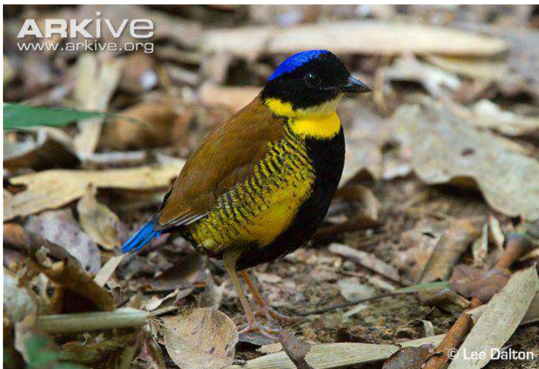
Gurney's Pitta is the emblem of Myanmar's Sundaic Forests

The sundaic forests of Tanintharyi Division are a global conservation priority because they support the largest remaining population of the endemic and globally Endangered Gurney's Pitta. They also support populations of Asian Elephant Elephas maximus , Tiger Panthera tigris and Asian Tapir Tapirus indicus .