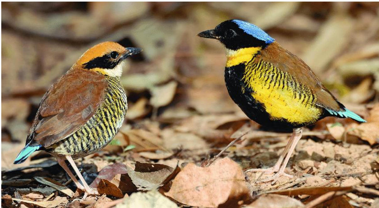
Gurney's Pitta ( female - left and male - right )

The Gurney's Pitta is found in including primary and secondary, regenerating, lowland semi-evergreen and bamboo forest habitats. This species distribution area are Southern Myanmar and Thailand. Territories are centered on gully systems where moist conditions prevail year-round, usually with access to water, and often close to forest edge. It is the main diet is slugs, insects and earthworms in line with other members of the genus. It breeds during the wet season, between April and October.