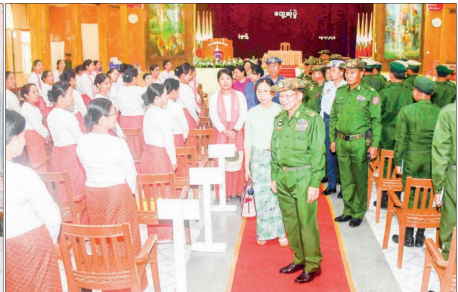
The Senior General and wife cordially converse with families and Tatmadaw members from Monywa Station at North-West Command HQ on 19 March.

as to demand their entitlements under the law as the Hluttaw is the highest political platform in the democratic system.