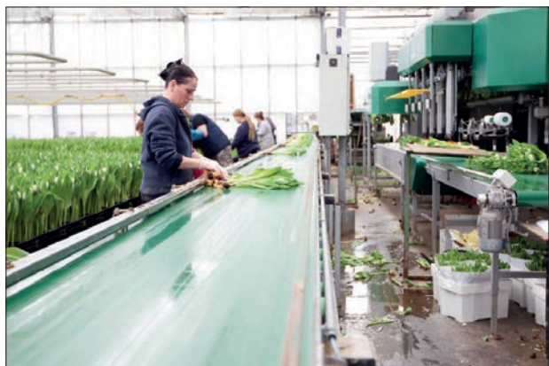
Employees prepare bouquets of tulips for the tulip season at a workshop in Spierdijk, the Netherlands, 17 March, 2023.

Meanwhile, Keukenhof, the most popular place to see tulips in the Netherlands, is scheduled to open its gates to global tourists on 23 March. More than 1 million visitors from around the world are expected to visit the most well-known tulip garden during its eight weeks of exhibition, according to a press release of Keukenhof. — Xinhua