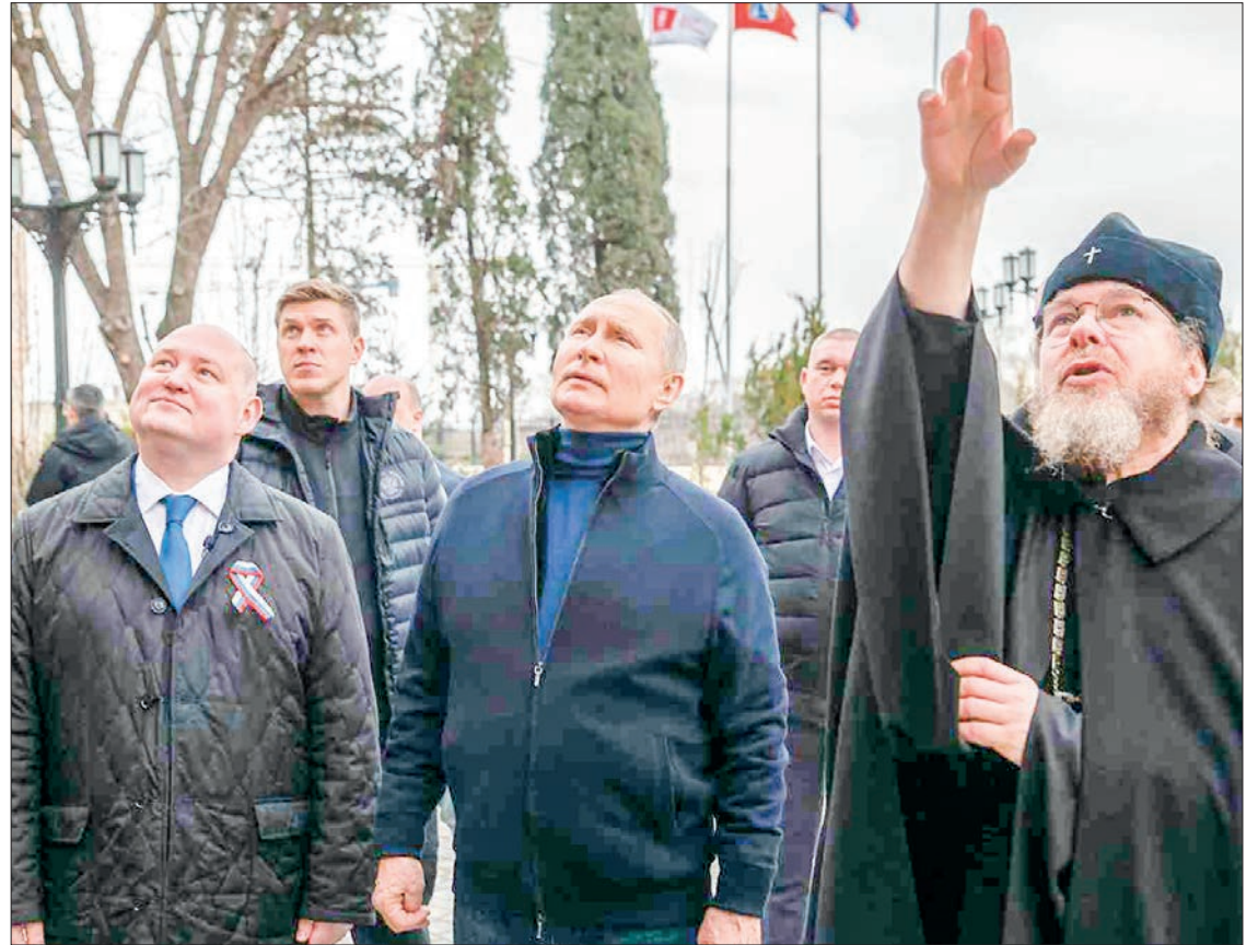
A handout photograph taken and released by the Russian presidential press office in Sevastopol on 18 March, 2023, shows Russian President Vladimir Putin in Crimea.

PRESIDENT Vladimir Putin has toured the city of Mariupol, Russian state news reported Sunday, almost one year after Moscow claimed to have captured the strategic port city.