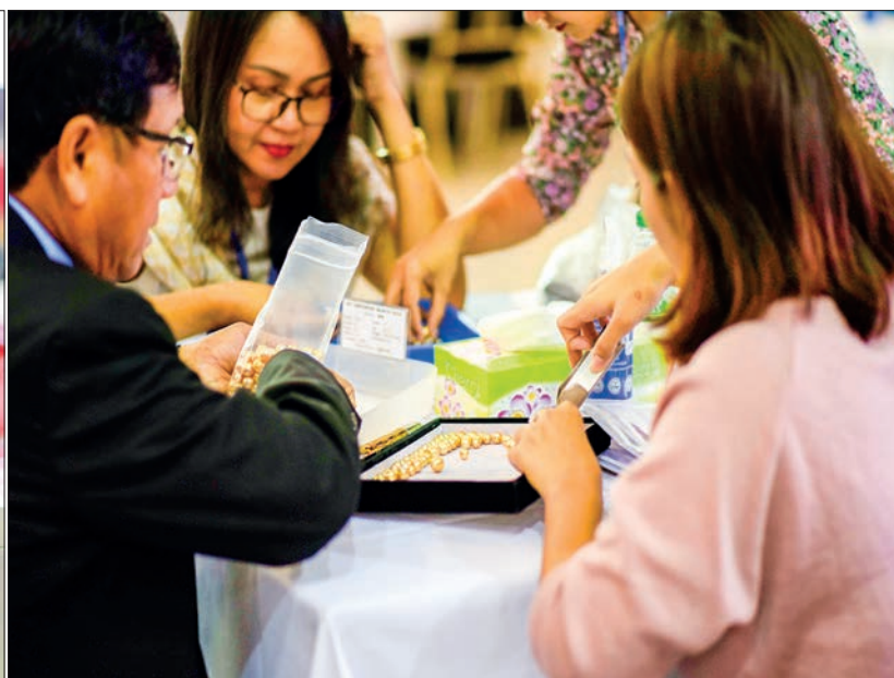
Gem merchants checking quality of pieces of pearl.