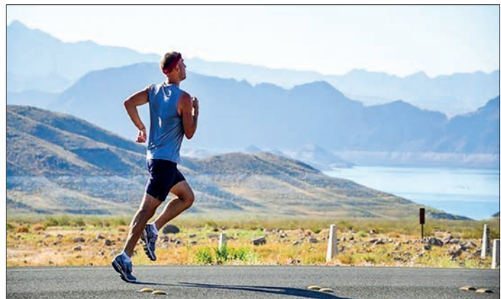
The results may also have implications for treating dangerous arrhythmias associated with more common conditions, such as those that can develop soon after a heart attack.