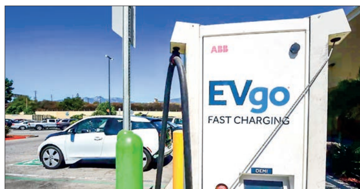
An electric vehicle is plugged into a charging station at a Walmart parking lot in Duarte on 14 September 2018.

"Missing this technological wave... would have long-lasting negative implications."