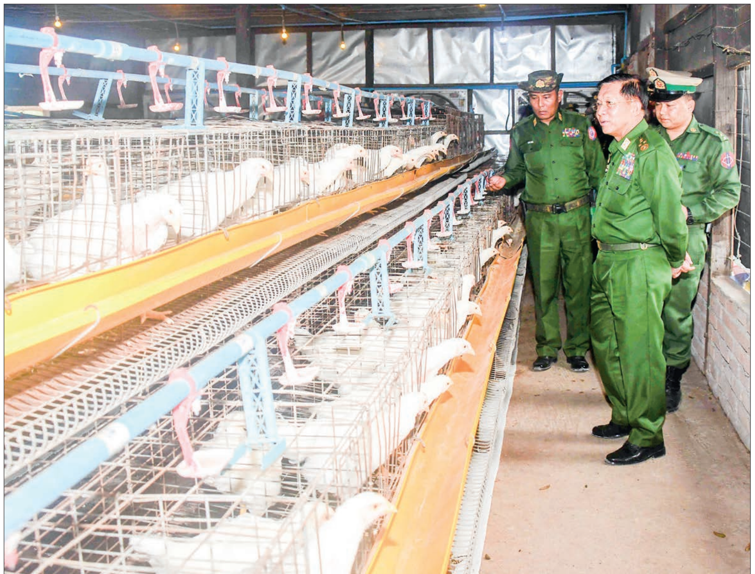
SAC Chairman Commander-in-Chief of Defence Services Senior General Min Aung Hlaing inspects poultry farm of integrated farm of North-West Command on 19 March.

Speaking on the occasion, the Senior General said as strength can make good changes and better progress for the State as well as the Tatmadaw, military unity and the united strength of the State must be built without fail.