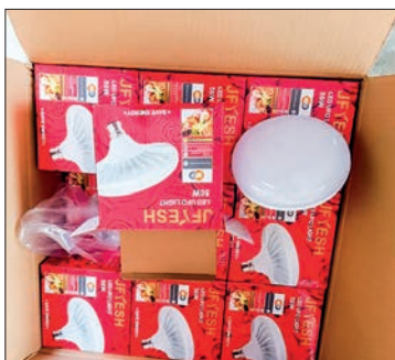
Jfresh LED UFO light bulbs.

A Custom inspection team performed inspection on Yangon-Hpa-an-Myawady highway and they seized 5,000 kilogrammes of High Density Polyethylene valued over K 9 million more carried than declared in ID and a Nissan Diesel Tractor-Head and one trailer estimated at K 70 million on 15 March. The total value worth over K 79 million was confiscated and the action was taken under the Customs Procedures.