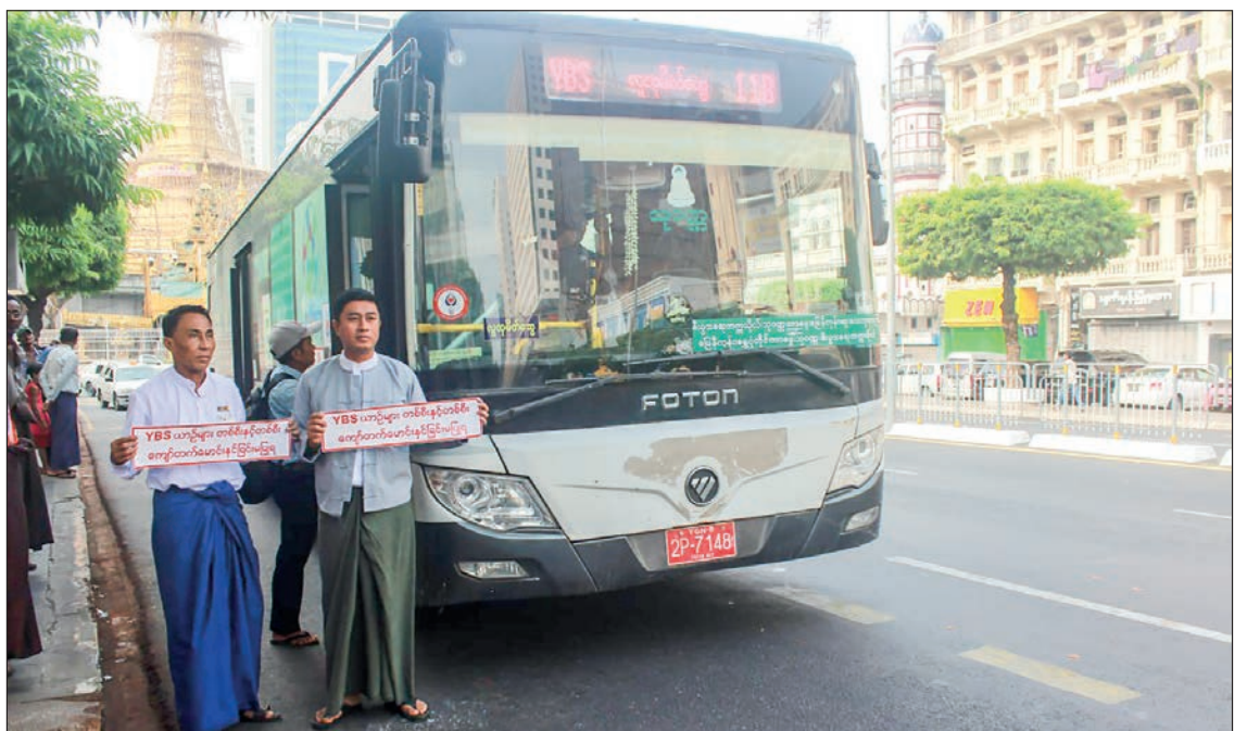
Officials put stickers on YBS buses with the warning “Don’t overtake each other” on 15 March.

On 15 March, a campaign was staged for YBS buses not to overtake other buses with putting stickers on the buses, to ensure the safety of the passengers.