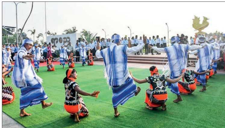
Cultural dance troupe perform dance at opening of beach resort in Mawlamyine Township on 18 March.

STATE Administration Council member Deputy Prime Minister and Minister for Defence General Mya Tun Oo, SAC member U Yan Kyaw, Union Ministers Lt-Gen Tun Tun Naung and Jeng