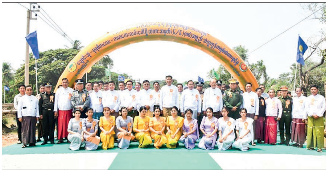
SAC member Deputy Prime Minister Union Minister for Defence General Mya Tun Oo poses for documentary photo at opening of concrete bridge on Chaungzon- Muyitkalay-Kamakay road in Chaungzon on 18 March.