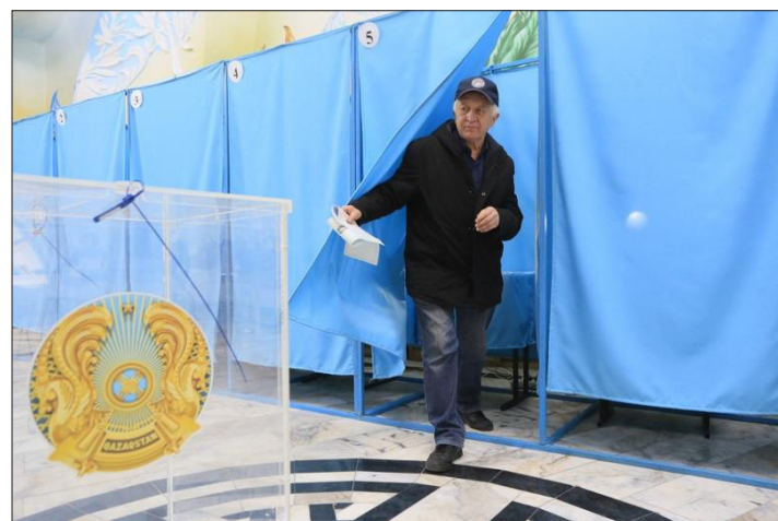
A man votes during parliamentary elections in Almaty on 19 March 2023. PHOTO: AFP

The ex-Soviet country's elections now feature a wider array of candidates but there was scepticism in Almaty over the changes. — AFP