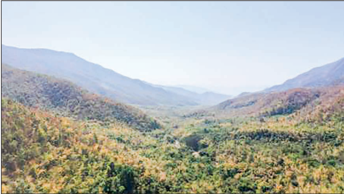
A distant view shows Hanlintaung protected public forest designated on 11 March 2022 in Ywangan Township of Southern Shan State.

THE Ministry of Natural Resources and Environmental Conservation has designated the area of 1,363 acres in Indaw Township, Katha District in Sagaing Region, as “Gahe II Protected Public Forest” as from 14 March 2023, the Forest Law (2018).