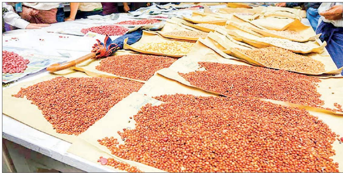
Red pigeon peas seen in the Yangon pulses market.

Because of that, there were some days in the Yangon pulses market where the prices of black gram and red pigeon peas