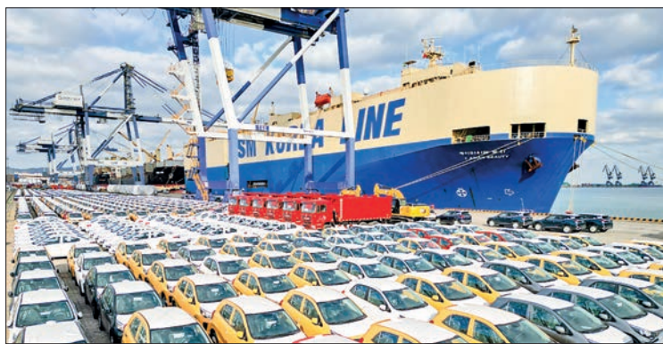
Vehicles wait to be loaded on the pure car and truck carriers in the Yantan Port, east China's Shandong Province, 11 December 2022.

THE world is in the midst of a "fragile economic recovery" in the wake of the impacts from the coronavirus pandemic and the conflict between Russia and