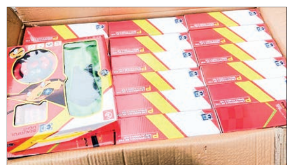
3D Beautiful lights.