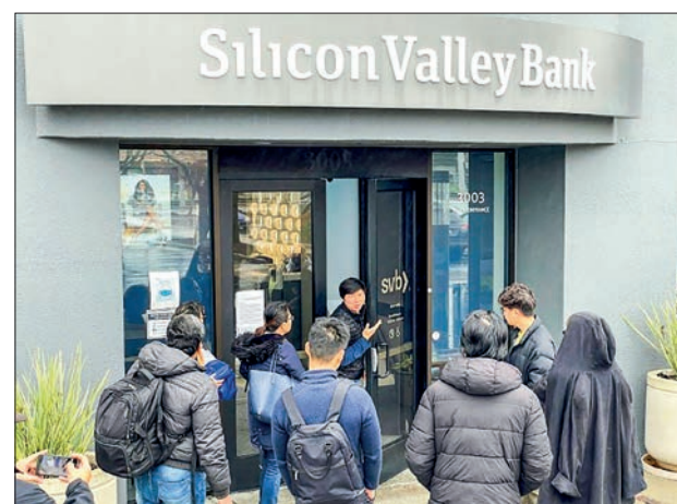
The closed Silicon Valley Bank (SVB) headquarters in Santa Clara, California.

nation's largest banks have been in urgent negotiations throughout the weekend, with the government, central bank and financial regulators all involved.