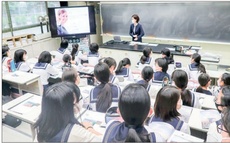
An official of Mitsubishi UFJ Morgan Stanley Securities Co gives a lecture at Toshimagaoka Joshigakuen Junior and Senior High School in Tokyo on 31 May 2022.

The government of Prime Minister Fumio Kishida has made an effort to encourage people to invest their wealth as it seeks to double the amount of investment income generat-