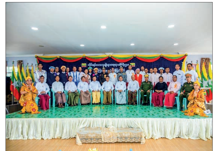
The Mon language textbooks presentation ceremony in progress in Mawlamyine on 18 March.

Next, officials presented cash assistance and ethnic rights protection bylaw books to officials of Mon Literature and Cultural Committee. The attendees enjoyed Hintha dance performed by Mon Cultural dance troupe and had documentary photo taken.—MNA/KZL