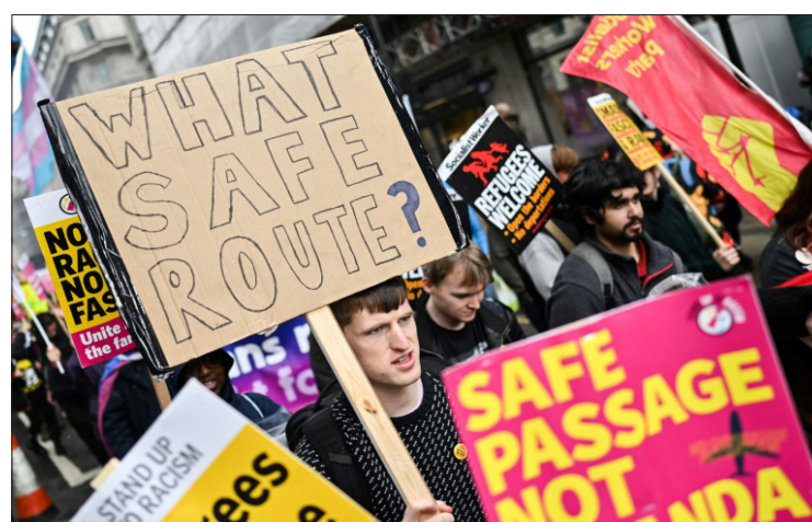
Britain wants to prevent people arriving illegally from seeking asylum before they are sent to a third country.

ANTI-RACISM protesters marched in London on Saturday to denounce the government's controversial plan to tackle cross-Channel migrant crossings by preventing arrivals from applying for asylum.