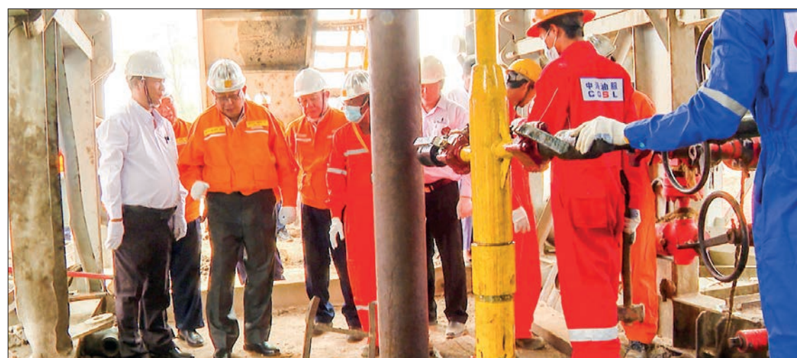
Union Minister for Energy U Myo Myint Oo views drilling of oil well in Minbu on 18 March.

The Union Minister said that in order to reduce the import of oil and oil products from abroad and in accordance with