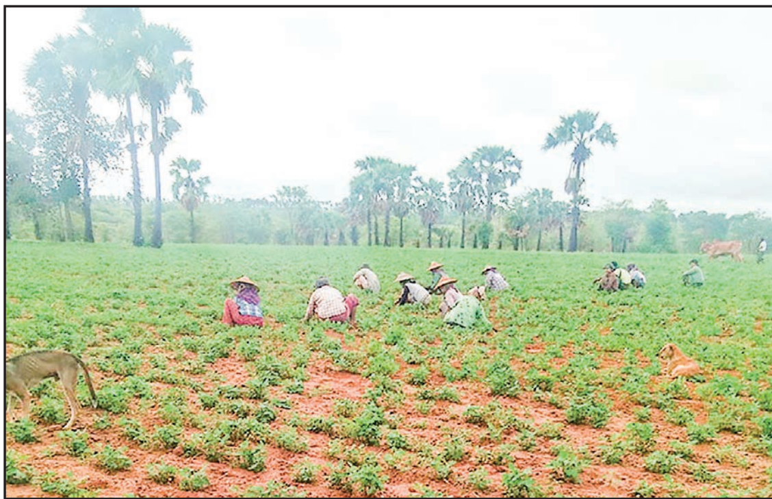
A peanut plantation in Yenangyoung Township.

PEANUTS from various regions entered the Mandalay Market these days and it has driven the peanut oil price down to K12,000 per viss, according to the traders in Mandalay.