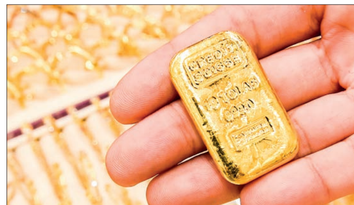
Pieces of gold on sales at the domestic gold market.

It is presented in the discussion that the gold price calculation in Myanmar is seen based on rumours, foreign currency changes in neighbouring countries, and traditional calculation methods without standardized weighting calculations as traded in global gold markets. Measures to make Myanmar gold exporting and trading more efficient, set quality and weight standards that local buyers and investors can assure, take legal action against those trading without licence, and eliminate price manipulation activities were also discussed. — TWA/CT