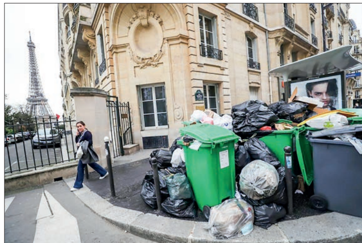
A woman passes by garbage left on the street near the Eiffel Tower in Paris, France, 17 March 2023.

OVER 10,000 tons of garbage has piled up in the streets of Paris due to the municipal sanitation workers’ strike against the government’s controversial pension