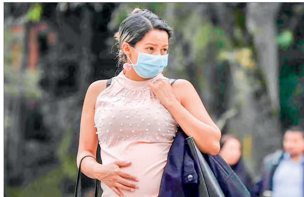
A pregnant woman wears a face mask as a preventive measure against the spread of the new coronavirus, COVID-19, as she waits for the bus in Bogota, on 16 March 2020.

ACCORDING to a new study, COVID-19-related stress had a larger impact on the mental health of pregnant women during the pandemic than