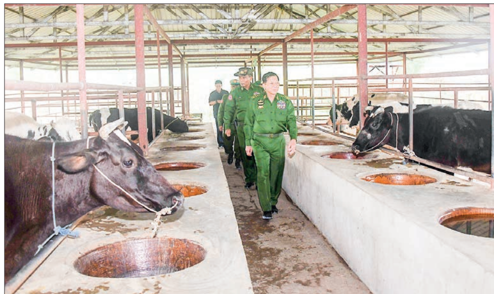
The Senior General views round livestock farms of integrated farm of North-West Command on 19 March.