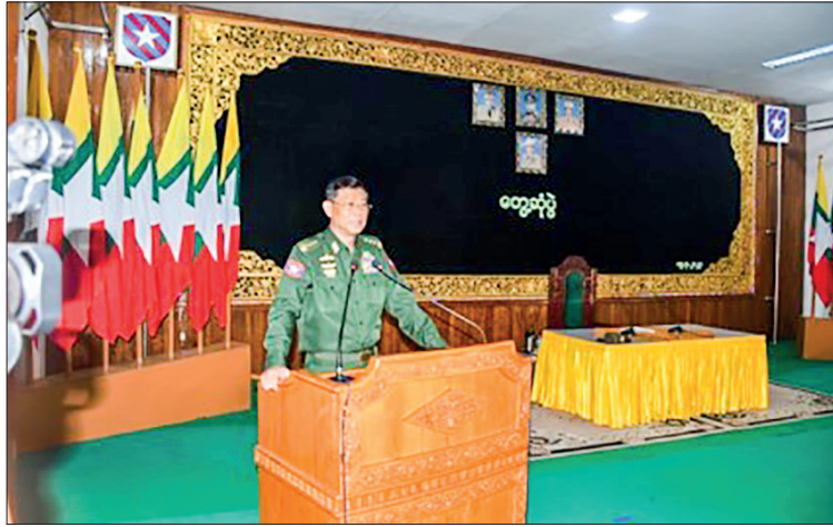
SAC member Deputy Prime Minister Union Minister for Defence General Mya Tun Oo meets Tatmadaw members and families at the hall of South-East Command HQ on 19 March.

Next, the General and officials attend the honorary award ceremony to mark the 49 th Anniversary of Mon State Day. Officials presented honorary awards to the winners.