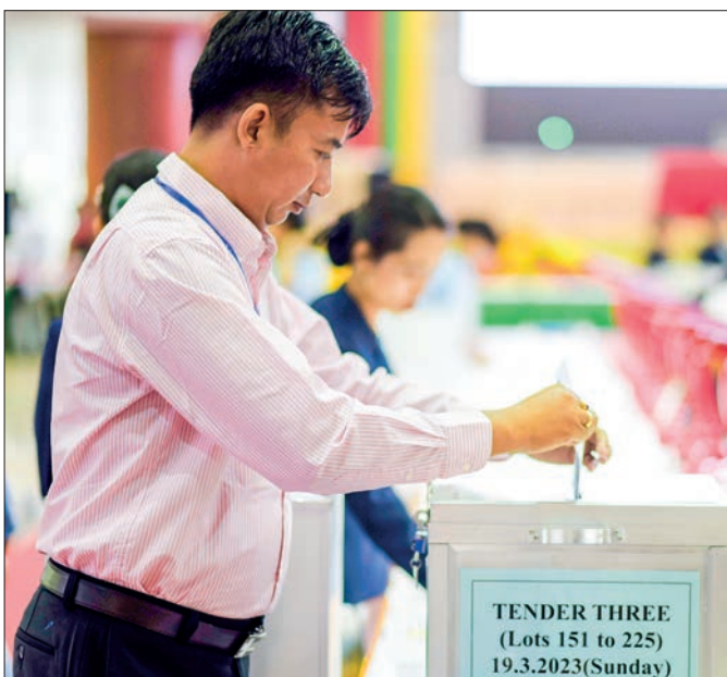
A merchant puts tender proposal into tender box.

Gem merchants check jade stones at 58 th Myanmar Gems Emporium in Nay Pyi Taw on 19 March.