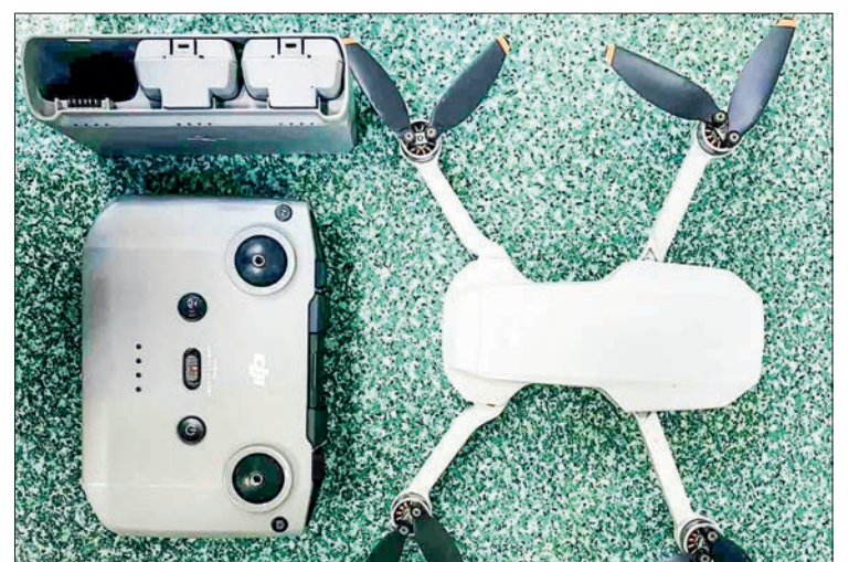
Photo shows seized Dji Mini 2 Drone.

Therefore, 18 arrests (estimated value of K281,408,796) were made from 15 to 18 March, according to the Illegal Trade Eradication Steering Committee. — MNA/KZW