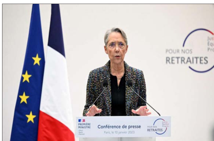
Borne evaded an interview question about whether she was ready to sacrifice herself for the pensions overhaul.

"Follow your dreams, nothing must slow the fight for