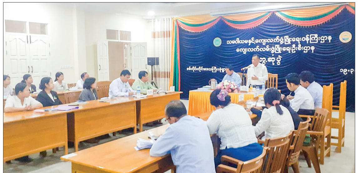
SAC member U Maung Ko and Union Minister for Cooperatives and Rural Development U Hla Moe meet departmental personnel in Monywa on 19 March.

Further, the Union Minister said that employees have to produce quality hybrid species for seeking the livestock market. It is necessary to conduct the value-added production manufacturing courses using domestic raw materials. He also pointed out rural water supply, lighting,