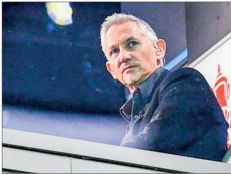
Gary Lineker returned to the BBC studios on Saturday.

Lineker was criticised for comparing the launch of the UK government's new asylum policy to the rhetoric of Nazi-era Germany. However, his removal sparked chaos across the BBC's sporting coverage as presenters, pundits and commentators showed their backing for Lineker by refusing to work. A compromise was reached on Monday as the two sides said they had agreed that Lineker would return to screens while the corporation launches an independent review into its social