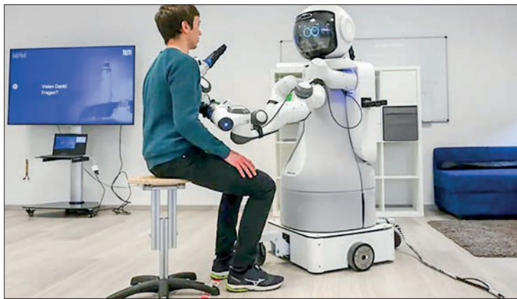
This picture shows the humanoid Garmi and a person interacting with each other.

Garmi is a product of a new sector called geriatrics, a discipline that taps advanced technologies like robotics, IT and