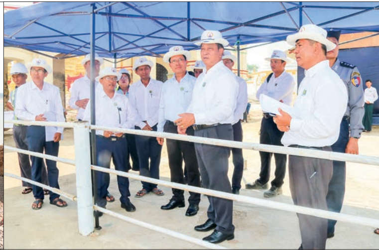
SAC member Deputy Prime Minister Union Minister for Transport and Communications Admiral Tin Aung San views preventive measures of bank erosion in Nyaungdon Township on 19 March.

STATE Administration Council Member Deputy Prime Minister Union Minister for Transport and Communications Admiral Tin Aung San and officials inspected the site of riverbank erosion prevention work at downstream Yankin Sanyar jetty in Nyaungdon, Ayeyawady Region yesterday,