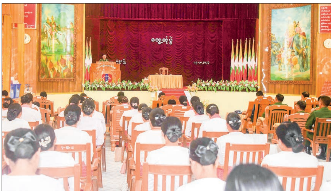
SAC Chairman Commander-in-Chief of Defence Services Senior General Min Aung Hlaing meets Tatmadaw members and families of Monywa Station at the hall of North-West Command Headquarters on 19 March.

In order to successfully hold the election, the country needs to restore peace. So, an emphasis is being placed on ceasing the armed conflicts and peace talks are being held with ethnic armed organizations. In this regard, the Tatmadaw adjusts the peace talks for having deserved measures for the State based on the wishes of meeting participants. Ethnic must have the rights to participate in the political platform so