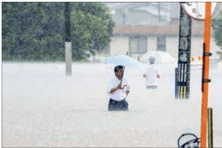
People walk on a flooded road in Kurume, Fukuoka Prefecture, on 10 July 2023, amid heavy rain.

One of the deceased was a man found after mud inundated at least seven houses in the city. He was among six people rescuers initially could not contact but have since been accounted for. — Kyodo