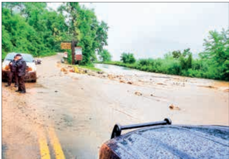
This handout image courtesy of the New York State Police shows heavy flooding and washout on State Route 9W of the Palisades Interstate Parkway in Rockland County, New York, 9 July 2023. PHOTO: NEW YORK STATE POLICE / AFP

The Orange County Emergency Management office on Monday confirmed one fatality in Highland Falls, in New York’s Hudson Valley, where “historic floods” caused significant damage. Local media said a woman was swept to her death in a flash flood in the valley as she tried to evacuate her damaged house with her dog. — AFP