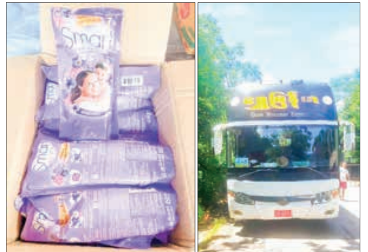
Confiscated illegal goods at the Mayanchaung permanent checkpoint.

combined team at the 16 th -Mile Kyaukchaw checkpoint confiscated a total of 0.214 tonne of timbers worth K236,060 without official documents that were hidden from under the bags of cauliflowers, watermelons, onions and rice from a Foton minibus (approximate value of K35 million) travelling from Mandalay from Muse. The action was taken under Customs procedures.