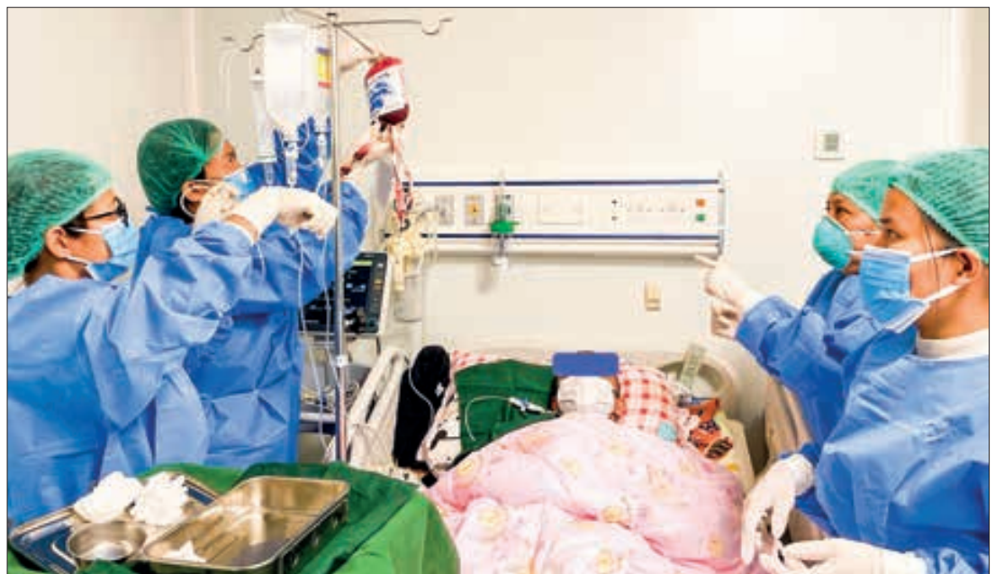
The HSCT operation is underway at North Okkalapa General Hospital.

The successful completion of HSCT operations by Myanmar specialists in public hospitals enables patients to receive treatment locally and save on medical expenses of going abroad for treatment. The Ministry of Health supports these operations by providing the necessary resources. — MNA/KTZH