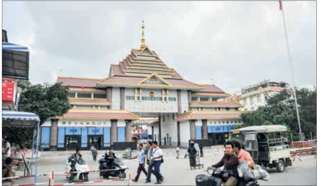
People are seen in front of the post of the Sino-Myanmar border.

The domestic consumption of edible oil is estimated at 1 million tonnes per year. The local cooking oil production is just about 400,000 tonnes. To meet the oil sufficiency in the domestic market, about 700,000 tonnes of cooking oil are yearly imported through Malaysia and Indonesia. — NN/EM