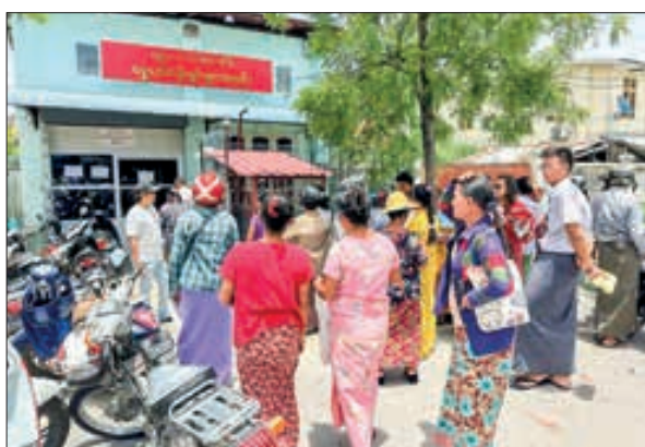
Buyers are pictured waiting for the purchase of gold at the MGEA office.