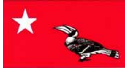
Flag of Khumi National Party