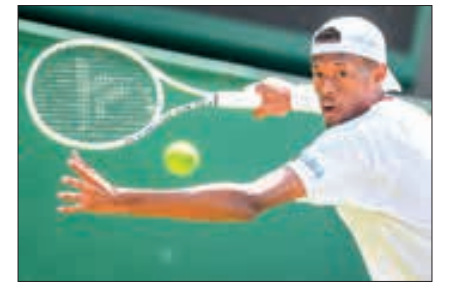
US player Christopher Eubanks returns the ball to Greece's Stefanos Tsitsipas during their men's singles tennis match on the eighth day of the 2023 Wimbledon Championships at The All England Tennis Club in Wimbledon, southwest London, on 10 July 2023.

Tsitsipas started strongly, breaking his 43 rd -ranked opponent twice in the first set but he was edged out in the second-set tie-break.