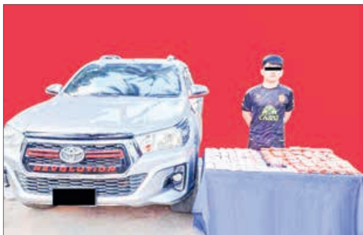
An offender is pictured along with seized drugs and a vehicle.

According to an investigation, the Happy Water will be distributed to young people at KTV/Club/Bar and restaurants in Tachilek Township. He is detained under the law. — MNA/KZW