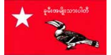
Emblem of Khumi National Party