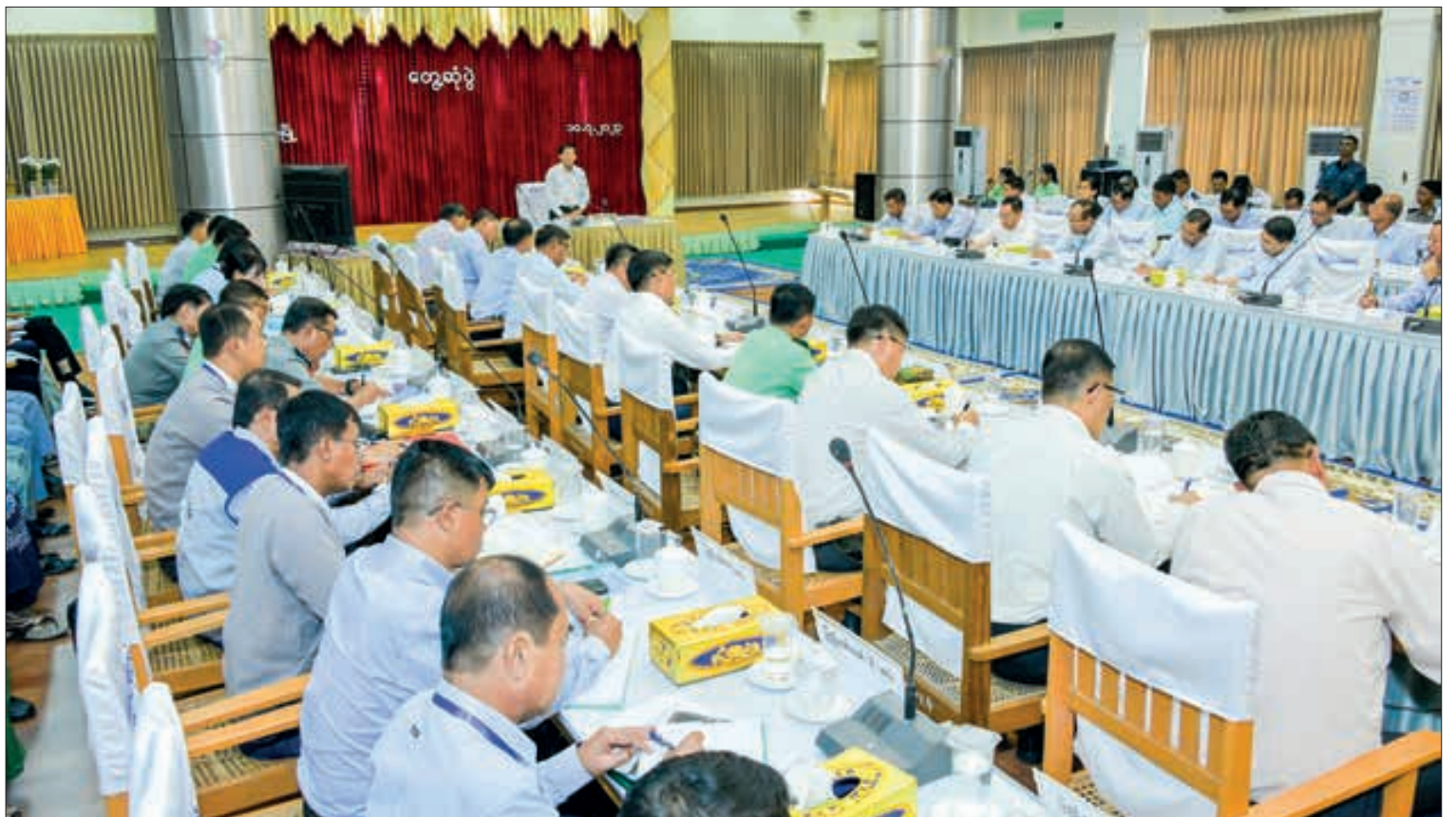
Senior General Min Aung Hlaing hears rehabilitation reports and gives guidance on further recovery measures at the meeting yesterday.

The Senior General stressed the need to rebuild basic education schools for learning areas of students and these can be changed as