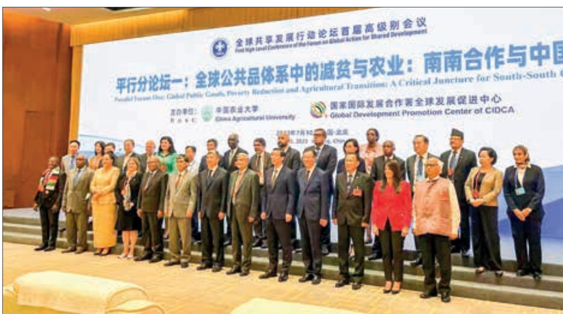
Union Minister Dr Kan Zaw poses for the documentary group photo at the event in Beijing on 9 July 2023.

The First High-Level Conference of the Forum on Global Action for Shared De-