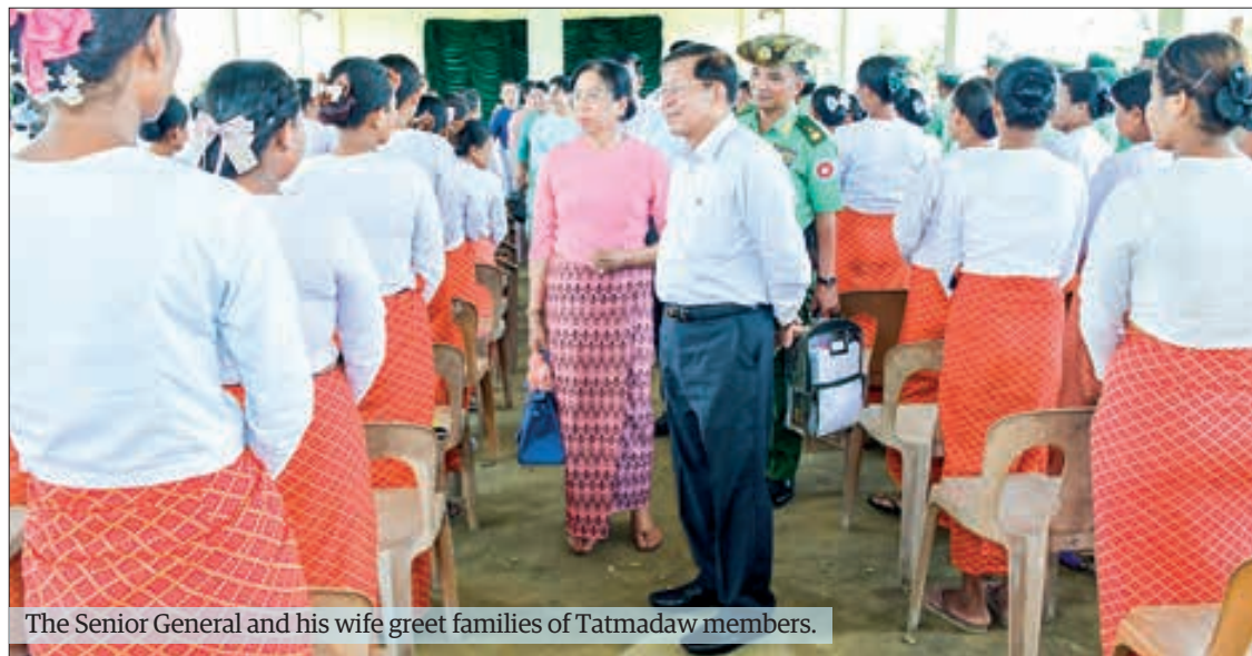
The Senior General and his wife greet families of Tatmadaw members.

the Commander-in-Chief Office and town elders from Rathedaung Township reported on losses and damage in the storm, supply of relief aid, a plan to build cyclone shelters, repair for religious buildings and recruitment