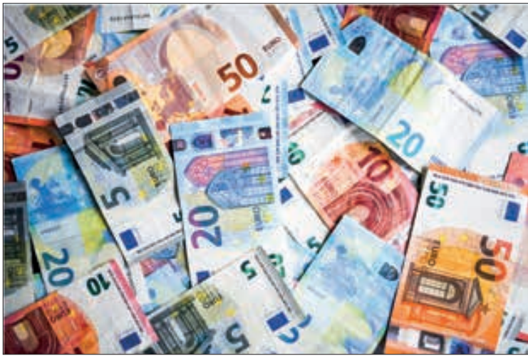
The photo shows Euro banknotes in Dortmund, western Germany, on 27 January 2020.

THE European Central Bank launched a survey Monday asking citizens to weigh in on the redesign of euro banknotes, with rivers, birds and European culture among the shortlisted themes.