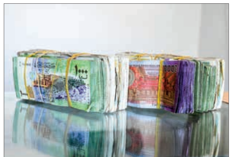
Syrian pounds are pictured at a currency exchange shop in the town of Atme in Syria’s rebel-held northwestern Idlib province, on 10 June 2020.

The pound’s collapse — from 5,000 to the dollar in October — has driven up the price of basic goods and aggravated hardship in a war-ravaged country hit by crippling shortages of fuel and electricity. — AFP