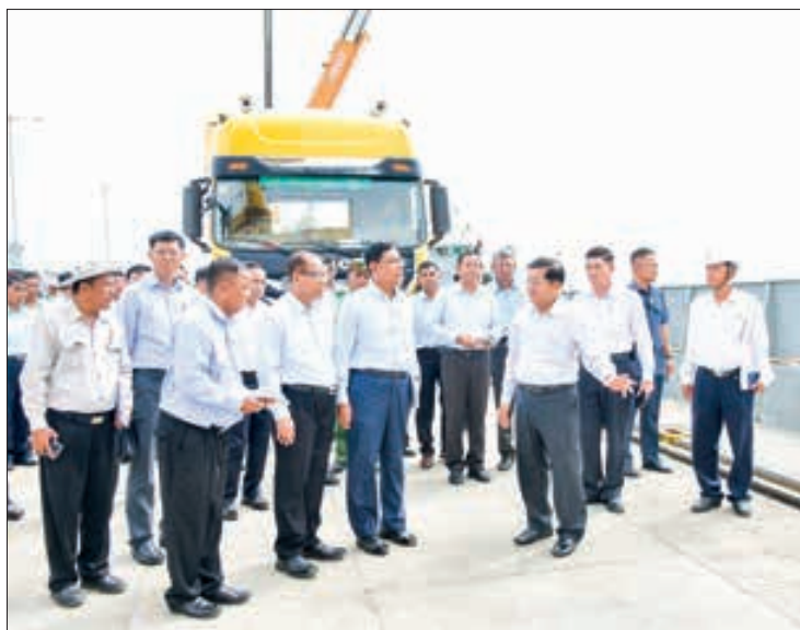
The Senior General and party are pictured during the inspection tours in Rakhine State yesterday.