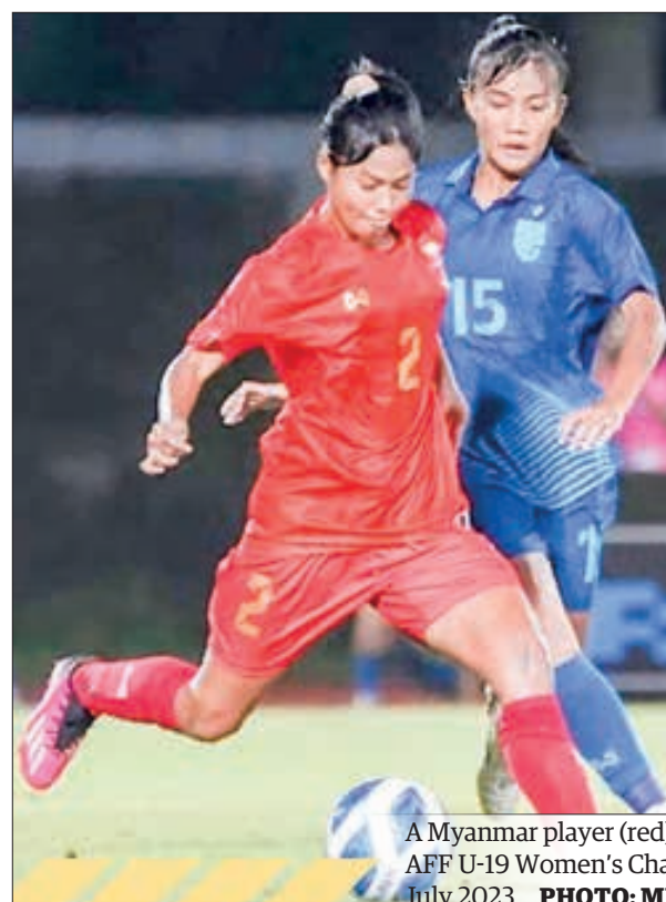
A Myanmar player (red) dribbles the ball against Thailand (blue) during the final group match of the AFF U-19 Women's Championship 2023 at Jakabaring Athletic Field, Palembang, Indonesia on 10 July 2023.

THE semifinal hope of the Myanmar U-19 women's football team is alive even though they faced a 0-1 loss to team Thailand in the final group match of AFF U-19 Women's Championship 2023 at Jakabaring Athletic Field, Palembang, Indonesia yesterday.