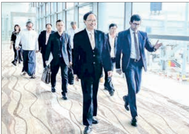
Union Minister Dr Thet Khaing Win seen before departing for Bangladesh yesterday.

AT the invitation of the Bangladeshi Government, a Myanmar delegation, led by Union Minister for Health Dr Thet Khaing Win, left Yangon for Bangladesh yesterday morning to attend the International Conference on Public Health and Diplomacy, which will be held on 11 and 12 July in Dhaka, Bangladesh.