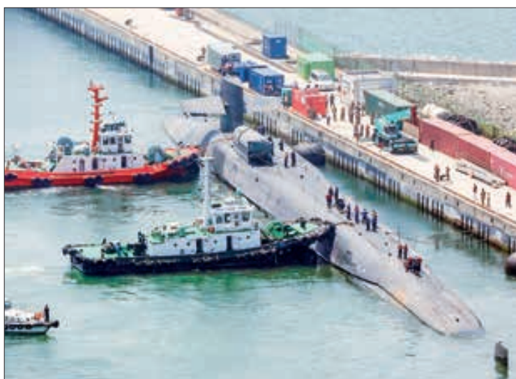
The USS Michigan, an Ohio-class nuclear-powered guided missile submarine, arrives at a South Korean naval port in the southeastern port city of Busan on 16 June 2023.

"There is no guarantee that such shocking accident as down-