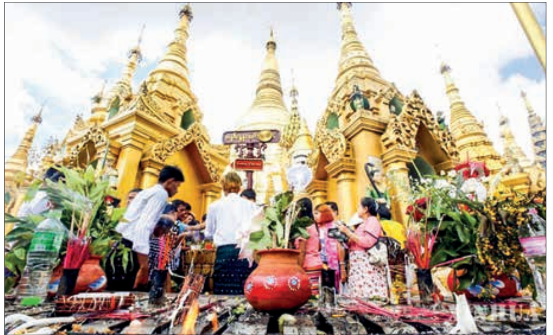
Pilgrims are seen donating water to pour onto the Buddha Image at the Sunday planetary post.

A total of 6.3 million pilgrims, including more than 38,000 foreigners, visited the Shwedagon Pagoda from January to the end of June this year, according to the Shwedagon Pagoda Board of Trustees.