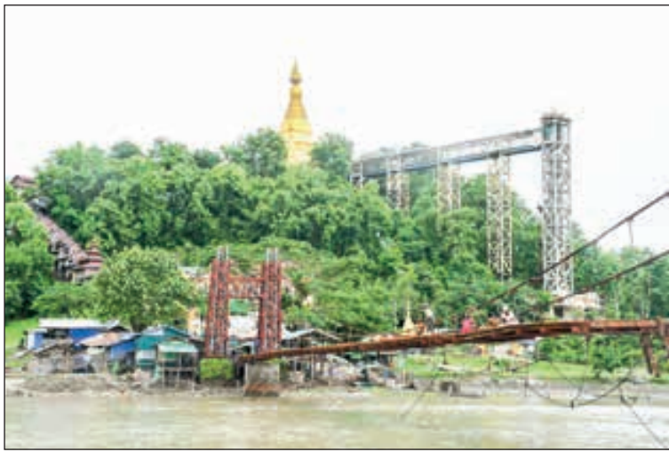
Deputy Prime Minister MoD Union Minister General Mya Tun Oo views the rehabilitation measures in Rakhine State yesterday.