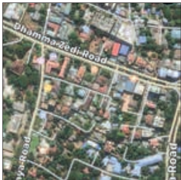
U Wisara Road and Dhammazedi Road are pictured on Google Maps.

During the flag-hoisting ceremony to be held at the secretariat from 5 am to 6 pm on 19 July, Theinbyu Road will be closed from Bogyoke Junction, Anawrahta Road from Bo Myat Tun Junction, Maha Bandoola Road from Pansodan Junction, and Bo Aung Kyaw Road from Merchant Junction. — TWA/MKKS