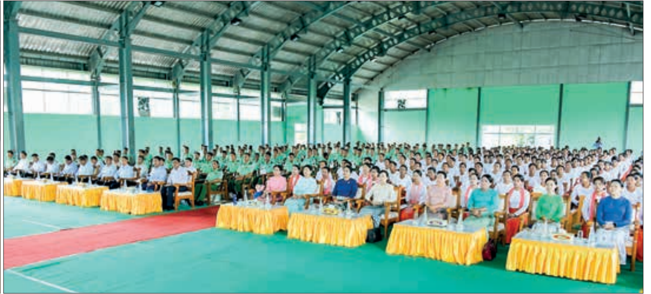
State Administration Council Chairman Prime Minister Senior General Min Aung Hlaing meets departmental personnel, town elders, Tatmadaw members and families from Buthidaung Township (above) and from Rathedaung Township (below) yesterday.

As local people are ethnics of the nation, residing in the same places through thick and thin, they all have to serve each other in fraternity so as to contribute to regional development, said Chairman of the State Administration Council Prime Minister Senior General Min Aung Hlaing at the separate meetings with departmental personnel, town elders, Tatmadaw members and families from Rathedaung and Buthidaung townships and relevant military stations of Rakhine State yesterday afternoon.