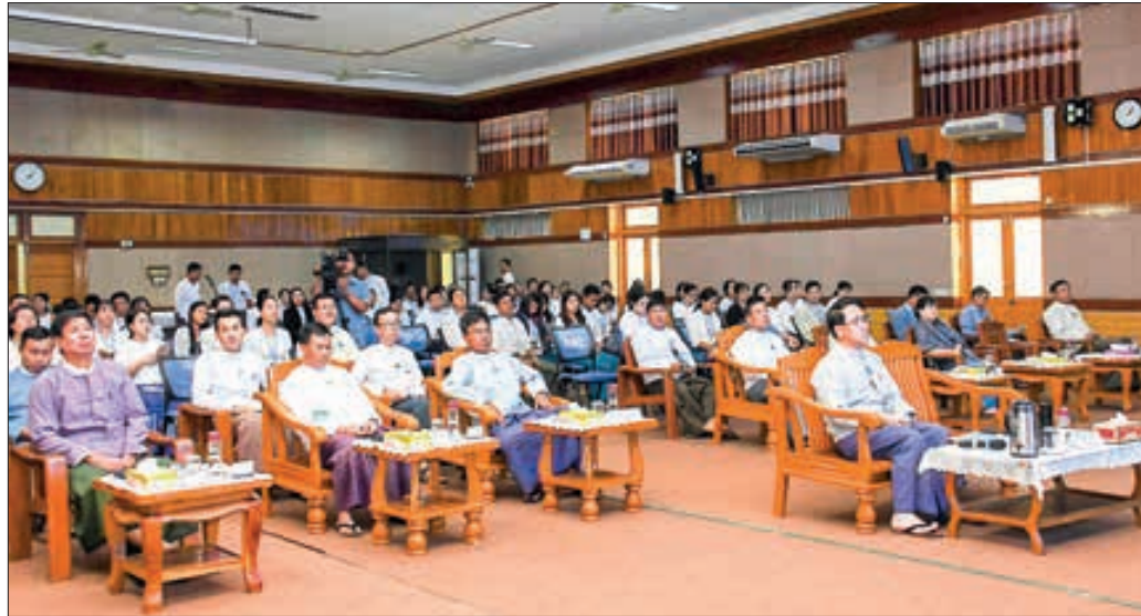
The second experience-sharing event of MoI personnel who returned from foreign trips in progress yesterday, attended by Union Minister U Maung Maung Ohn.