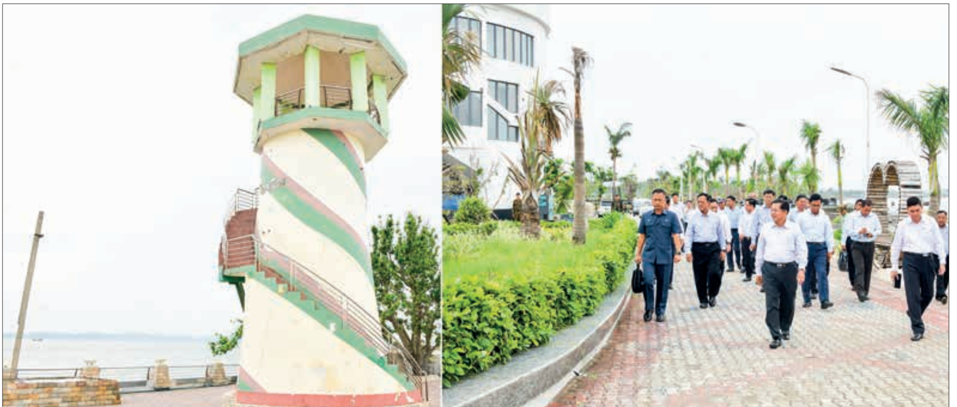
State Administration Council Chair Prime Minister Senior General Min Aung Hlaing views round the progress of rehabilitation measures of the viewpoint and Shukhintha Road in Sittway on 10 July 2023.

STUDENTS play a key role in the further development of Rakhine State in the future, said Chairman of the State Administration Council Prime Minister Senior General Min Aung Hlaing in inspecting the progress of rehabilitation measures in Sittway of Rakhine State yesterday morning.