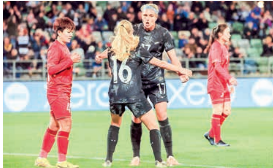
New Zealand's Hannah Wilkinson (2 nd R) congratulates teammate Jacqui Hand on her goal during the women's international friendly football match between New Zealand and Viet Nam ahead of the Women's World Cup 2023 football tournament, in Napier on 10 July 2023.

NEW ZEALAND broke their 10-game winless run on Monday with a confidence-boosting 2-0 friendly victory over Viet Nam on the eve of co-hosting the Women's World Cup. The Football Ferns shrugged off a miserable sequence of eight defeats and two draws dating back to September by dominating the Vietnamese in Napier.