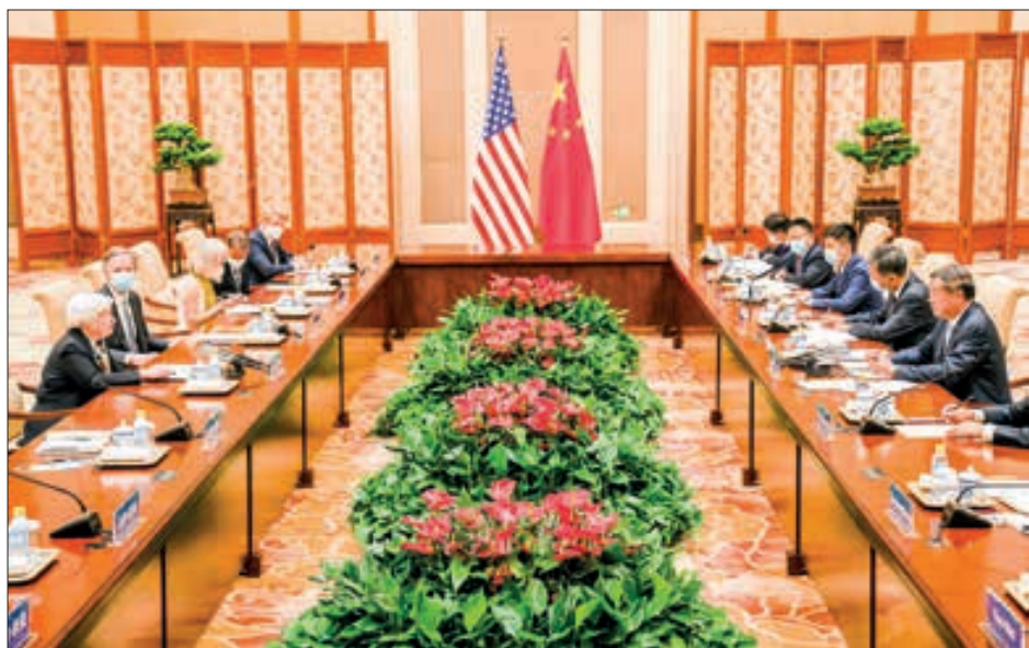
US Treasury Secretary Janet Yellen (L) attends a meeting with Chinese Vice-Premier He Lifeng (R) at the Diaoyutai State Guesthouse in Beijing on 8 July 2023.

MAJOR stock markets largely climbed Monday tracking more weak data from China and hopes that the country had ended a long-running crackdown on