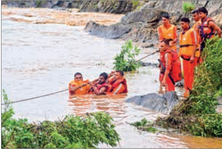
India's National Disaster Response Force (NDRF) personnel rescue fishermen from the swollen river Narmada after heavy monsoon rains in Jabalpur on 10 July 2023.

DAYS of intense monsoon rains across northern India have left at least 29 people dead, rendering many areas inaccessible with bridges smashed and roads blocked, officials said Monday. Television footage showed flash floods and landslides trig-