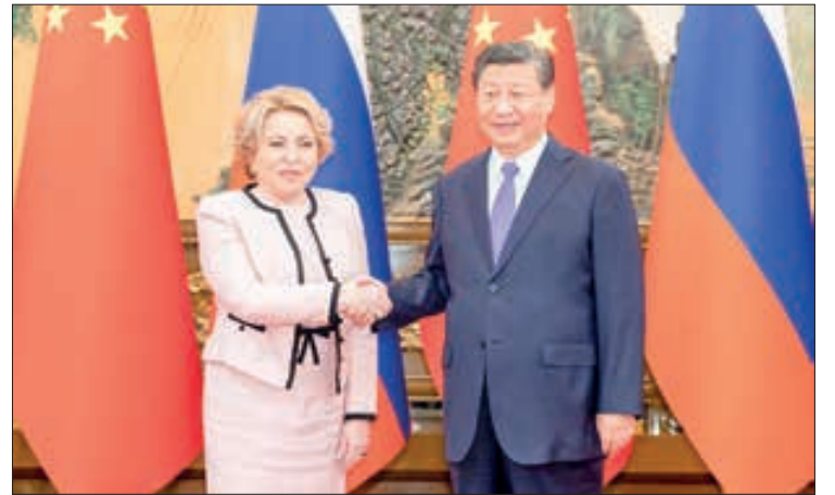
Chinese President Xi Jinping meets with visiting Russian Federation Council Speaker Valentina Matviyenko at the Great Hall of the People in Beijing, capital of China, 10 July 2023.

He called on the two sides to strengthen communication and coordination within multilateral mechanisms such as the Shang-