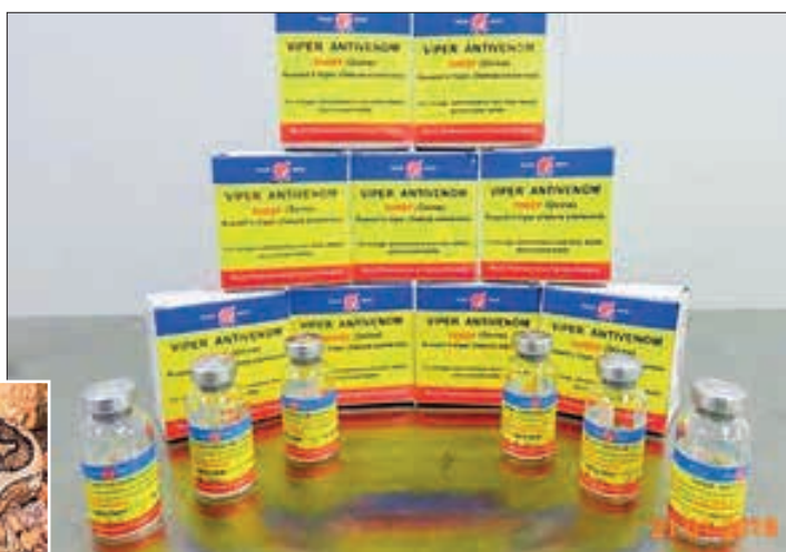
Photos depict a viper and anti-snake venoms manufactured by the pharmaceutical factory (Insein).

oms last longer and have higher quality, they are manufactured using a freeze-drying system, which is an Australian technology. Those who want to sell vipers and cobras can contact the pharmaceutical factory (Insein) at phone numbers 01-646273 and 01-646283. — TWA/CT