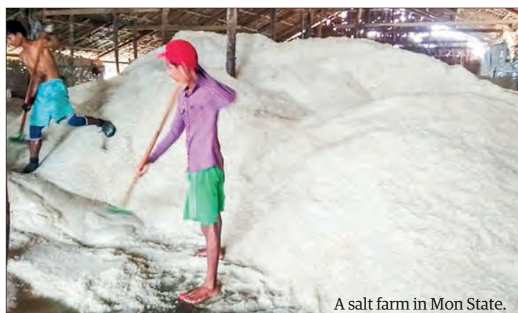
A salt farm in Mon State.

South Korea's annual salt production is about three million tonnes, but its salt demand has about 7 million tonnes. In an effort to expand the market, salt farmers have prepared to make sure the salt manufacturing is in compliance with the necessary criteria in order to export it to South Korea. — MT/ZS