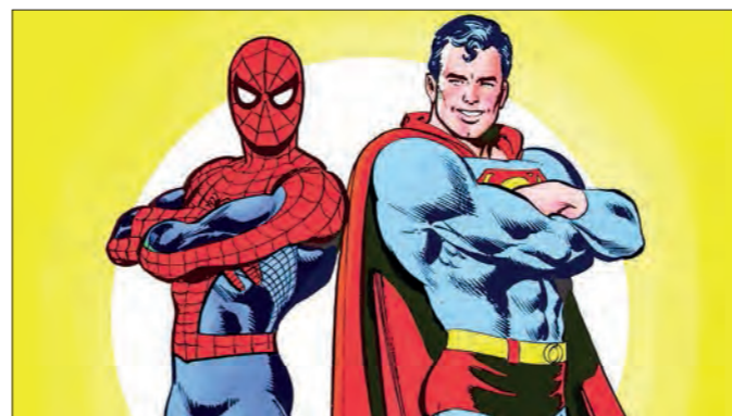
လက်ပိုက်ကြည့် / laot pite krany /