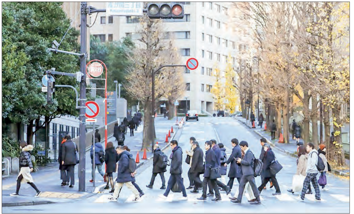
People go to work in Tokyo's Kasumigaseki district, where most government ministries are located, in December 2019.

If the chief Cabinet secretary and other relevant ministers accept the authority's recommendations, the aver-