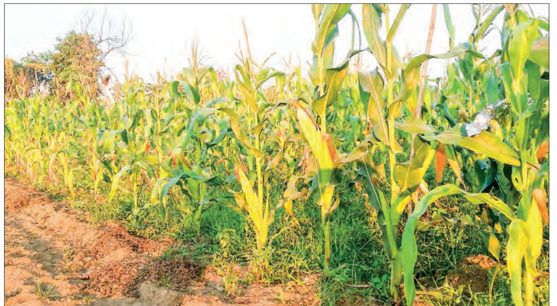
This photo shows a thriving corn plantation.

ONLY two weeks are left to export Myanmar's maize to Thailand with duty-free privilege.