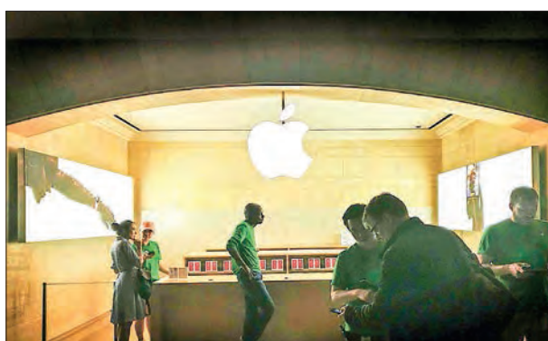
Apple said the changes mean developers will have a new fee structure for customers linking out of an app for offers and content.

The EU said the App Store terms prevented app developers from freely steering consumers to alternative ways to pay, making Apple the first ever tech firm to face accusations of breaching a new law known as the Digital Markets Act