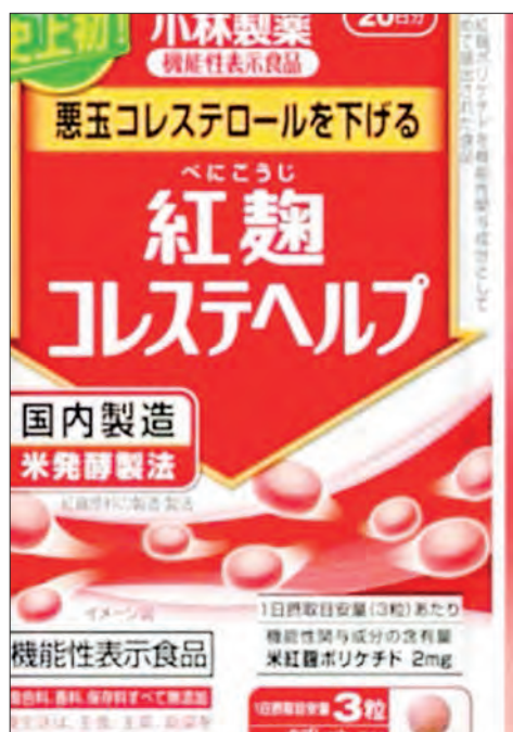
The three recalled brands – “beni koji choleste help” and two similarly named supplements – contain an ingredient called red yeast rice, or “beni koji”.