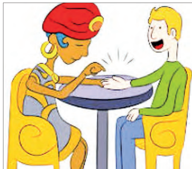
လက္ခဏာပါးရှား / lakhkanar parr sharr /