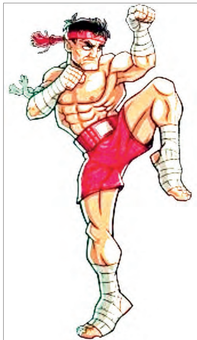
လက်ပမ်းပေါက်ခတ် / lakpam:paukhkat/