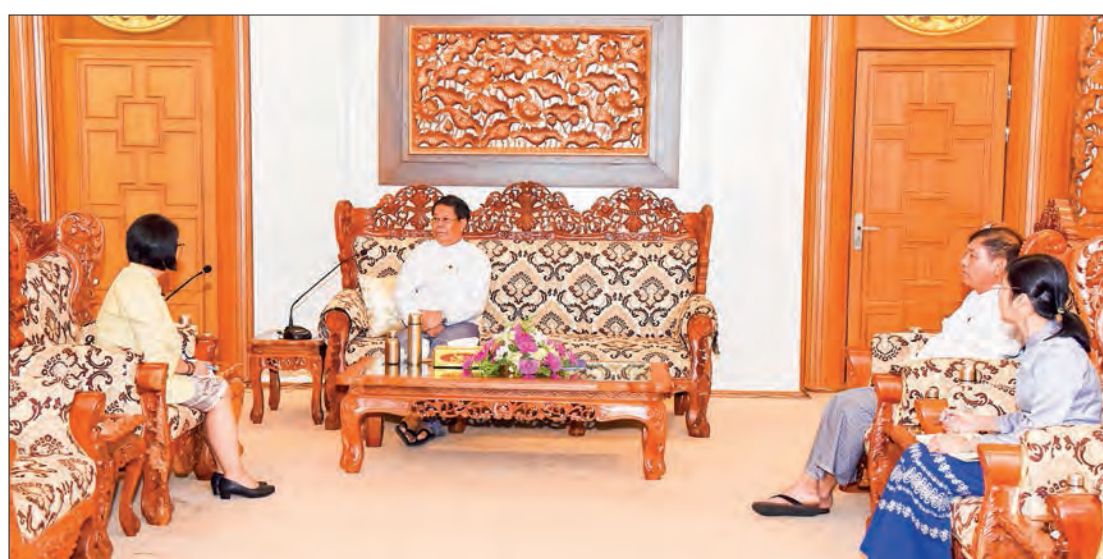
The UNHCR representative calls on Deputy PM MoFA Union Minister U Than Swe yesterday.

Attendees discussed violations of traffic rules, systematic monitoring, taking action, public awareness, first-aid courses, and the repair of traffic signs. — MNA/TTA