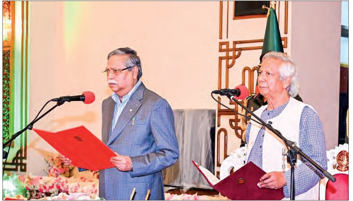
Muhammad Yunus takes oath as the head of Bangladesh's interim government in Dhaka, Bangladesh, 8 August 2024.

dissolved the parliament on Tuesday, paving the way for the