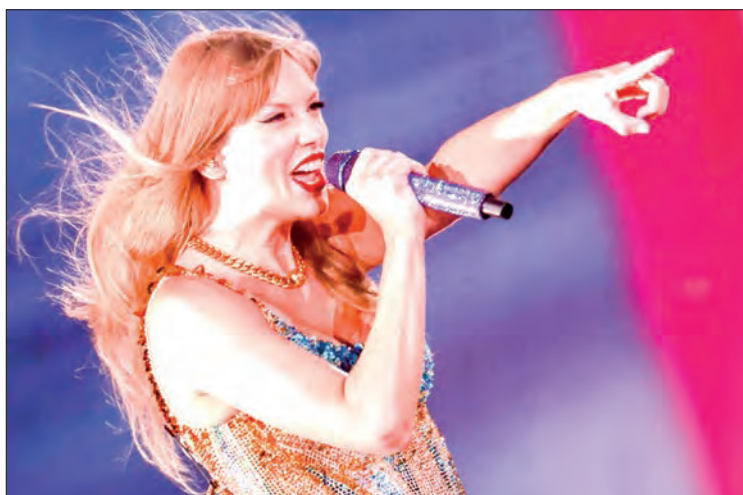
Three Taylor Swift concerts in Vienna were cancelled this week due to a thwarted terrorist plot targeting the events.

Austrian authorities announced the arrests of two suspects involved in planning the attacks, leading organizers Barracuda Music to cancel the shows at Ernst Happel Stadium for safety reasons. The concerts, part of Swift's Eras Tour, were expected to draw around 170,000 fans.