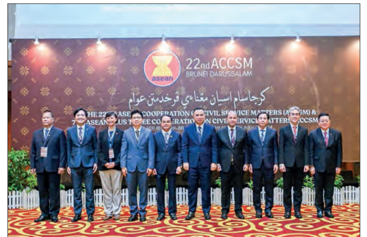
The commemorative group picture of the 22 nd Heads of ACCSM & Seventh ACCSM+3 Heads of Civil Service Meeting in Brunei Darrussalam.

During the meetings, the Heads of Civil Service discussed matters regarding civil