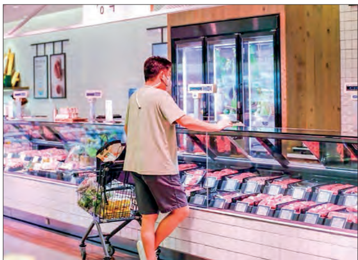
A man shops at a supermarket in Seoul, South Korea, 3 August 2022.

SOUTH Korea's state-run think tank on Thursday revised down the Asian economy's growth outlook for this year by 0.1 percentage point.