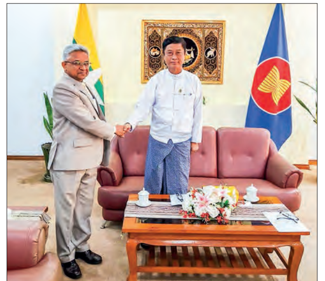
MoFA Deputy Minister U Lwin Oo shakes hands with Indian Ambassador Mr Abhay Thakur yesterday.

DEPUTY Minister for Foreign Affairs U Lwin Oo received Mr Abhay Thakur, Ambassador Extraordinary and Plenipotentiary of the Republic of India to the Republic of the Union of Myanmar, yesterday at the Ministry of Foreign Affairs in Nay Pyi Taw.