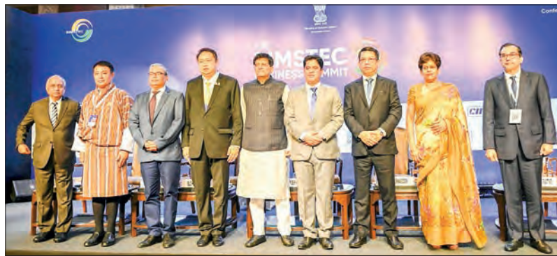
Deputy Minister for Commerce U Min Min poses for the documentary group picture at the BIMSTEC business summit in India.

The deputy minister emphasized discussions on diverse businesses, economic development and enhancement of competitiveness in the economic sector, which are potential outcomes of the international reform process of the BIMSTEC