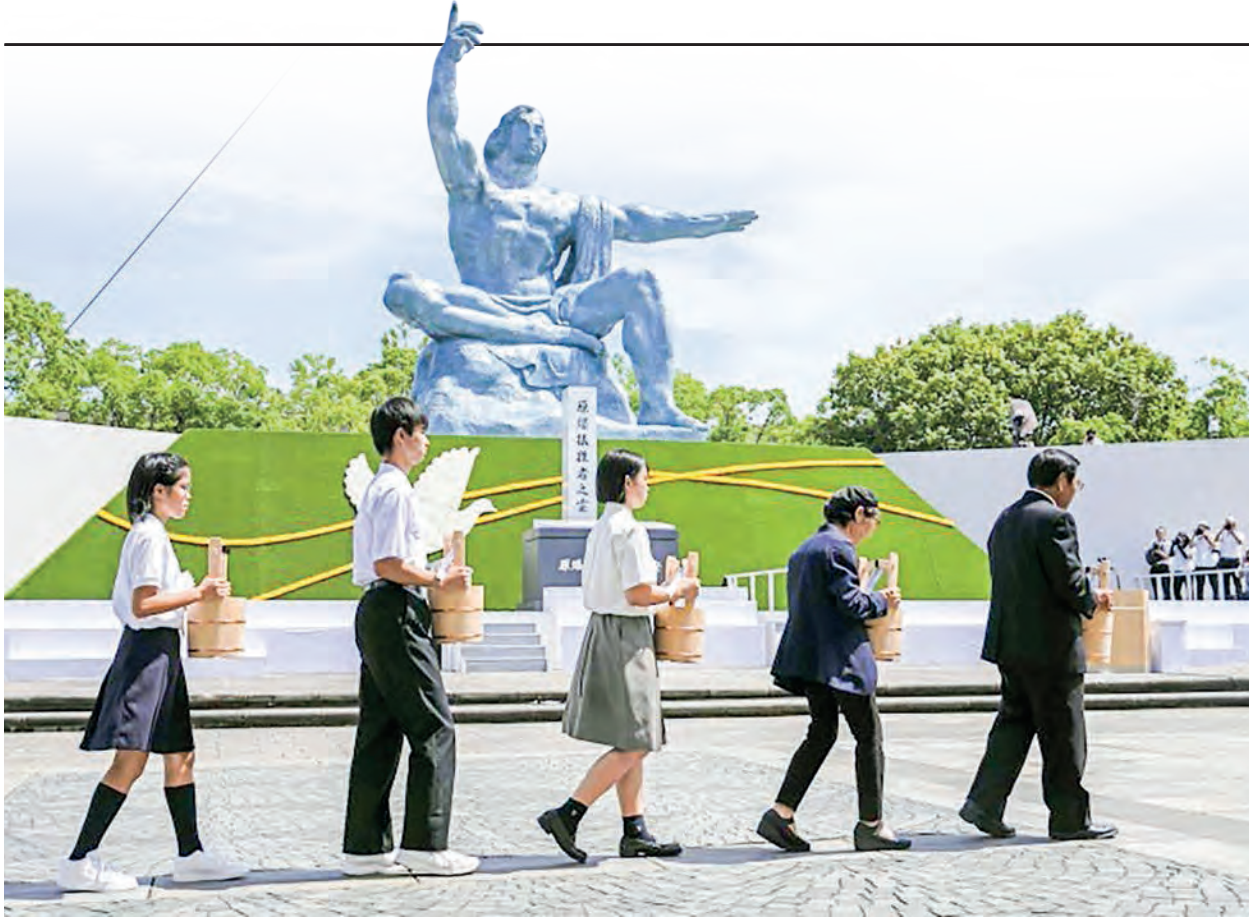
Representatives of bereaved families and atomic bomb victims offer water at Peace Park in Nagasaki on Friday morning.