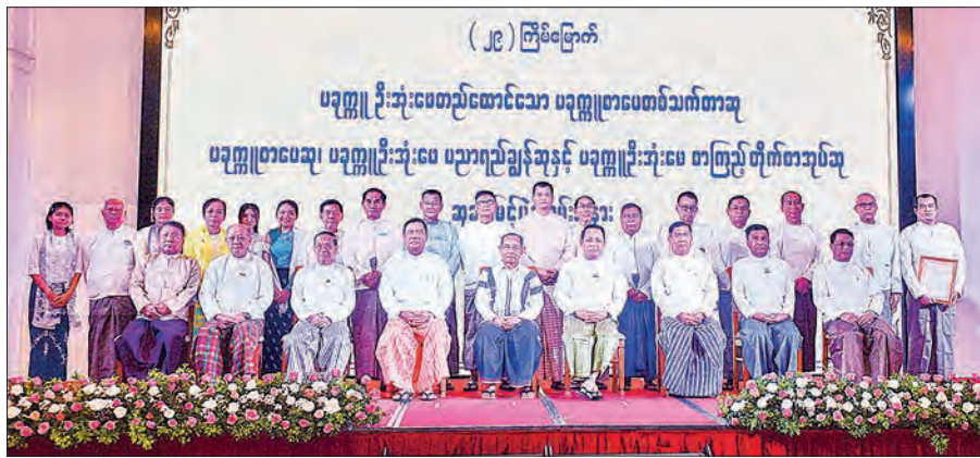
This photo depicts the winners of the 29 th Pakokku Literary Award.

THE Pakokku Literary Award Fund Supervisory Committee has announced that the 30 th Pakokku Literary Award Ceremony will be held on 24 August, following the announcement of the award winners for the respective genres on 1 June.