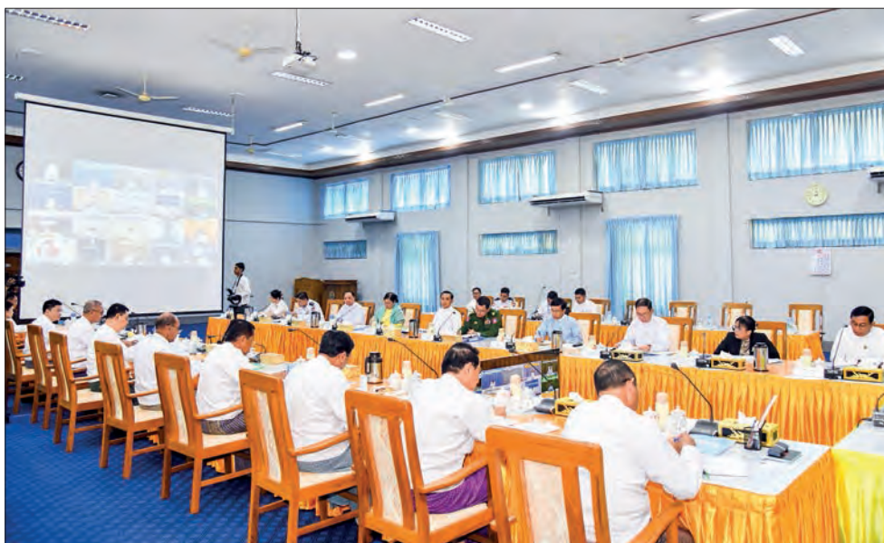
SAC Member Deputy PM Union Transport & Communications Minister General Mya Tun Oo addresses the third coordination meeting of the National Road Safety Council yesterday.

As such, he underlined subcommittees and region/state councils have to emphasize the implementation of