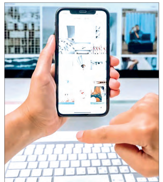
Supporters, including South Africa, see it as a significant step forward, offering technical assistance to countries with less developed cyber infrastructures.

The new treaty would enter into force once it has been ratified by 40 member nations and aims to “prevent and combat cybercrime more efficiently and effectively”, notably regarding child sexual abuse imagery and money laundering. — AFP