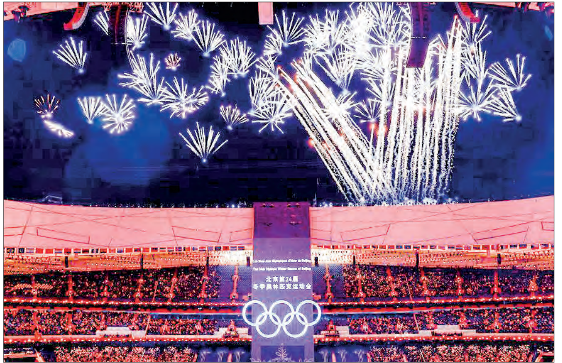
More than a billion people watched the opening ceremony.

The Paris Olympics closing ceremony on Sunday is set to be a dramatic event, featuring a possible death-defying stunt by Tom Cruise on the roof of the Stade de France.