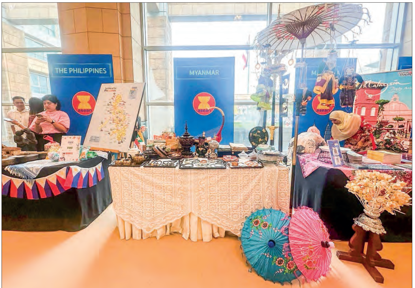
Prominent Myanmar cultural artefacts on display at the Myanmar Embassy's exhibition booth in Bangkok, Thailand, on 8 August 2024.

The 57 th Anniversary of ASEAN Day was celebrated in Bangkok at the Thai Ministry of Foreign Affairs, with Myanmar making a notable contribution to the festivities on 8 August 2024. The occasion celebrated ASEAN's enduring unity and achievements, and Myanmar was prominently involved in the festivities.