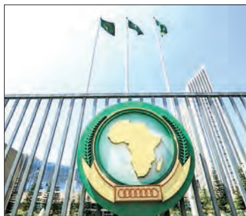
The African Union logo is seen outside the AU headquarters building in Addis Ababa, Ethiopia, on 8 November 2021.

The pan-continental body, which has 55 member states, will hold elections at its summit in February to choose a successor to Moussa Faki Mahamat as chair of the African Union Commission. This year the role is reserved for a representative from East Africa to replace Faki, a veteran politician from Chad who has served