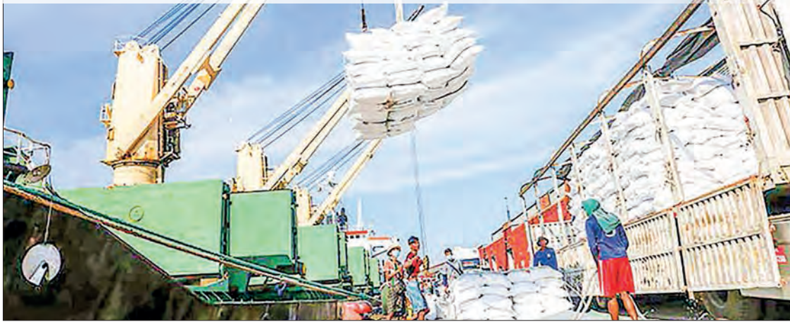
Export rice bags are seen being loaded onto the ocean-going merchant vessel at Yangon Port.

has been cooperating with departments and institutions concerned to achieve export targets and beyond depending on the supply volume of rice, broken rice, pulses, corn, rubber and fisheries from the respective