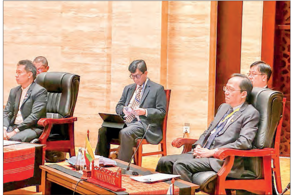
Union Minister Dr Thet Khaing Win (R) attends the 16 th ASEAN Health Ministers' Meeting in Vientiane, Laos, from 8 to 10 August 2024.

The Union minister recounted that the 2022-23 report of WHO recorded