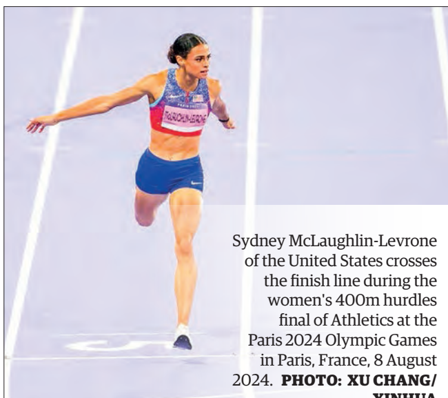
Sydney McLaughlin-Levrone of the United States crosses the finish line during the women's 400m hurdles final of Athletics at the Paris 2024 Olympic Games in Paris, France, 8 August 2024.

AMERICAN sprinter Sydney McLaughlin-Levrone broke her own world record as she clinched gold in the women's 400m hurdles at the Paris Olympics on Thursday. McLaughlin-Levrone won the final in 50.37 seconds at Stade de France, eclipsing her previous record of 50.65 set in June. Fellow American Anna Cockrell took silver in 51.87 while Femke Bol of the Netherlands claimed bronze in 52.15.