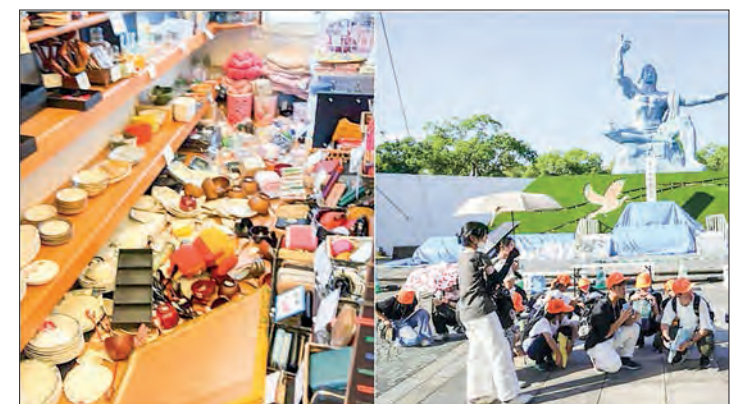
A magnitude-7.1 earthquake struck off Japan's southern coast.

Due to the quake, tsunamis of a metre in height are possible to happen on the coast of Kyushu and the coast of the island of Shikoku, as warned by the Japan Meteorological Agency. — MT/ZS