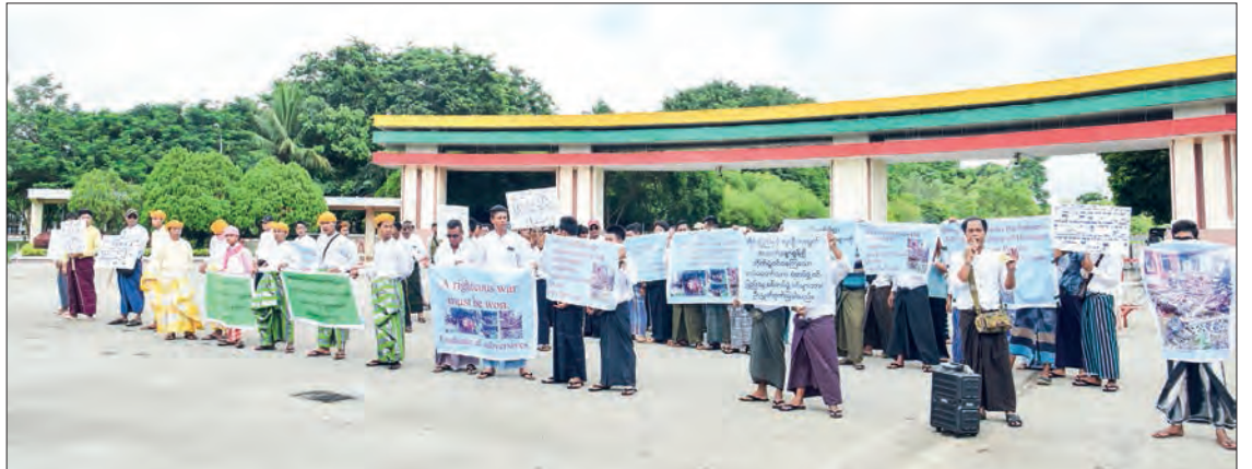
Protest against MNDAA's terrorist acts in action yesterday in Nay Pyi Taw.

They then peacefully demonstrated with slogans such as: "Stop terrorist activities of MN-