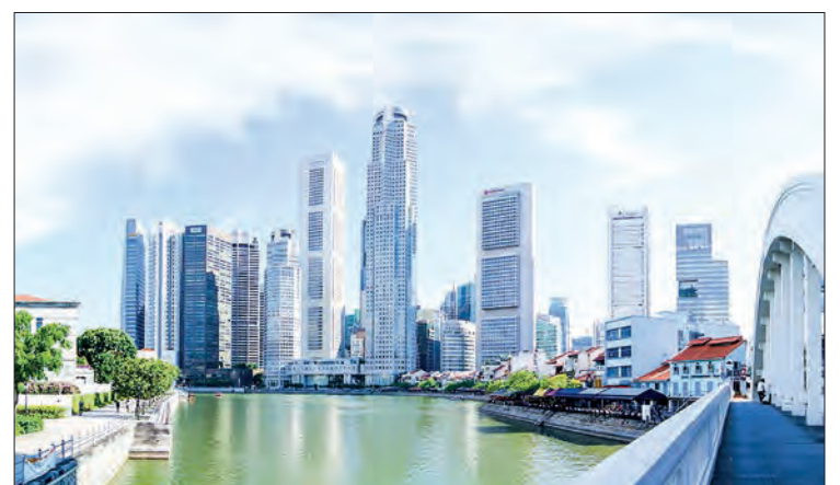
Skyscrapers near Singapore River, as viewed from Elgin Bridge.

Loh also noted that SGX will work closely with the review group set up by the Monetary Authority of Singapore to recommend measures to strengthen equities market development. — Xinhua