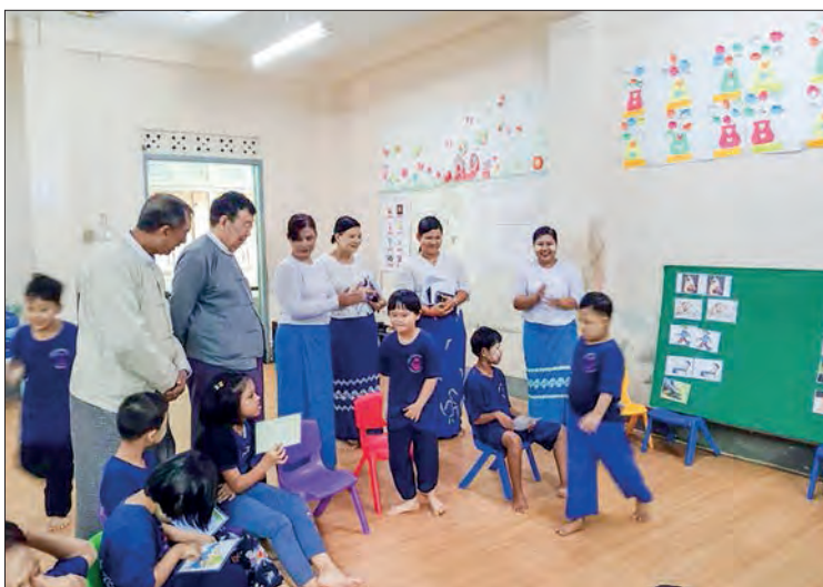
MNHRC members views round the School For Children with Disabilities in Yangon yesterday.

MNHRC will inform the relevant department of its findings and recommendations for necessary actions in accordance with the MNHRC law. — MNHRC