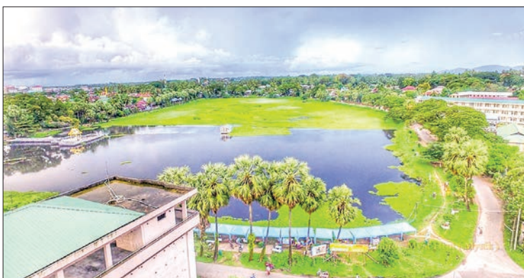
This photo shows Kandaw Mingala Lake in Myeik Township, site of an upcoming floating solar power plant.

In the floating solar power plant construction project, 7,488 solar panels will be installed to generate 4.08 megawatts of solar energy, and 16 inverters will be mounted in the solar energy project. — ASH/MKKS