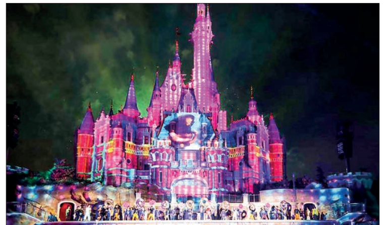
This photo taken on 19 December 2023 shows the opening ceremony of the world's first Zootopia land in Shanghai Disney Resort of east China's Shanghai.

The resort's current expansion projects also include a third Disney-themed hotel, according to the company. — Xinhua