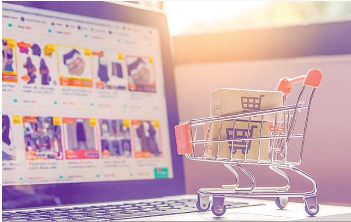
The image shows a variety of shopping sites on the computer screen.

The validity of registration granted starting from 1 January 2024 is two years. The registration fees are set at K70,000 for companies or commercial institutions, with a renewal fee of K70,000 and an amendment fee of K3,000. Those companies or commercial institutions holding the SME certificates have to pay K50,000 for registration, K50,000 for renewal and K3,000 for amendment fees. Individuals will be charged K30,000 for registration, K30,000 for renewal and K3,000 for amendment fees. — NN/KK