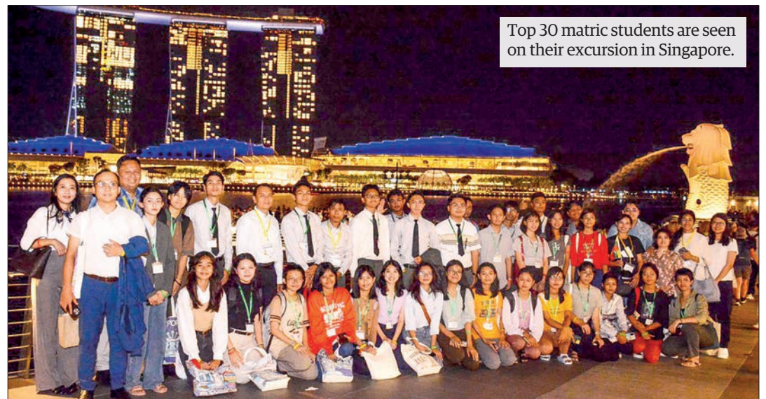
Top 30 matric students are seen on their excursion in Singapore.

THE government arranged an excursion abroad for 30 top-marked students in relevant subject combinations in the 2024 matriculation examination and their supervisors.