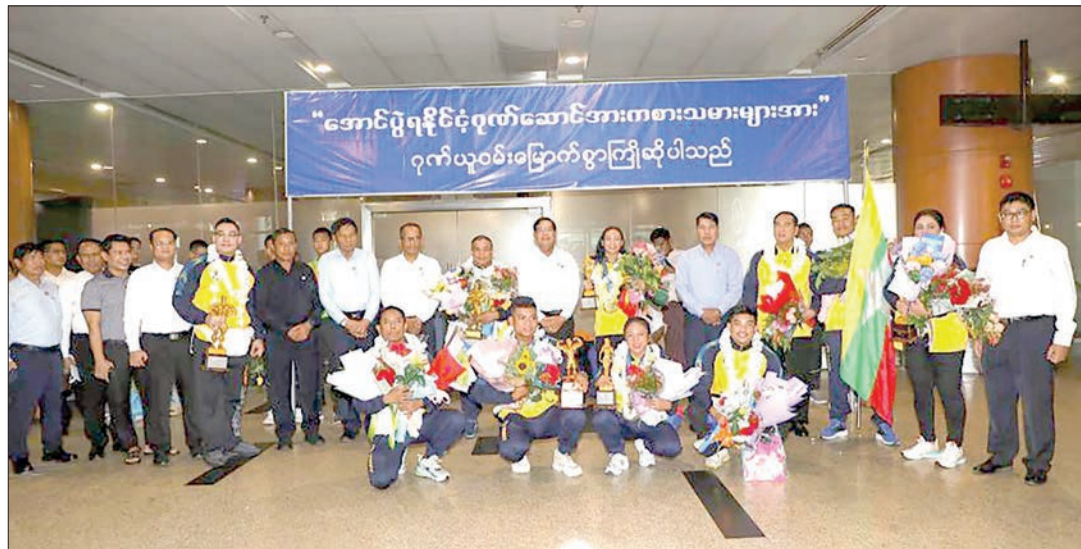
Yangon Region Chief Minister U Soe Thein poses for a documentary photo together with victorious athletes at Yangon International Airport.

THE 56 th Asian Bodybuilding and Physique Sports Championship took place in Batam Island of Indonesia from 6 to 12 August.