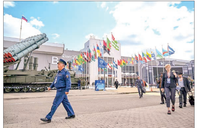
Military officials from foreign states and visitors gather for the 10 th International Military-Technical Forum Army-2024 at Patriot Congress and Exhibition Centre in Moscow region, Russia. PHOTO: SPUTNIK

The forum will once again bring together representatives from Russian and foreign armed forces, allowing defence and national security experts to strengthen cooperative ties, the statement said. — Sputnik