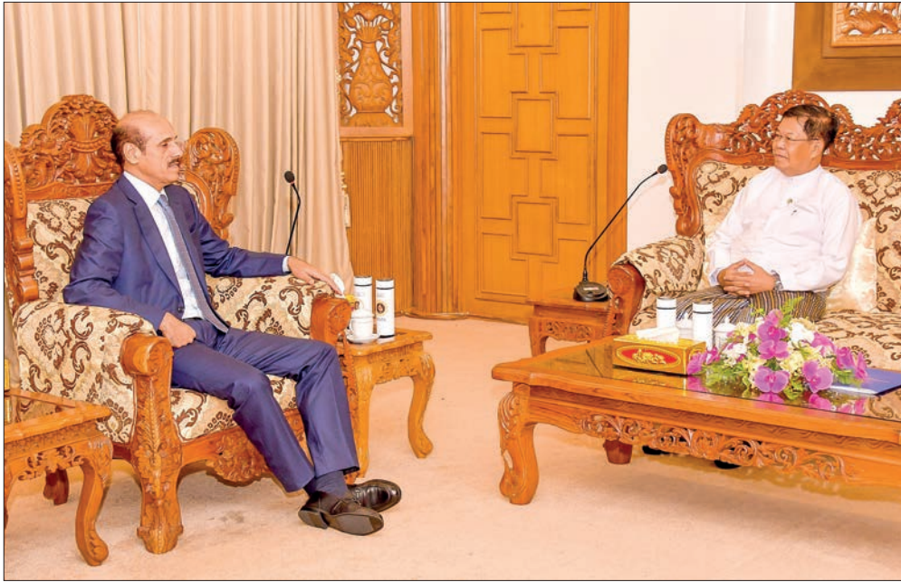
Deputy Prime Minister Union Foreign Affairs Minister U Than Swe receives Mr Mubarak M A Aladwani, Ambassador of Kuwait, yesterday.