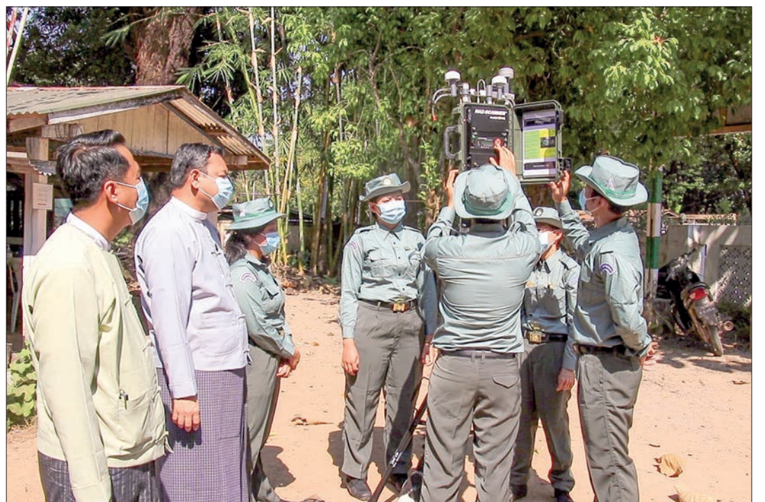
The Environmental Conservation Department is evaluating AQI with the Haz scanner machine.

The Environmental Conservation Department noted that test results were influenced by factors such as air temperature, wind speed, wind direction, humidity, rainfall, vehicle emissions, and industrial pollution, and therefore, air quality levels may fluctuate. — TWA/TMT