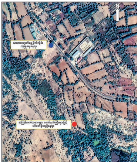
Location map of the attack.