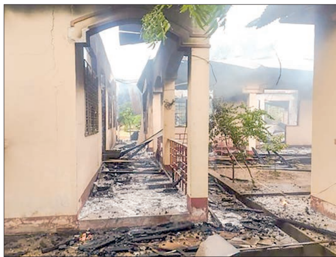
The vest factory in Taungtha is seen in the aftermath of the fire set by PDF terrorists.

TERRORISTS exploded the public roads and bridges in addition to disturbing government's projects, launching arson attacks on governmental buildings, schools and houses. They also engaged in fighting and dropped bombs on the villages aiming to deteriorate the state stability and rule of law, economic growth, trade flows and socioeconomic status of people.