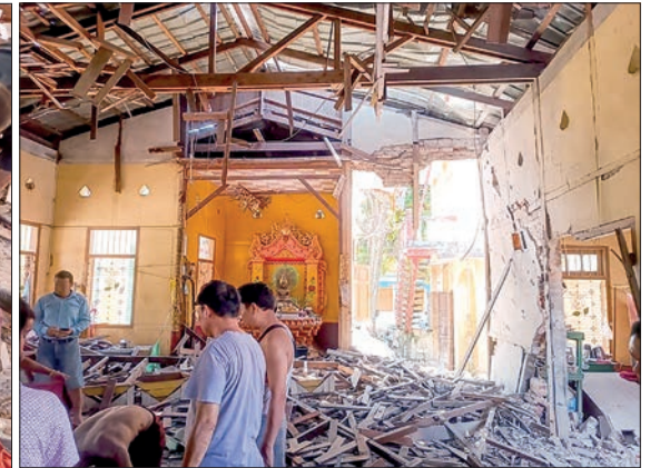
The damage is seen at the Myahninsi monastic facility hit by the shell blast.

brutally launched attacks in towns and villages using heavy weapons and rockets. They also destroyed religious buildings, departmental buildings, houses