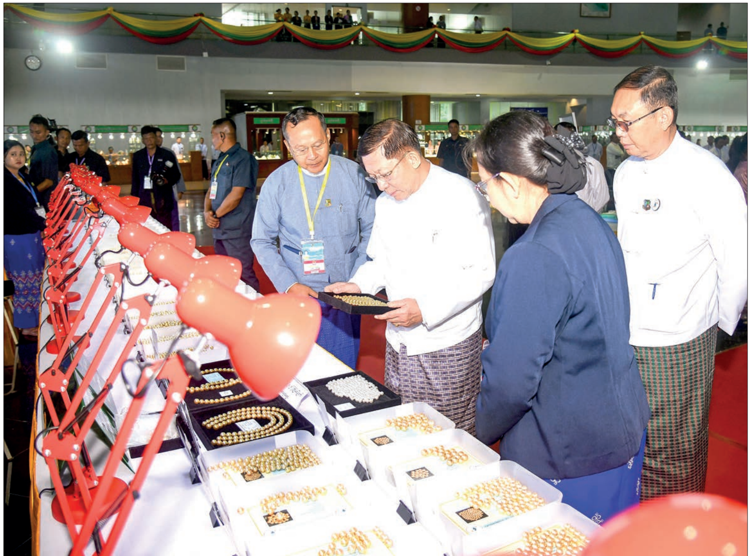
State Administration Council Chairman Prime Minister Senior General Min Aung Hlaing looks into the pearl lots at the opening of the 142 nd Myanmar's South Sea Pearl Emporium yesterday.

be held from 12 to 15 August, will sell 700 lots of 175,000 pieces of South Sea pearl through the open tender system.