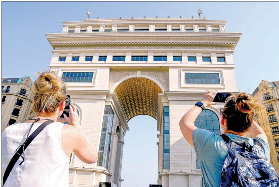
This photo taken on 1 March 2024 shows tourists taking pictures of the Elysee Commercial Centre building in the Paris-style development along the Bassac river in the satellite city of Koh Pich in Phnom Penh.

upon arrival, and within seven days before their arrivals, passengers are required to fill in their immigration, health and customs declarations in one form at the Cambodia e-arrival app.