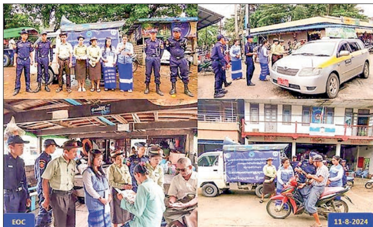
Images showcase awareness-raising activities being implemented by the Disaster Management Department in Konsulay village and Yekyaw village in Ayeyawady Region on 11 August 2024.