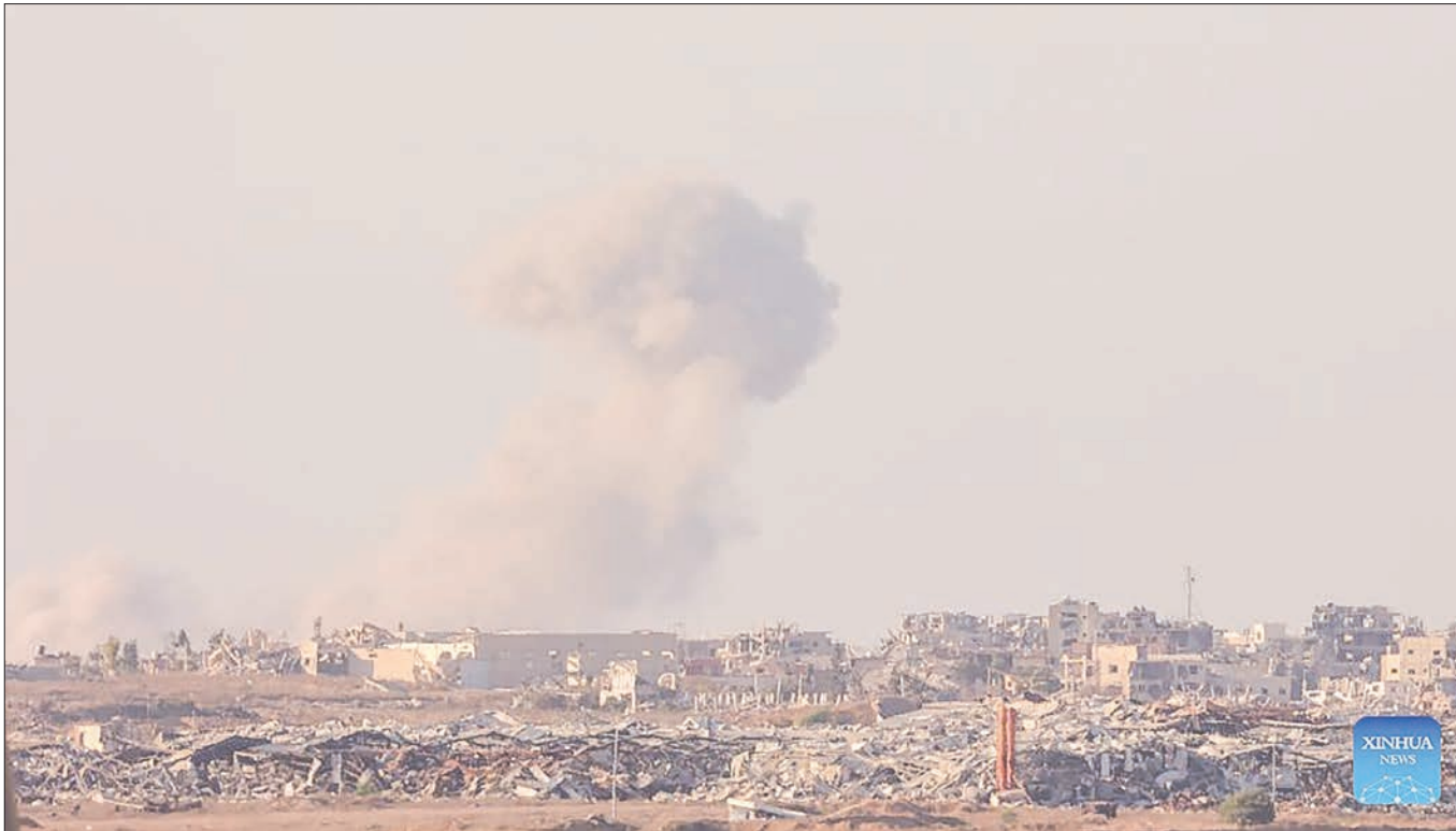
This photo taken on 11 August 2024 shows destroyed buildings in the Gaza Strip, as seen from Israel's southern border with the Gaza Strip. Hamas on Sunday called on mediators of the Gaza ceasefire to put forward a plan to implement what they had approved before instead of going to more rounds of negotiations or introducing new proposals.