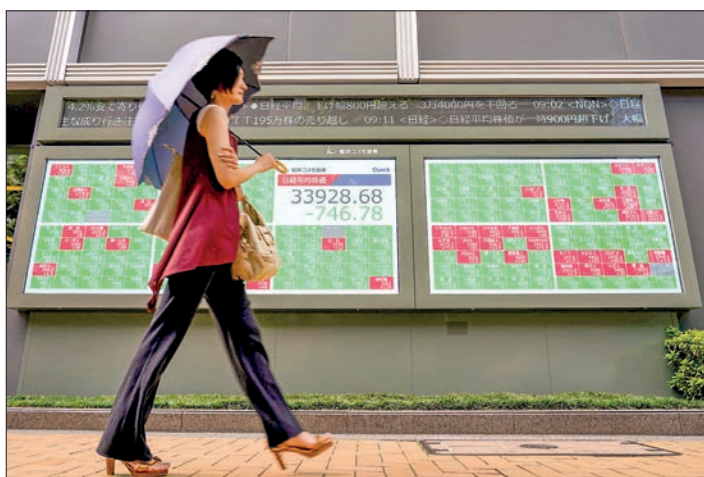
A woman walks in front of an electronic quotation board displaying the numbers of share price on the Tokyo Stock Exchange in Tokyo on 7 August 2024.

ASIAN markets mostly rose Monday as investors tried to move on from last week's upheaval fuelled by US recession worries, with focus shifting to the release of key inflation and retail data.