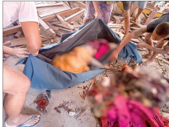
The bodies of monks are seen in the debris.