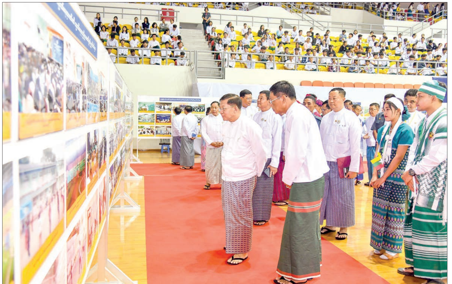
State Administration Council Chairman Prime Minister Senior General Min Aung Hlaing looks round the photo exhibition at yesterday's event marking the International Youth Day in Nay Pyi Taw.

He emphasized the importance of nurturing young peo-