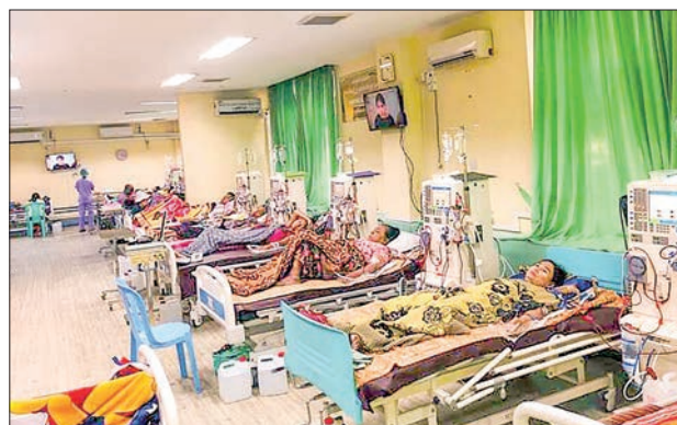
Patients are receiving medical treatment at the renal ward of the Pyinmana Sangha Hospital.

Over the last three months, from April to June, Pyinmana Sangha Hospital provided free medical treatments for a total of 2,084 monks and nuns who had financial difficulties – 584 in April, 713 in May and 787 in June. — MT/ZS