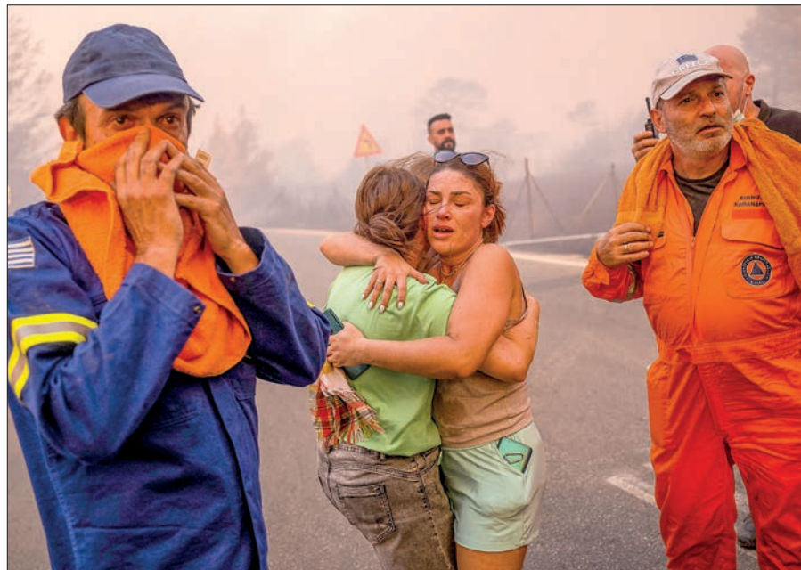
Women embrace after being rescued during a wildfire in Varnavas, north of Athens, on 11 August 2024. PHOTO: AFP

Two hospitals in Penteli — one for children and a military facility — were evacuated at dawn, Vathrakogiannis said. — AFP