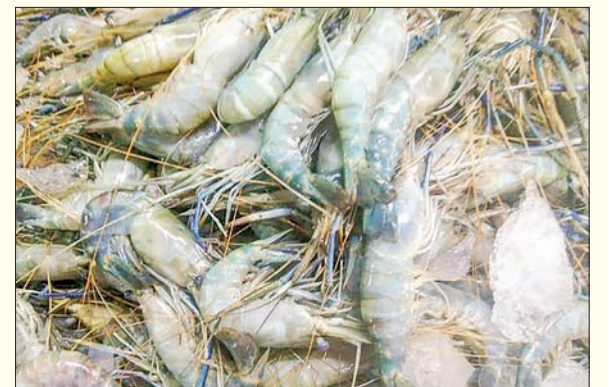
Myanmar exports fishery products to 40 international countries, including Japan, Bangladesh, China and Thailand, through maritime and land borders. The photo shows Myanmar's shrimp.

Myanmar exports fishery products to 40 international countries, including Japan, Bangladesh, China and Thailand, through maritime and land borders. Myanmar delivered fisheries worth $143.244 million to external markets in Q1 this FY. — NN/KK