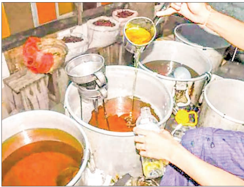
A vendor meticulously arranges the cooking oil for sale in the market.

THE wholesale reference rate of palm oil for the Yangon market climbed to a sixth-week high of K5,945 per viss this week ending 18 August, which increased from K5,780 recorded last week ending 11 August 2024, according to the Supervisory Committee on edible oil import and distribution.