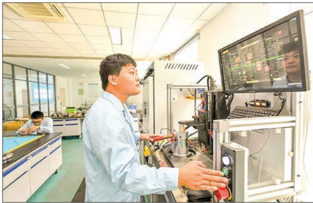
A technician works at a laboratory of the Institute of Remanufacturing Industry & Technology, Jing-Jin-Ji, in Hejian City, north China's Hebei Province, 10 August 2024.

Industry and Information Technology as a distinctive industrial cluster of small and medium enterprises in 2022, and generated a combined revenue of more than 14 billion yuan (about US$1.96 billion) in 2023. — Xinhua