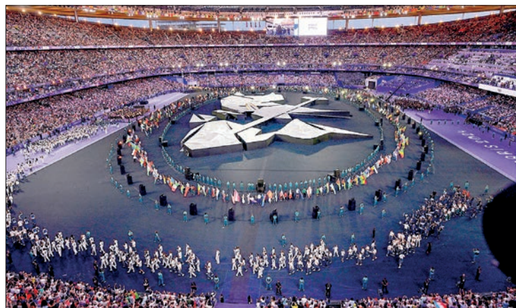
Athletes enter the stadium during the closing ceremony of the Paris 2024 Olympic Games at the Stade de France, in Saint-Denis, in the outskirts of Paris, on 11 August 2024.

In a preview of what the world can expect when the Games head to Los Angeles in 2028, the "Mission Impossible" star was then shown boarding