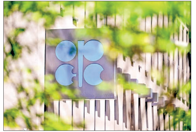
The logo of the Organization of Petroleum Exporting Countries (OPEC) is seen at its headquarters in Vienna on 3 June 2023.

In July, the organization expected the 2024 US production to amount to 13.23 million barrels per day, and in May and June