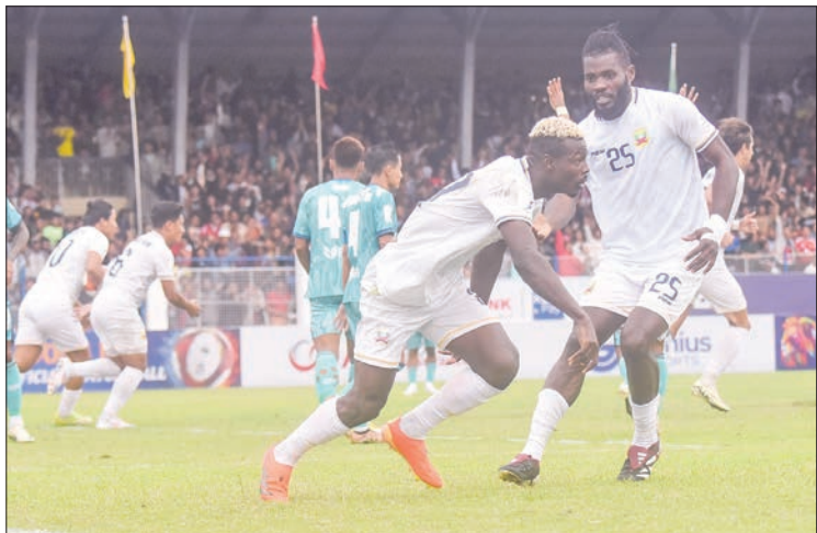
Shan United players celebrate their victory in their previous match.

The Myanmar club advanced to this stage after securing a 4-2 aggregate win over Brunei's Kasuka FC in the preliminary rounds. Shan United will be looking to build on their strong start and make a mark in the ASEAN Club Championship, which makes a return after nearly two decades, with its last editions held in 2003 and 2005.