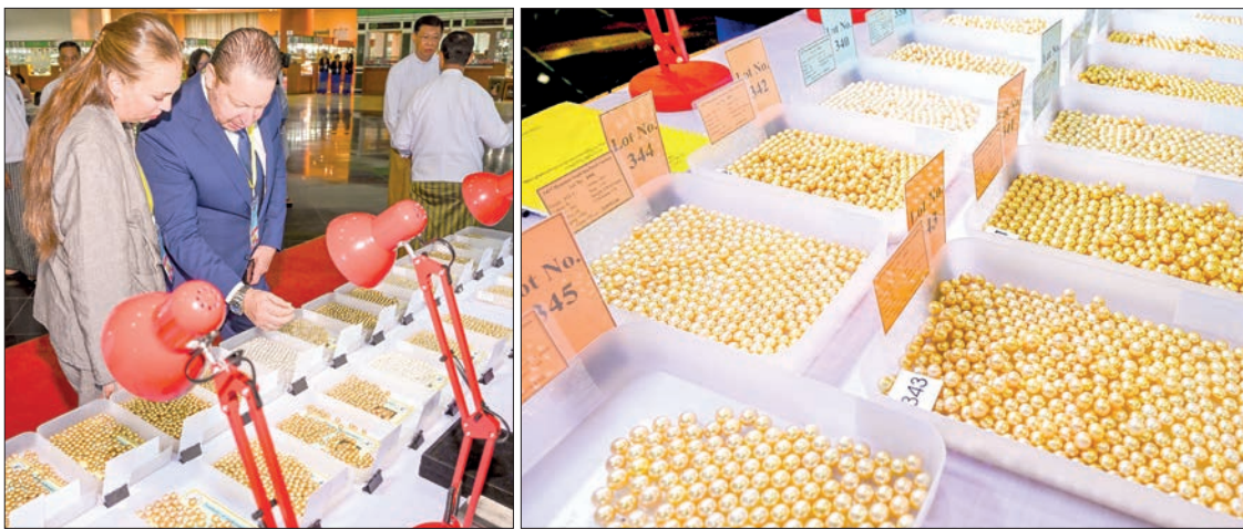
Photos show gem merchants looking round the pearl exhibits (L) and pearl lots at yesterday's emporium.

STARTING yesterday morning, the 142 nd South Sea Pearl Emporium commenced at the Maniyadana Jade Hall in Nay Pyi Taw with 700 pearl lots in an open tender system.