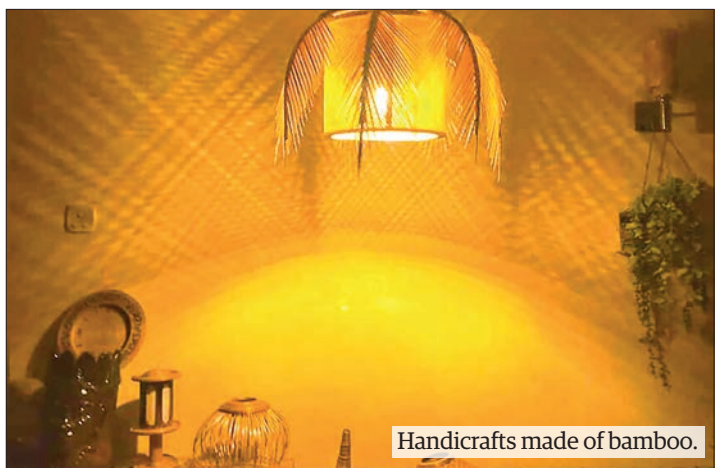
Handicrafts made of bamboo.

AS most of the domestic businesses have widely used bamboo handicrafts, market demand for bamboo is rising, according to U Kyaw Win, a bamboo expert.