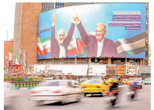
Vehicles drive past a huge billboard depicting Iranian President Masoud Pezeshkian (R) and slain Palestinian Hamas leader Ismail Haniyeh at Tehran's Valiasr square on 12 August 2024.

The United States has deployed an aircraft carrier