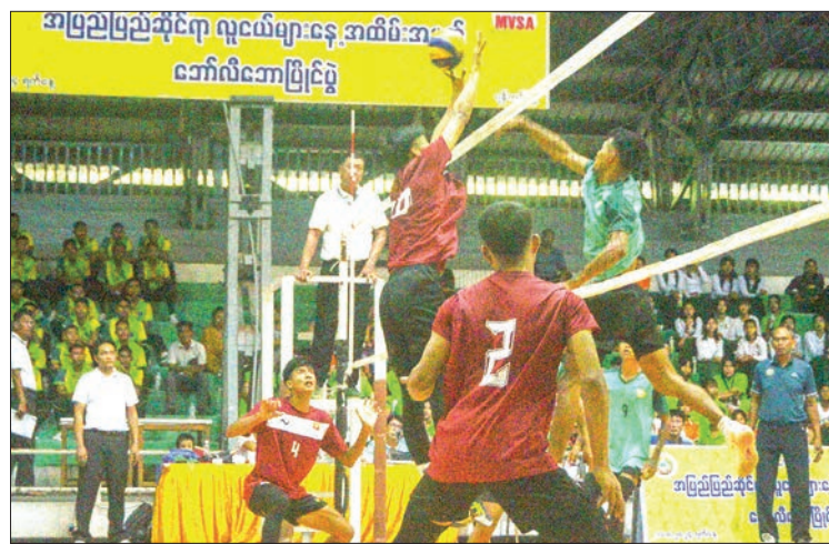
The tournament showcases intense competition, as evidenced by the match between Mandalay and Youth Camp (NPT).

K10 million, the second-place team K5 million, the third-place team K2.5 million, and the fourth-place team K1.5 million as cash awards. Additionally, the best player in the men's tournament will grab K1 million. In the women's competition, the first-place team will earn K6 million, the second-place team K3 million, the third-place team K1.5 million, and the fourth-place team K1 million, respectively. The best player in the women's tournament will claim K500,000. — MNA/KZL