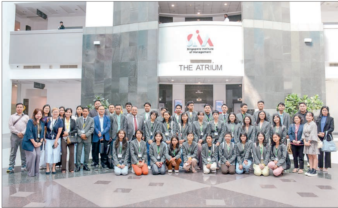
Excursionists pose for a commemorative photo in Singapore.

Then, one Myanmar student from the university shared his experiences with the outstand-