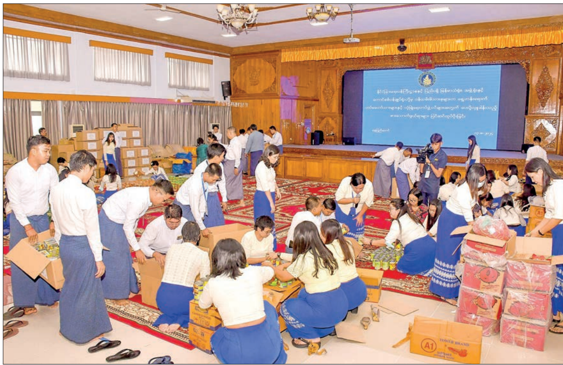
Preparations for food donations in progress in the Ministry of Foreign Affairs.

The Ministry of Foreign Affairs and its overseas missions have contributed food items worth approximately K20 million, which will be delivered