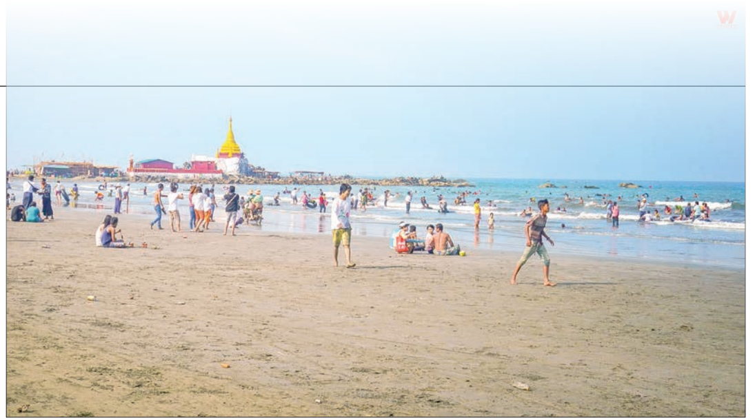
This photo shows travellers visiting the Ngwetaung Beach during the rainy season.