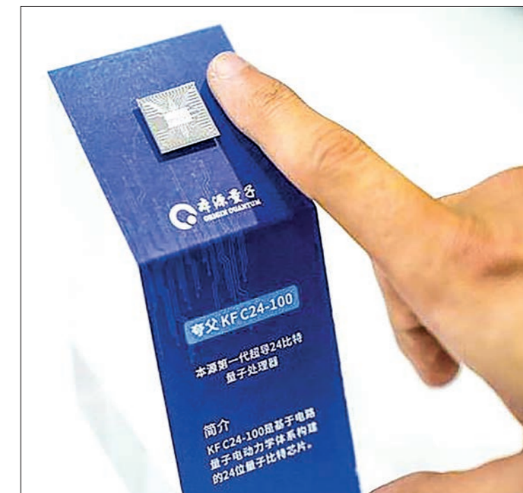
Photo taken on 17 September 2022 shows a quantum processor displayed at the main venue of 2022 national mass entrepreneurship and innovation week in Hefei, capital of east China's Anhui Province.

According to Zhang Yixuan, a researcher in BMU School of Pharmacy, small molecule drugs can easily penetrate the cell membrane to reach any location and interact with target proteins to exert the corresponding therapeutic effects. Designers of small molecule drugs need