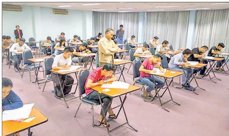
This image shows the examination organized by MCPA.

ACCORDING to the Myanmar Computer Professionals Association (MCPA), the training courses for three ITPEC (Information Technology Professional Examination Council) exams will be offered.