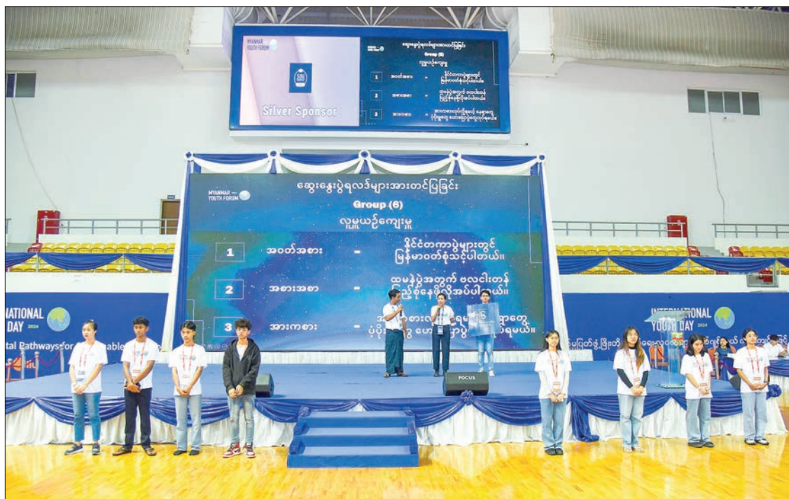
One of the discussion sessions in progress at yesterday's Youth Forum.

The youth representatives in nine groups also discussed The Power of Technology to Transform Your Life, The Truth about AI, Steps Youth Need to Take to Access the Digital World, Youth: The Future Leaders of the Nation, Master Your Mind, Master Your Body, The Skill Youth Need to Succeed in the 21 st Century, Today Trending: Monetizing Your Digital Brand, Get a Better Job with TVET and Master Your Life through Entrepreneurship. The group leaders read out the outcomes, and the officials summarized the discussions.