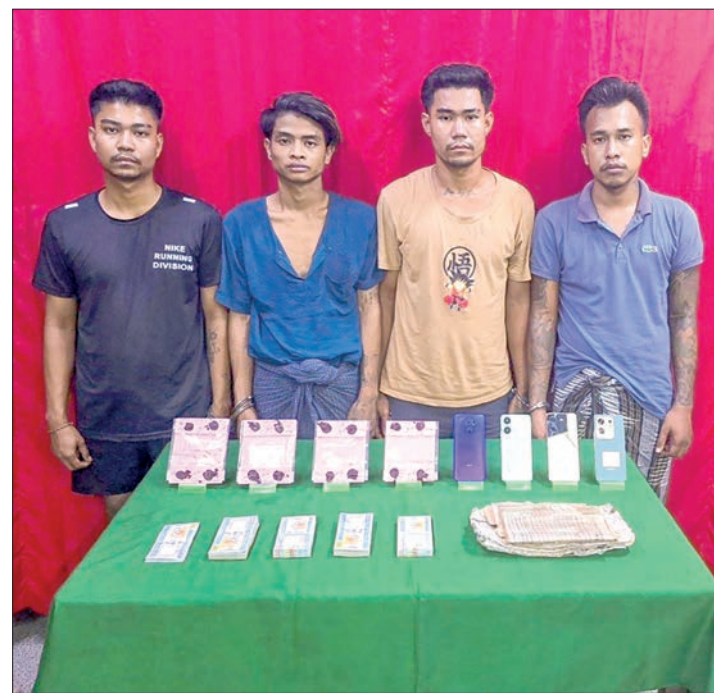
Four arrestees are seen alongside evidence objects.