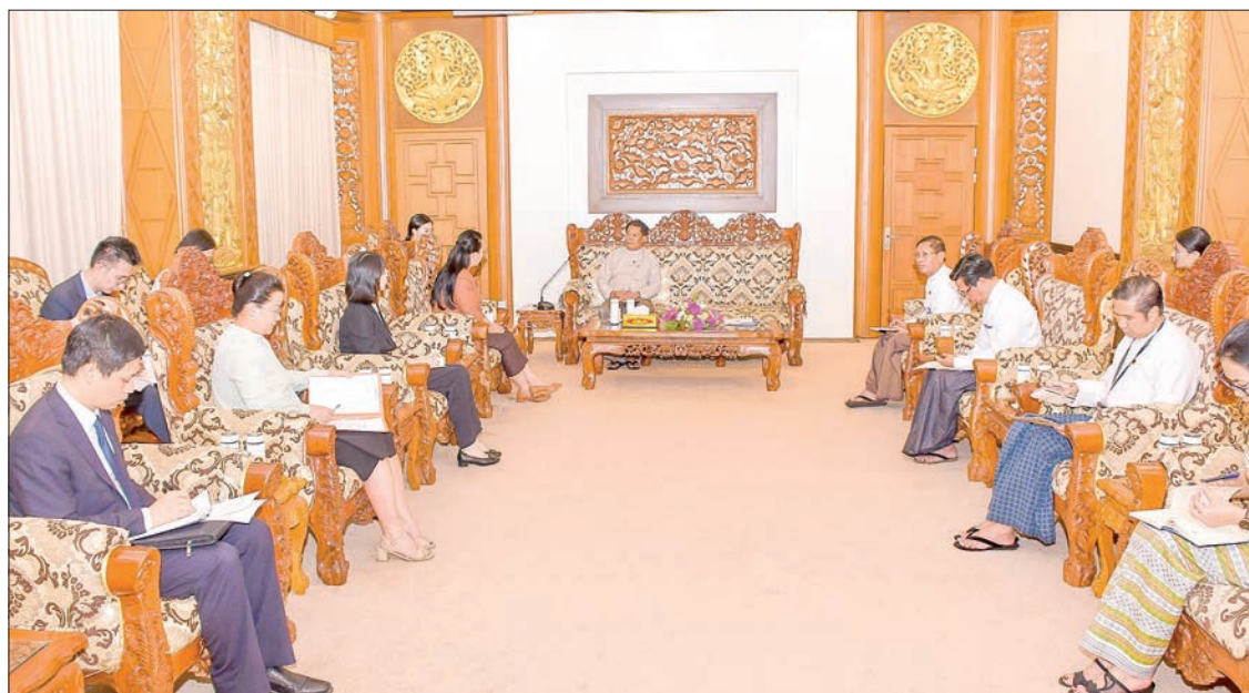
Chinese Ambassador-designate Ms Ma Jia calls on Deputy Prime Minister Union Foreign Affairs Minister U Than Swe yesterday in Nay Pyi Taw.

MS Ma Jia, Ambassador-designate of the People's Republic of China to the Republic of the Union of Myanmar, paid a courtesy call and presented a copy of her letter of credence to U Than Swe, Deputy Prime Minister and Union Minister for Foreign Affairs of the Republic of the Union of Myanmar,