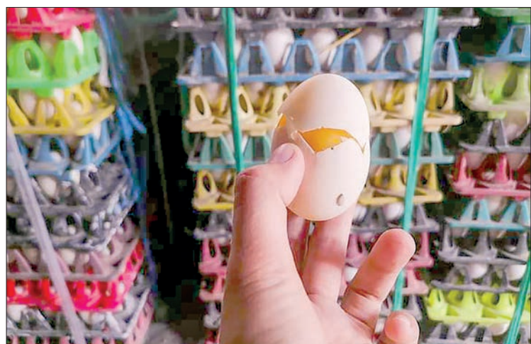
Salted duck egg gains popularity in the market.