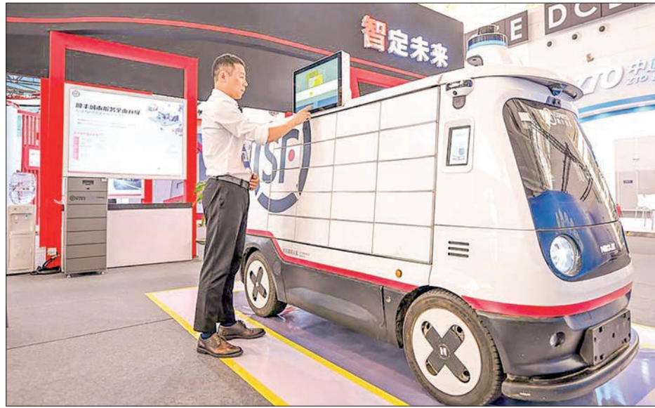
An exhibitor operates an unmanned autonomous delivery vehicle for courier service displayed at the World Intelligence Expo 2024 in north China's Tianjin, 20 June 2024.

CHINA'S courier sector surpassed the 100-billion-parcel mark this year much faster than the previous year, reflecting a booming consumer market and sustained economic vitality.