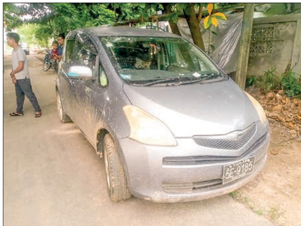
Offender are seen along with the vehicle they used in the crime.

POLICE are investigating after three people were found dead in Ottarathiri Township of Nay Pyi Taw on 10 August.