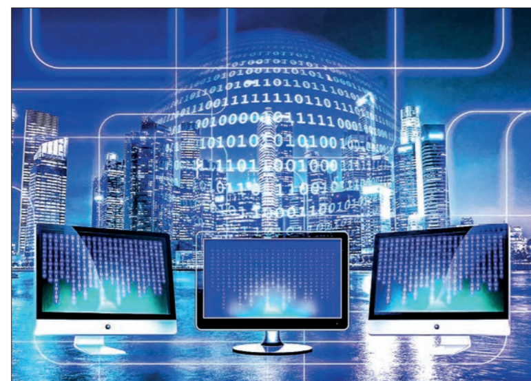
AI has allowed the bad actors in scientific publishing and academia to "industrialize the overflow" of "junk" papers, Retraction Watch co-founder Ivan Oransky told AFP. ILLUSTRATION PHOTO: IMAGE SHOWN FOR DEMONSTRATION PURPOSES

Recent controversies in scientific publishing have spotlighted the potential pitfalls of artificial intelligence in academia.