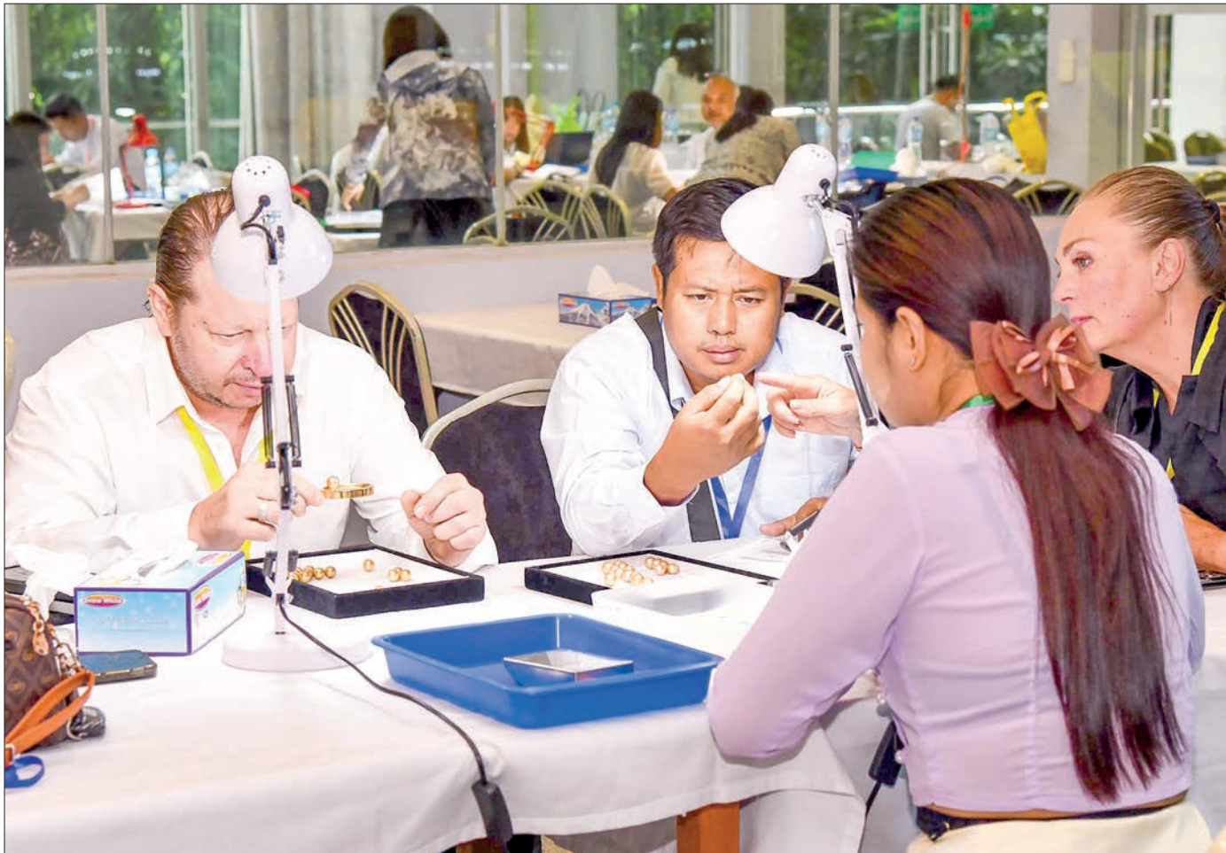
Gem traders evaluate Myanmar's South Sea pearls at the second day of the emporium in Nay Pyi Taw.