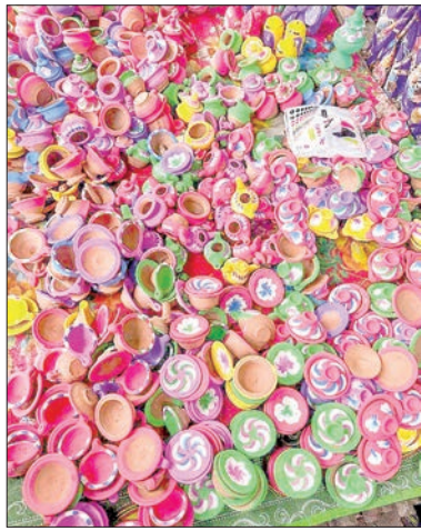
Festivalgoers examine traditional clayware, with some wearing 'Kyaukkhwet Pan' (flower crowns made of green twigs) in the background.

The festival has been organized annually since last year. Historically, it dates back to the reign of King Thibaw. During the Taungpyone Festival, boats travelled along the Shwetachaung Canal, stopping at Obo Ward near the base of Mandalay Hill, where pottery was temporarily sold. The Traditional Clayware Festival orig-