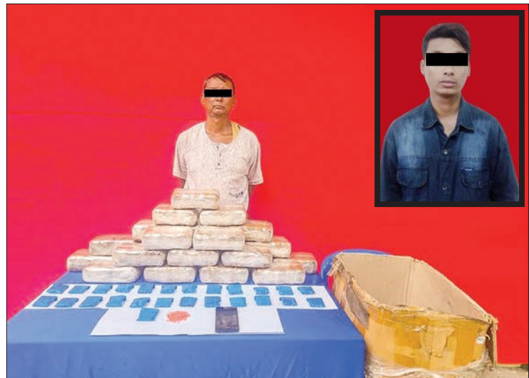
Offenders are seen alongside seized drugs.

The seized psychotropic substances would reportedly be transported from Shan State to Sagaing Region. Authorities took legal action against offenders and continue to investigate further criminal chains related to the case. — MNA/KZL