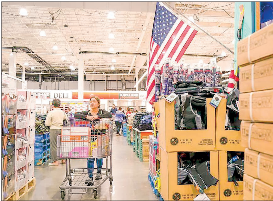
Customers select goods at a supermarket in Foster City, California, the United States, 10 April 2024.

In late May, the USTR issued a Federal Register notice regarding proposed tariff modifications under Section 301 and