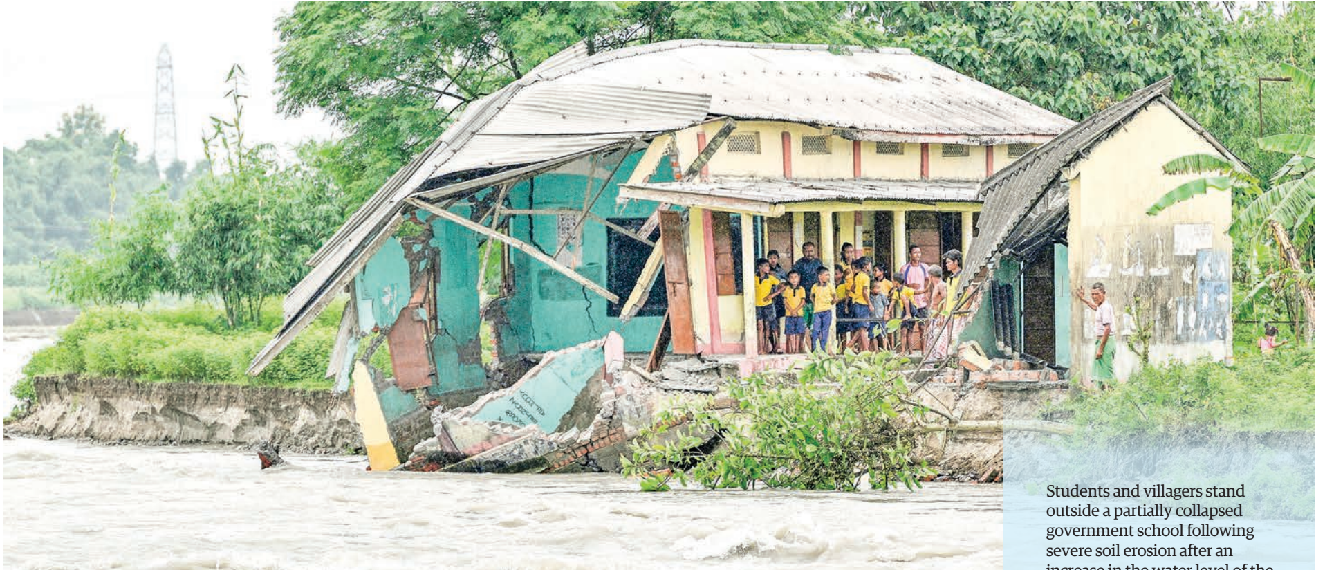
Students and villagers stand outside a partially collapsed government school following severe soil erosion after an increase in the water level of the Sermanga river during monsoon season in the New Banglajhora village of Kokrajhar district in India's Assam state on 10 August 2024.