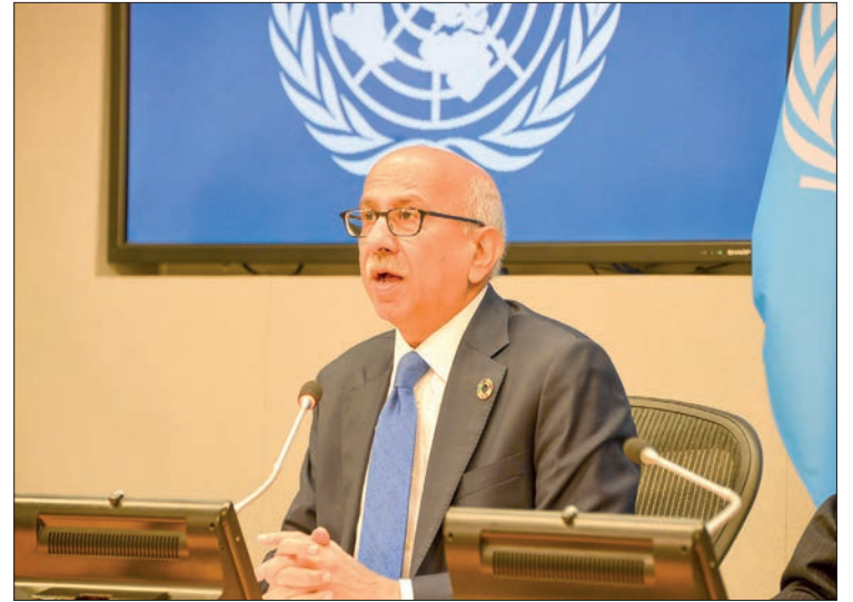
A UN official briefs about the World Population Prospects 2024 report at the UN headquarters in New York on 11 July 2024.

However, he also pointed out that the earlier and lower peak is "a hopeful sign" as it could mean "reduced environmental pressures from human impacts due to lower aggregate consumption".