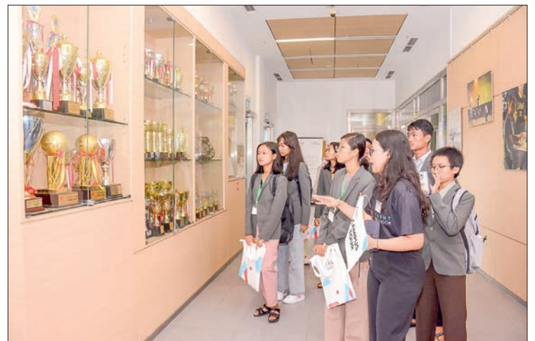
Photos (left and right) highlight activities of outstanding students on their overseas excursion.