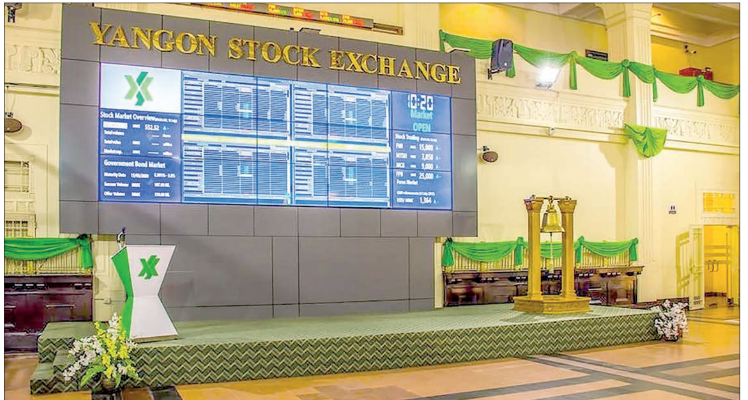
This undated photo shows the Yangon Bourse with its share index panel.

MYANMA Agricultural & General Development Public Co., Ltd (MAGDPL), the first-ever registered company on the Pre-Listing Board (PLB), is scheduled to sell its shares on 14 August 2024, according to the Yangon Stock Exchange.