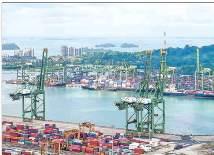
A general view shows vessels docked next to stacks of containers at Pulau Brani port terminal in Singapore on 3 July 2024.

Singapore’s total merchandise trade grew 10.1 per cent year-on-year from April to June, driven by both oil trade and non-oil trade. Its services trade increased 11.3 per cent to 227 billion Singapore dollars (US$171 billion) in the second quarter. Enterprise Singapore estimated a five to six per cent growth for the total merchandise trade. — Xinhua