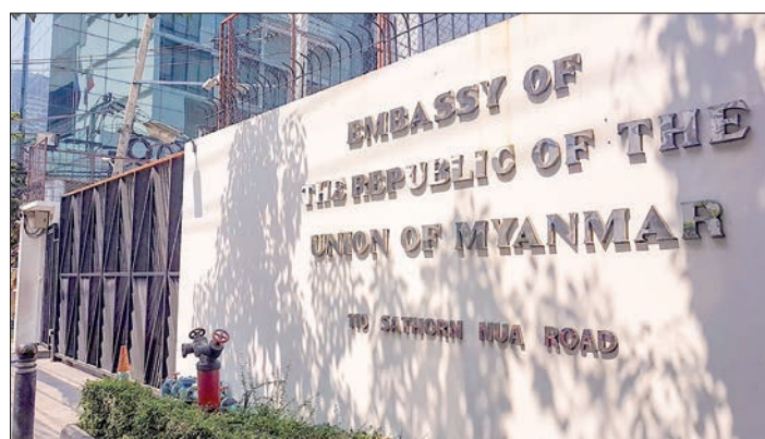
The signage of the Myanmar Embassy to Thailand.

AS of 17 August, the reservation system will be stopped, and applicants for renewing PJ passports can come to do it at the Myanmar Embassy's