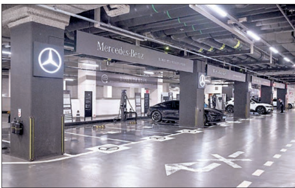
Mercedes electric car (EV) charging stations are seen at a parking lot in Seoul on 13 August 2024.

MERCEDES-BENZ Korea released the names of its electric vehicle battery suppliers on Tuesday, bowing to public outrage after one of its cars burst into flame in a parking lot earlier this month. The 1 August fire damaged hundreds of vehicles and created a national panic, with car parks across South Korea imposing a wave of adhoc restrictions amid growing calls for transparency on battery supply chains. South Korea is a major producer of batteries and electric vehicles, including local carmakers Hyundai and Kia, with EVs making up 9.3 per cent of new cars purchased last year — higher than in the US.