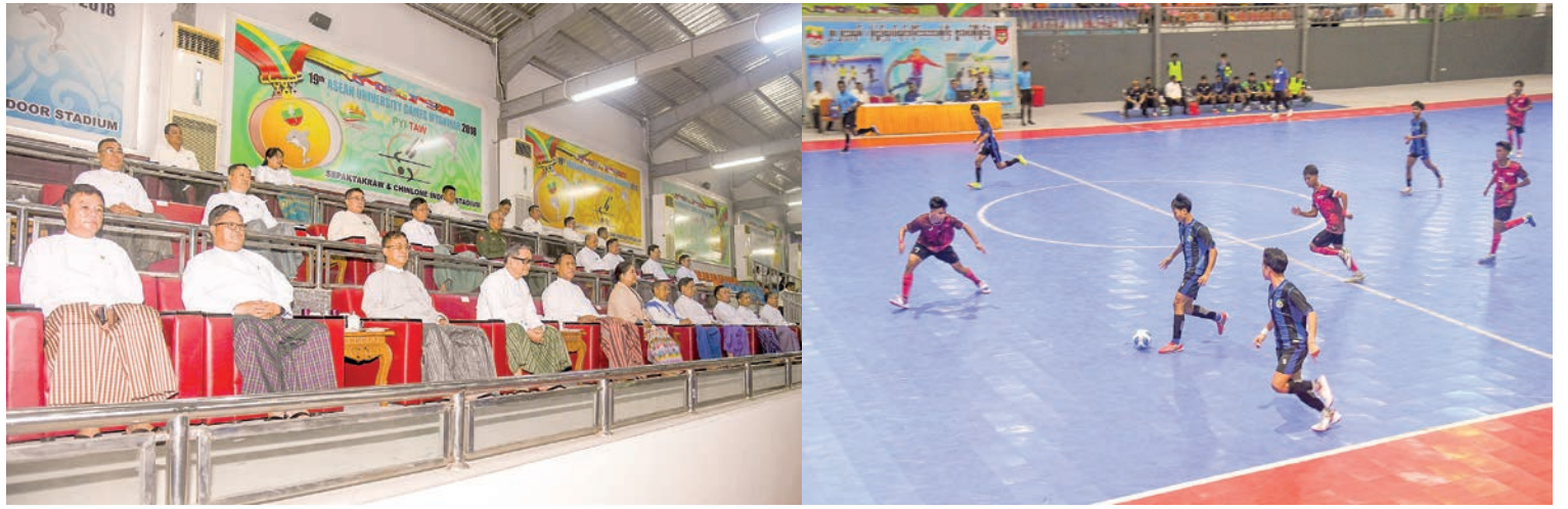
SAC members and dignitaries watch the opening match of the 2024 Inter-State & Region Futsal Championship yesterday in Nay Pyi Taw.

Union Minister for Sports and Youth Affairs U Min Thein Zan, who is also Chairman of the Myanmar Olympic Committee, addressed the gathering, highlighting the significance of organizing such state and regional futsal tournaments. He emphasized that these competitions serve as a vital foundation for discovering and nurturing new talents and expressed hope that the event will lead to the emergence of outstanding young players. He urged all involved, including organizers