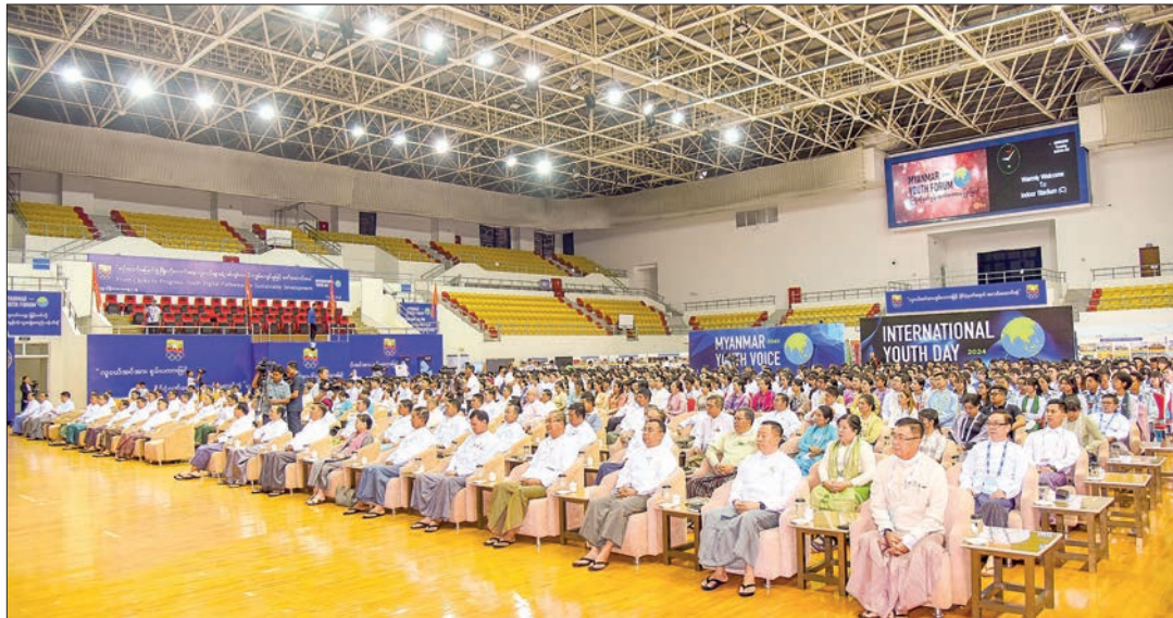
Union Minister U Min Thein Zan addresses the 2024 Youth Forum yesterday in Nay Pyi Taw.

THE 2024 Youth Forum under the theme “Enhancing the Role of Youth in Creating a Better Society” was held in Nay Pyi Taw yesterday.