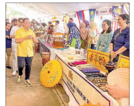
This photo shows the Embassy of the Republic of the Union of Myanmar in New Delhi displaying artefacts, handicrafts and tourism promotion brochures at the embassy's booth.