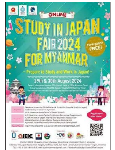
The image showcases a booklet about Online Study in Japan Fair 2024.

For free registration, interested persons can go to the particular website https://www.okayama-u.ac.jp/user/myanmar/prepare2024.html