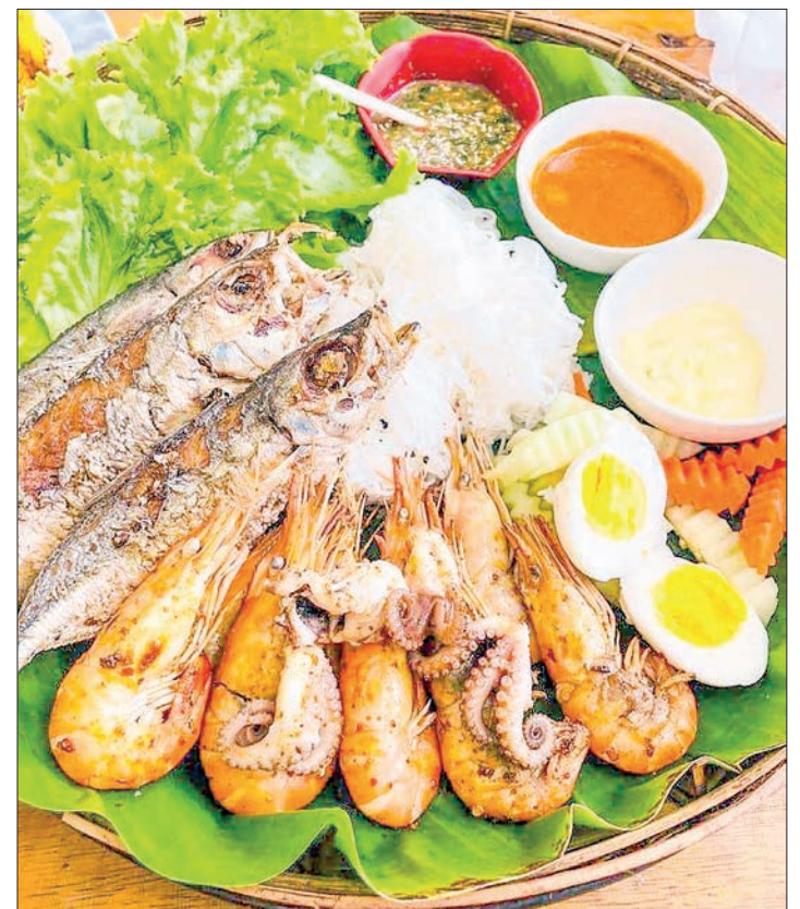
This photo shows some seafood, such as Mala xiang guo and Rakhine traditional foods.

"As for the seafood-only market, the decrease in sales is also due to the price situa-