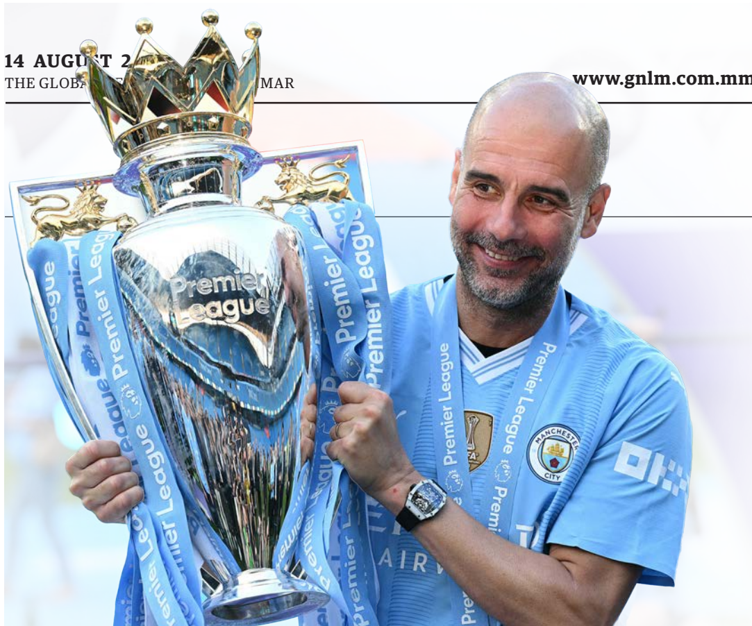
Manchester City's Spanish manager Pep Guardiola poses with the Premier League trophy after the presentation ceremony following the English Premier League football match between Manchester City and West Ham United at the Etihad Stadium in Manchester, north west England, on 19 May 2024.