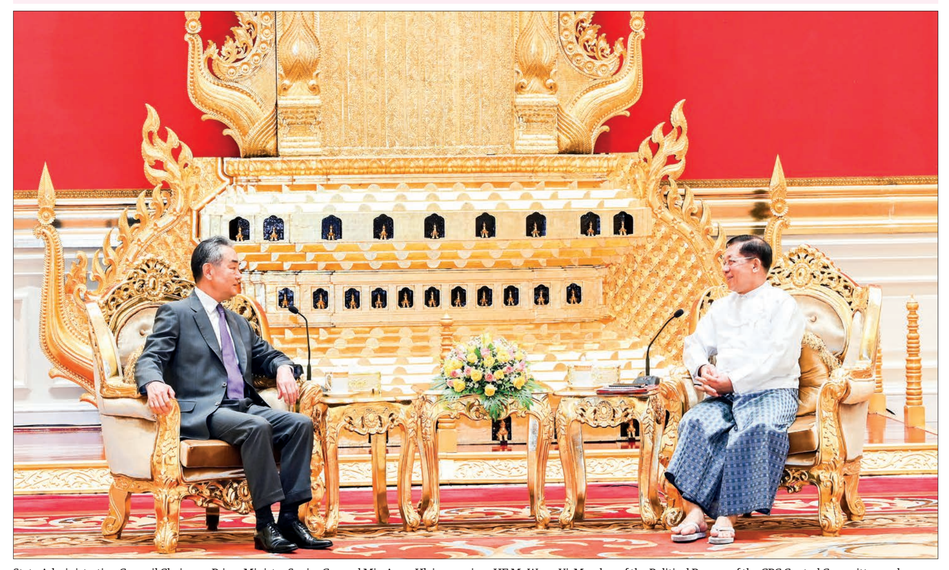
State Administration Council Chairman Prime Minister Senior General Min Aung Hlaing receives HE Mr Wang Yi, Member of the Political Bureau of the CPC Central Committee and Minister of Foreign Affairs of the People's Republic of China yesterday in Nay Pyi Taw.

SAC Chairman Prime Minister Senior General Min Aung Hlaing receives a delegation led by HE Mr Wang Yi, Member of the Political Bureau of the CPC Central Committee and Minister of Foreign Affairs of the People's Republic of China