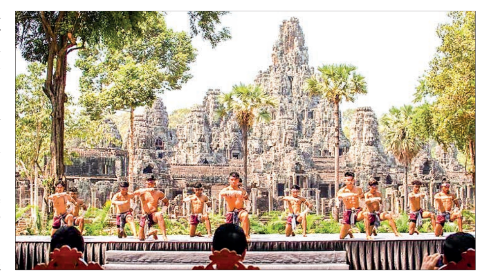
Cambodian Bokator martial artists perform at the northern part of Bayon Temple in the complex of the Angkor Archaeological Park in Siem Reap province, Cambodia, 24 April 2024.

Cambodia's strong ties with China significantly enhance economic cooperation and exchanges between the two nations.