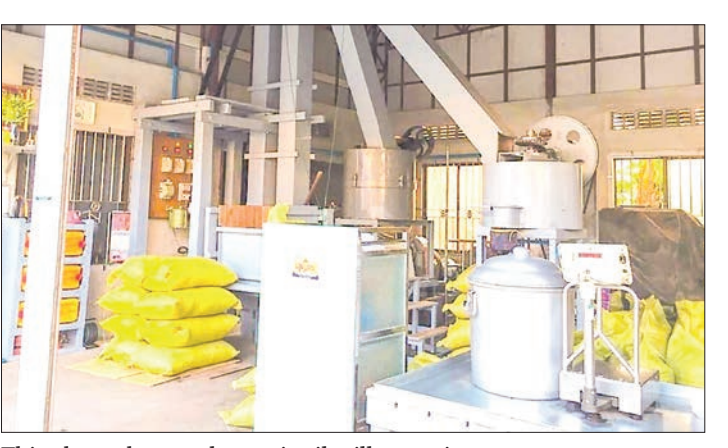
This photo shows a domestic oil mill operating.

Oil millers can apply for loans under two categories. For working capital requirements, K10 to K300 million loans are provided with one-year loan terms. Oil millers can apply for a K20 to 30 million loan to purchase equipment and con-