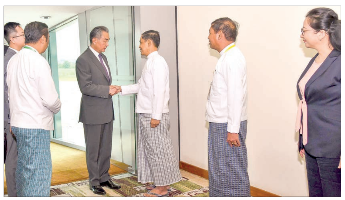
HE Mr Wang Yi, a Member of the Political Bureau of the CPC Central Committee and Minister of Foreign Affairs of the People's Republic of China, is welcomed by Union Minister U Ko Ko Hlaing at the Ministry 2 of the State Administration Council Chairman Office, on his arrival at Nay Pyi Taw Airport in Nay Pyi Taw yesterday.

THE Chinese delegation led by HE Mr Wang Yi, a Member of the Political Bureau of the CPC Central Committee and Minister of Foreign Affairs of the People's Republic of China, arrived in Nay Pyi Taw by a special flight yesterday.