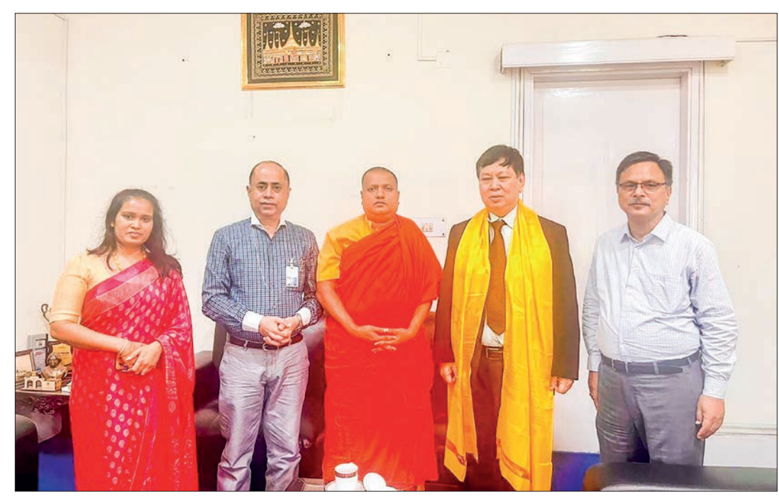
A discussion in progress between Myanmar Ambassador to India U Moe Kyaw Aung and Venerable M Dhammalankara Thero, Bhikkhu-In-Charge of the Maha Bodhi Society of India.

A discussion on promoting religious cooperation between Myanmar and India took place at the Embassy of Myanmar in New Delhi on 13 August, according to the Ministry of Foreign Affairs.