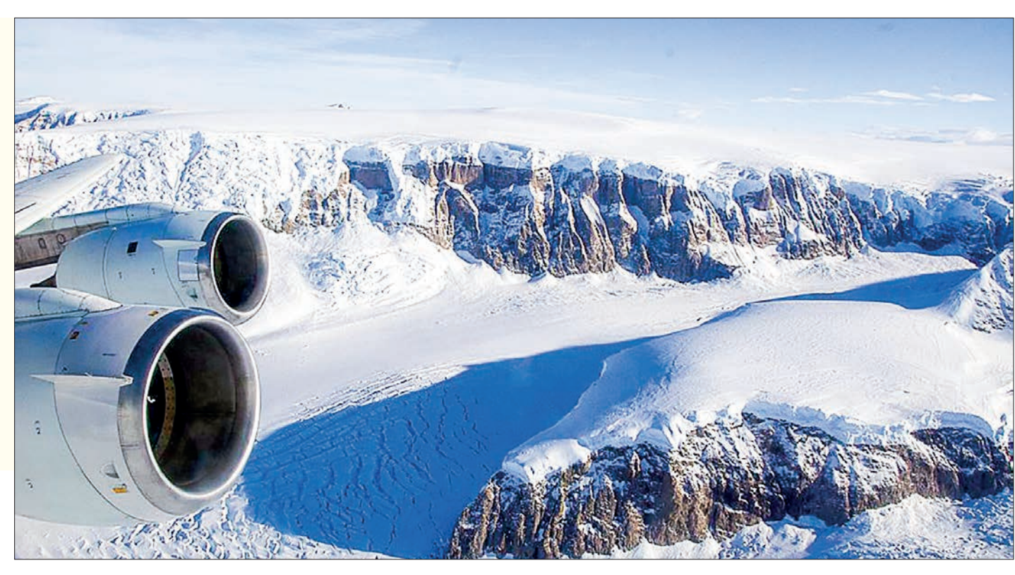
Cryospheric sciences study the Earth's ice and snow systems, including glaciers, ice caps, and sea ice. This field examines their impact on climate, sea level rise, and ecosystems.

Introducing text of the draft resolution, the representative of France spotlighted the vulnerability of glaciers and poles to climate change and their role