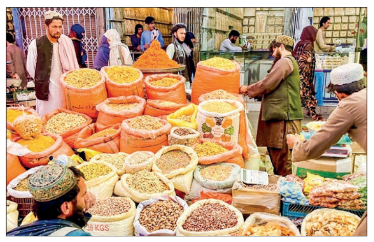
Afghan people buy dry fruits at a local market in Kandahar province, Afghanistan, 20 April 2023.

Afghanistan has great mineral and agricultural potential, which the Taliban government is attempting to exploit, but they are impeded by poor infrastructure and a lack of domestic and foreign expertise and capital. — AFP