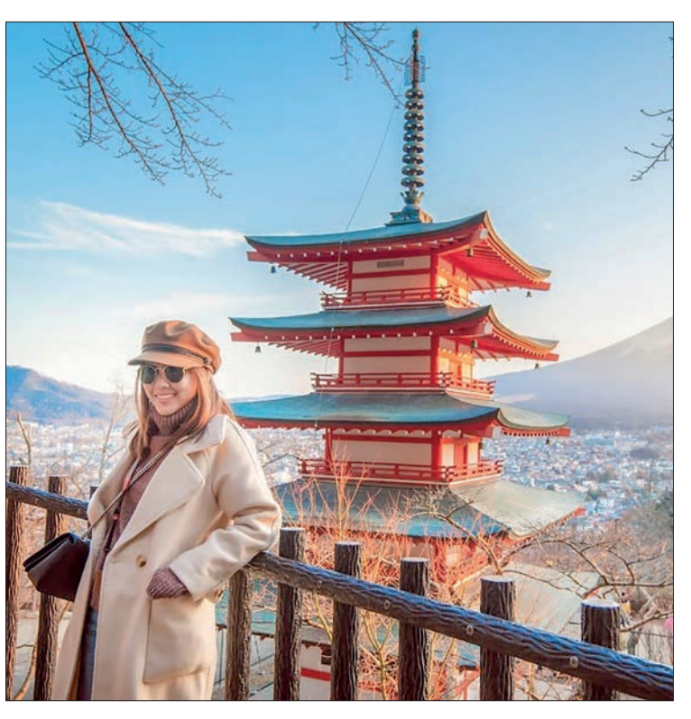
A tourist at the Chureito Pagoda near Japan's Mount Fuji. New services have been launched and regulations eased to encourage wealthy visitors to the country to go off the beaten track as regions look to recover following the Covid-19 pandemic.

China, Germany, France, Hong Kong, India, Indonesia, Singapore, South Korea, Chinese Taipei, Thailand, the United Arab Emirates and Vietnam. Asked what respondents looked for in their visit to Japan, 28.6 per cent cited the diverse food scene, while 27.9 per cent were drawn to the country's culture and 25.6 per cent to unique natural landscapes. — Kyodo