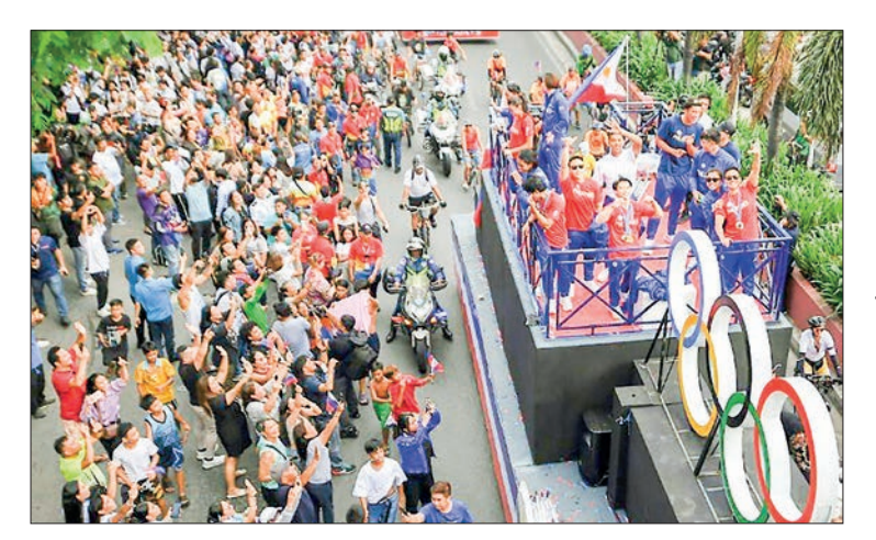
Philippines' Carlos Yulo (C), Paris 2024 Olympic Games double gold medallist in gymnastics, and other Philippine athletes wave during a homecoming parade in Manila.

The organizers said the competition has attracted over 200 enthusiasts to register, and international runners are also invited to compete. — Xinhua