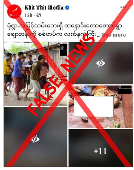
The screenshot of Khit Thit media validates their fake news

Similarly, subversive media also fabricated stories claiming that security forces in KhinU Township, Sagaing Region, fired heavy weapons into villages in KhinU Township on 11 August, killing an elderly woman, and security forces in Longlon Township, Taninthayi Region, fired heavy weapons at villages in Longlon Township on 12 August.—MNA/TKO