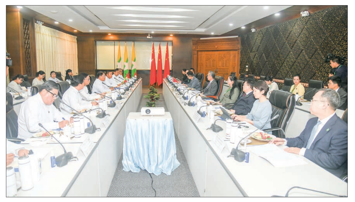
Deputy PM MoFA Union Minister U Than Swe holds talks with Mr Wang Yi, Member of the Political Bureau of the CPC Central Committee and Minister of Foreign Affairs, yesterday in Nay Pyi Taw.

U THAN SWE, Deputy Prime Minister and Union Minister for Foreign Affairs of the Republic of the Union of Myanmar, held Myanmar-China bilateral consultations with Mr Wang Yi, Member of the Political Bureau of the Chinese Communist Party Central Committee and Minister for Foreign Affairs of the People's Republic of China, yesterday at the Ministry of Foreign Affairs, Nay Pyi Taw.