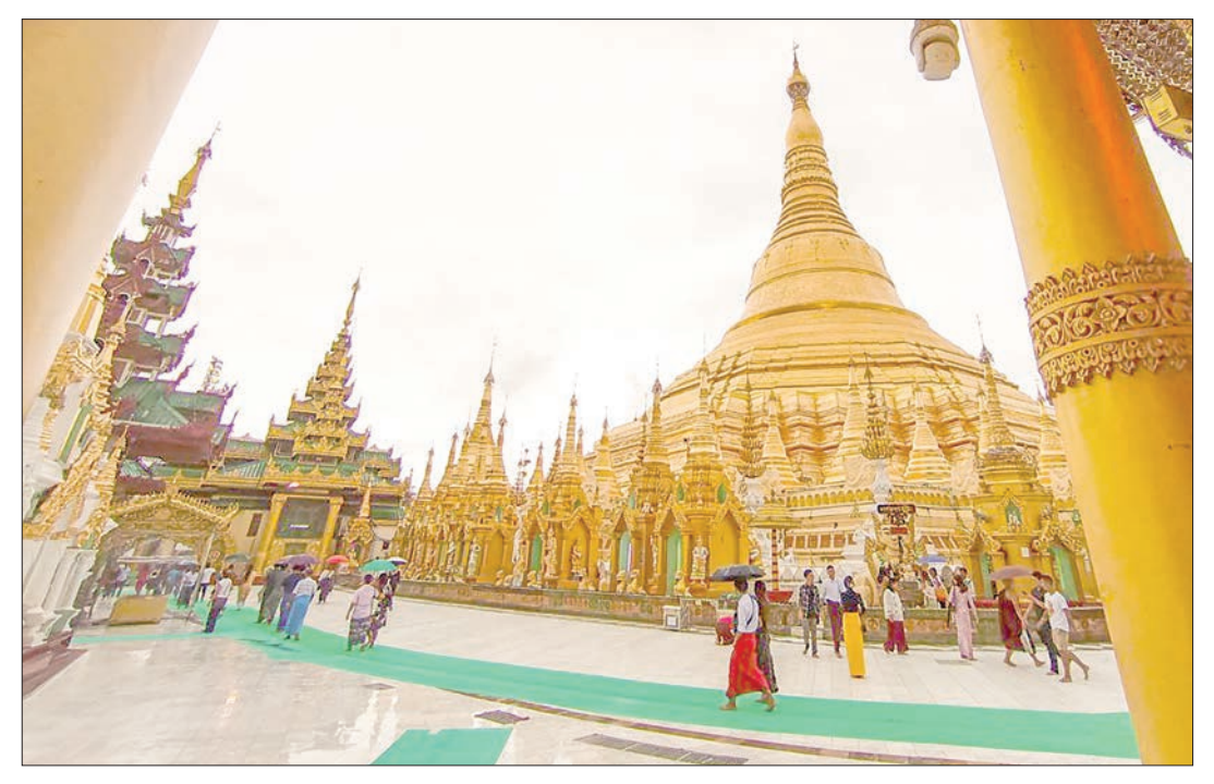
This photo showcases Shwedagon Pagoda in August 2024.