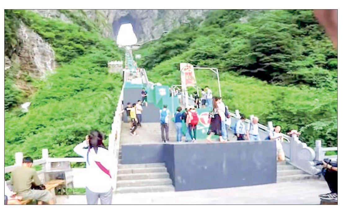
This file photo shows a competitor completing a sequence of jumps and flips at the Tianmen Mountain National Forest Park in Zhangjiajie, central China's Hunan Province.

the Olympic Refuge Foundation (ORF) - with support from UN-HCR, the UN Refugee Agency - to give forcibly displaced athletes the chance to showcase their talents on the highest sporting stage. "These refugee athletes have overcome immense challenges, but their success is a reminder to the world of what can be achieved when refugees are given a helping hand to pursue their dreams," said Deputy High Commissioner for Refugees, Kelly T Clements, who watched the team take part in the Paris 2024 closing ceremony on Sunday. - Xinhua