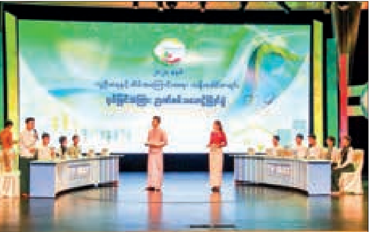
The Radio Quiz on 2024 enumeration of population and housing census, jointly initiated by the Ministry of Information, Ministry of Immigration and Population and Ministry of Education, in progress at MRTV in Tatkon, Nay Pyi Taw, yesterday.

THE Radio Quiz on 2024 enumeration of population and housing census, jointly initiated by the Ministry of Information, Ministry of Immigration and Population and Ministry of Education, was held at MRTV in Tatkon of Nay Pyi Taw yesterday.