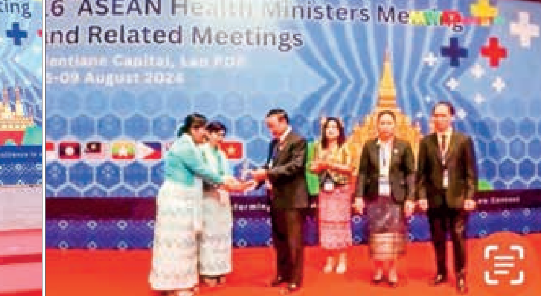
Myanmar Team headed by Union Minister for Health and ASEAN Smoke-Free Award (Bagan). Myanmar Team received ASEAN Smoke-Free Award (Bagan)