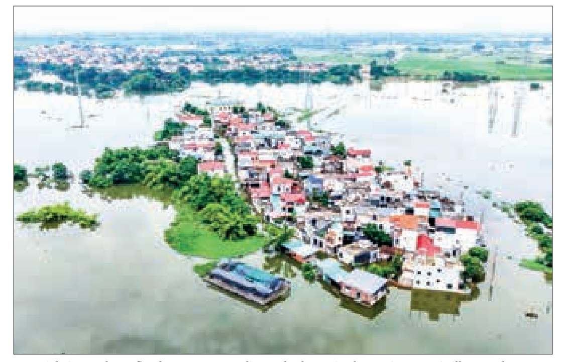
An aerial picture shows flood waters surrounding and submerging homes in Ben Voi village on the outskirts of Hanoi on 28 July 2024.

A foreign \, department \, spokes woman \, did \, not \, immediately \, provide further details of the agreement on Tuesday. - AFP