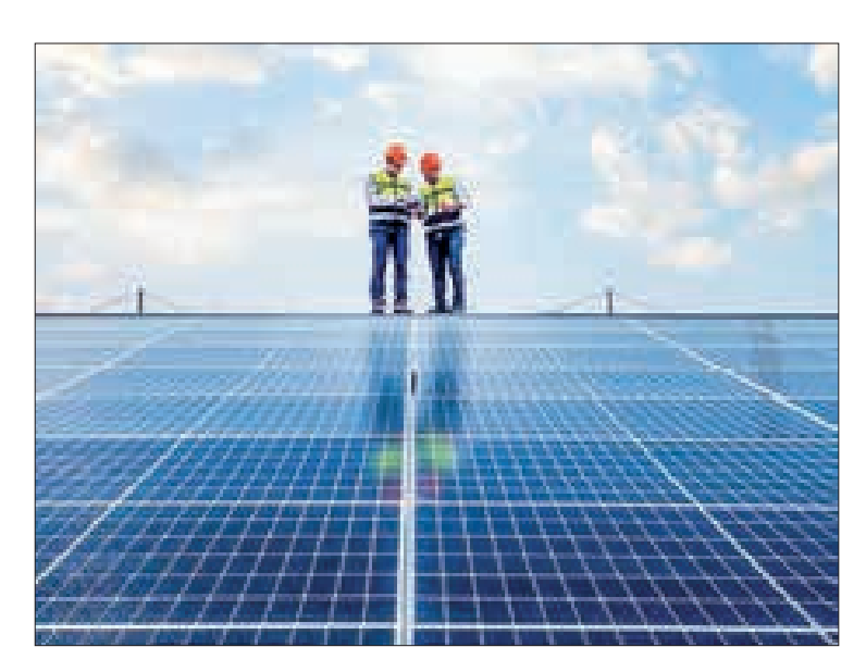
The project will include an array of panels, batteries and, eventually, a cable linking Australia with Singapore.

In a statement released upon arrival, Li said that under the strategic guidance of Chinese President Xi Jinping and Russian President Vladimir Putin, China and Russia set a model for a new type of international relations and relations between neighbouring major countries. — Xinhua