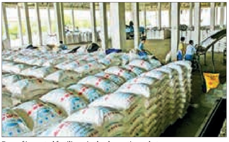
Bags of imported fertilizers in the domestic market.

K83,000 per 50-kilogramme bag of Urea fertilizer (large granular),