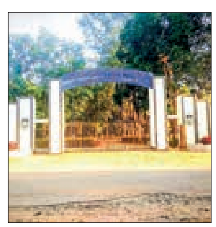
This picture captures the Cooperative College (Phaunggyi).

Interested applicants can purchase the necessary documents and submit them to the relevant offices and departments, including the Cooperative Department (Director General's Office), until 30 September. — TWA/MKKS