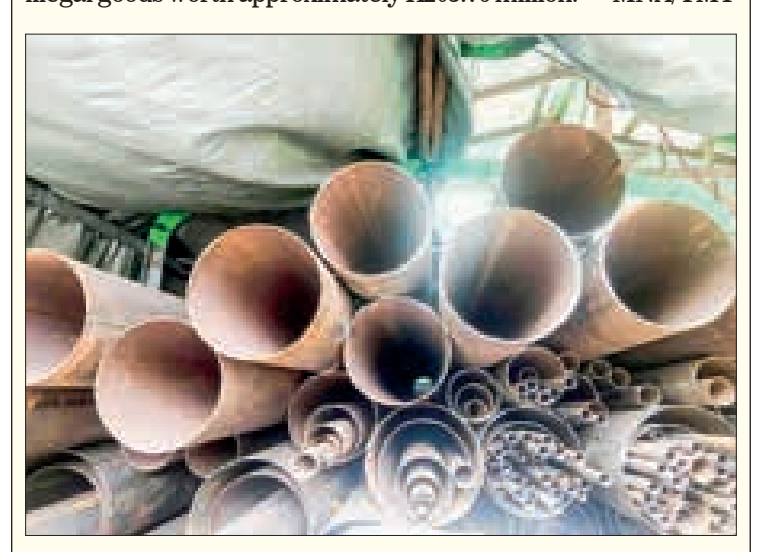
Confiscated illegal iron pipes at the Mayanchaung permanent checkpoint.

The Illegal Trade Eradication Steering Committee reported 14 arrests on 19, 20, and 21 August, leading to the seizure of illegal goods worth approximately K203.76 million. — MNA/TMT