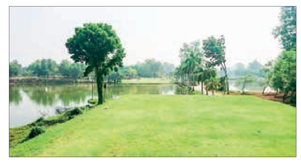
A glimpse of the Yangon Golf Course (Danyingon).

Tender forms, along with the terms and conditions, will be available for purchase from 22 August, and submissions must be made by 30 September. The Yangon Golf Club, established in 1909, is now 115 years old. — TWA/MKKS