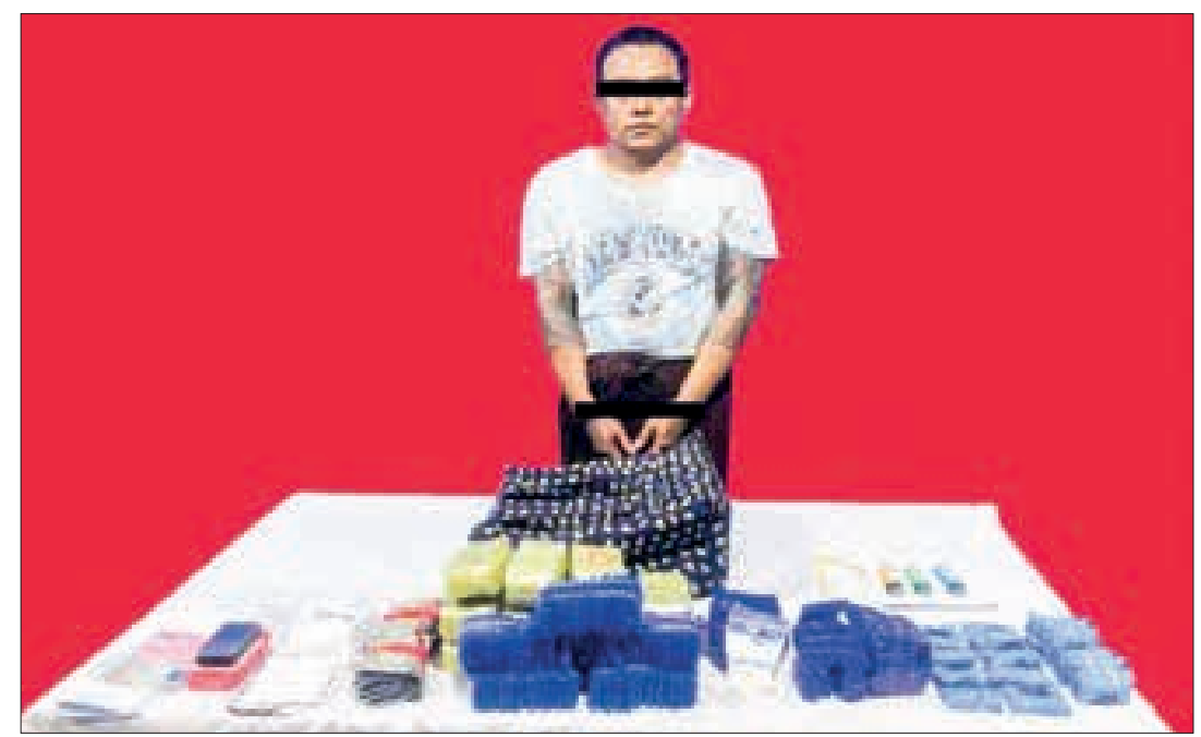
An offender is seen alongside confiscated drugs.

Thet Hein near Taunglaylone Village Tract, Nyaungshwe, Taunggyi Township, at 6:30 pm. They seized 7.4 kilogrammes of ketamine and 1.49 kilogrammes of Happy Water. Legal action was taken against offenders under the Narcotic Drugs and Psychotropic Substances Law. — MNA/TMT