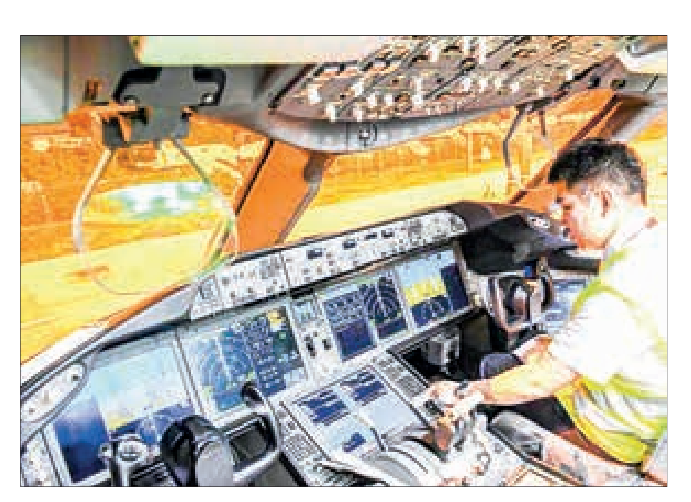
Hainan Airlines will launch its first direct route from Haikou to Seattle via Chongging on 26 September with weekly round-trip flights to boost travel and support Hainan Free Trade Port's development.

In recent years, Hainan has ramped up efforts to resume and launch international air routes. As of May this year, the province had 46 overseas passenger routes in operation, with the number expected to reach 62 by the end of this year. — Xinhua