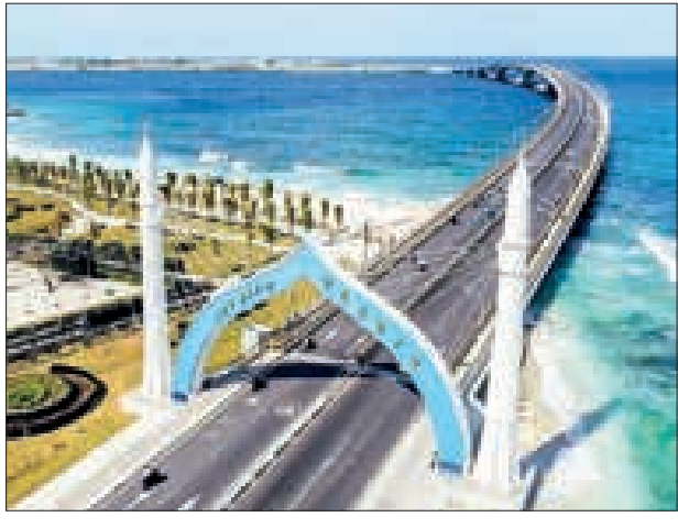
Aerial photo taken on 1 September 2019 shows the China-Maldives Friendship Bridge in Maldives.

In 2023, the Maldives recorded 1,878,543 tourist arrivals. — Xinhua