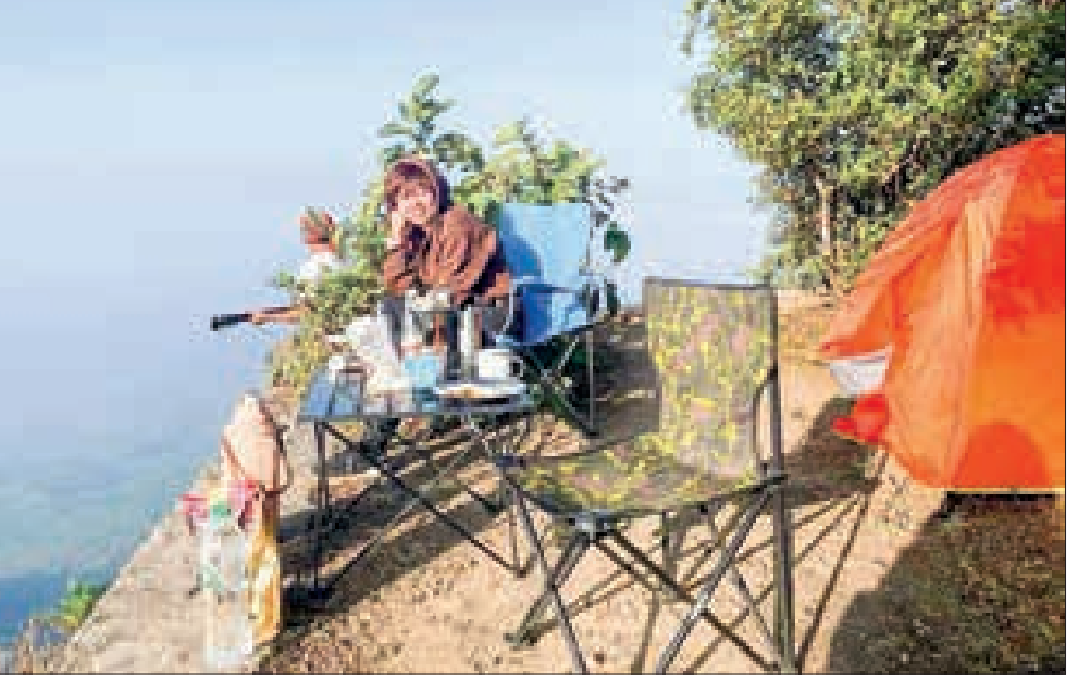
The photo showcases the Mount Popa trekking tour organized by Mahagiri.