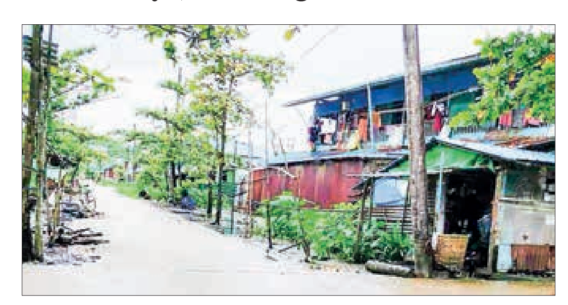
Some\ houses\ and\ plots\ near\ Nyaungdon\ Street,\ Hlinethaya\ Township.

IN the neighbourhoods near Nyaungdon Street of Hline-thaya township, Yangon region, where most garment factory workers live, there have been many real estate transactions, according to market sources.