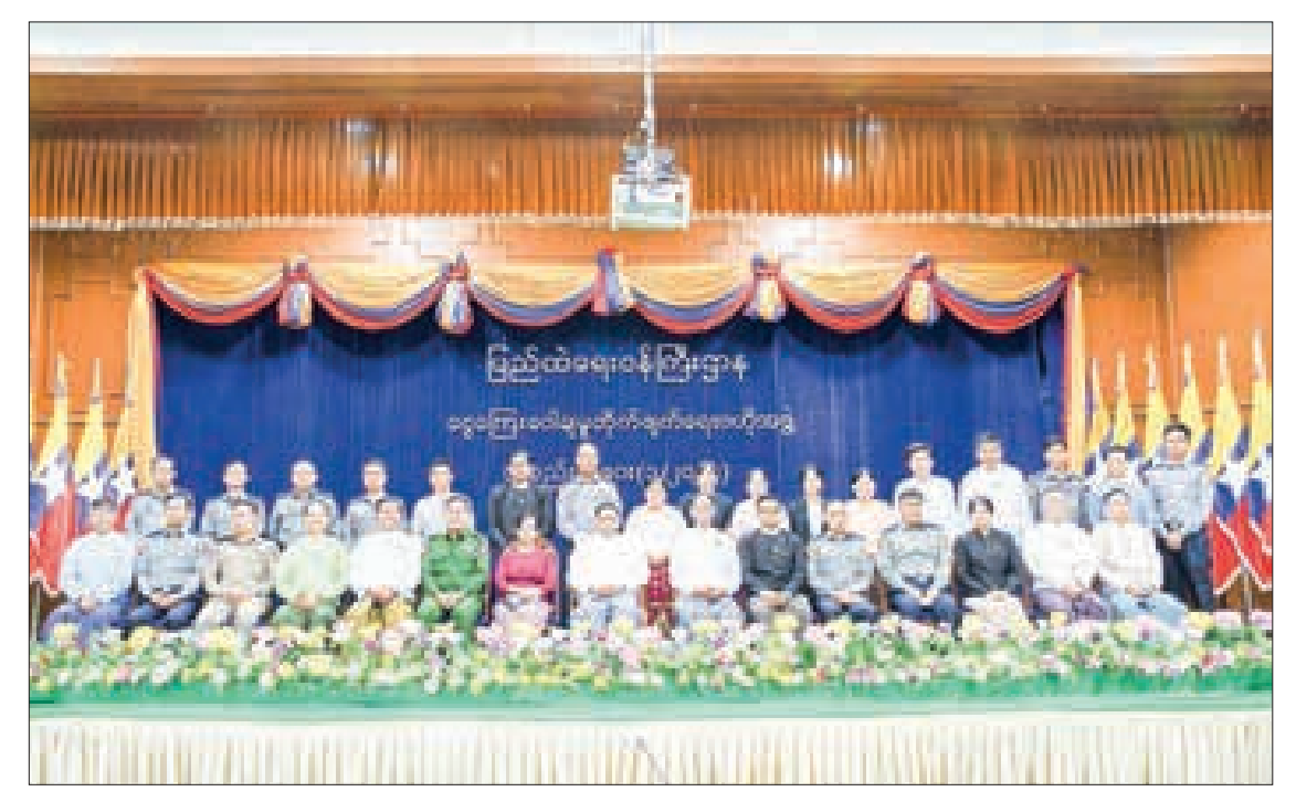
State Administration Council Member Union Minister for Home Affairs Lt-Gen Yar Pyae and attendees pose for the documentary group photo during the 1/2024 meeting of Central Body on Anti-Money Laundering yesterday.

Speaking at the event, State Administration Council Member Union Minister for Home Affairs Lt-Gen Yar Pyae, who is also chairman of the central body, said the central body completed implementing Anti-Money Laundering and Countering the Financing of Terrorism (AML CFT) national-level strategy (2019-2023) in December 2023 and the deputy minister-led national strategic review committee was organized to review the plan and draft national-level strategy (2024-2028). The drafted strategy will be approved during the meeting, and the relevant ministries and organizations should work together to achieve