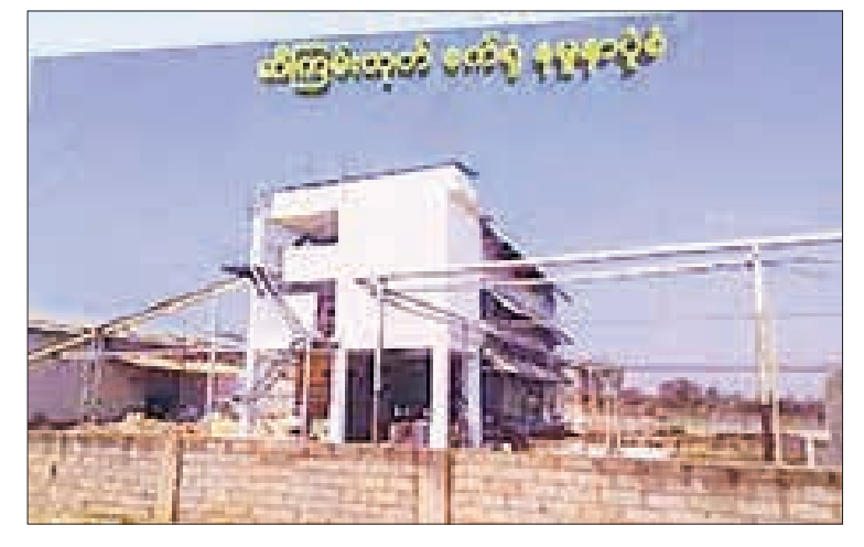
The image shows Myanmar's first crude and refined bran oil mill, which will be built in Nay Pyi Taw.

In addition, he also said that the MRF will provide technical and financial assistance to those who want to produce electricity from rice husks in order further to develop the production of electricity from rice husks. – MT/ZN