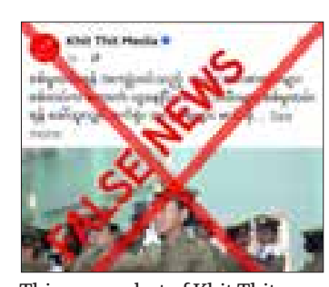
This screenshot of Khit Thit media validate fake news.

Malicious media outlets and terrorists are merely spreading propaganda to intimidate people with misinformation about the People's Military Servants Law. — MNA/TKO