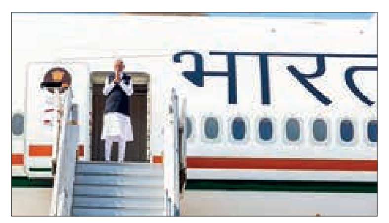
The visit underscores a mutual commitment to democracy and pluralism, setting the stage for enhanced bilateral cooperation in the coming years.

Prime Minister Narendra Modi has embarked on a visit to Poland and Ukraine, marking a significant milestone as both nations celebrate 70 years of diplomatic relations with India.