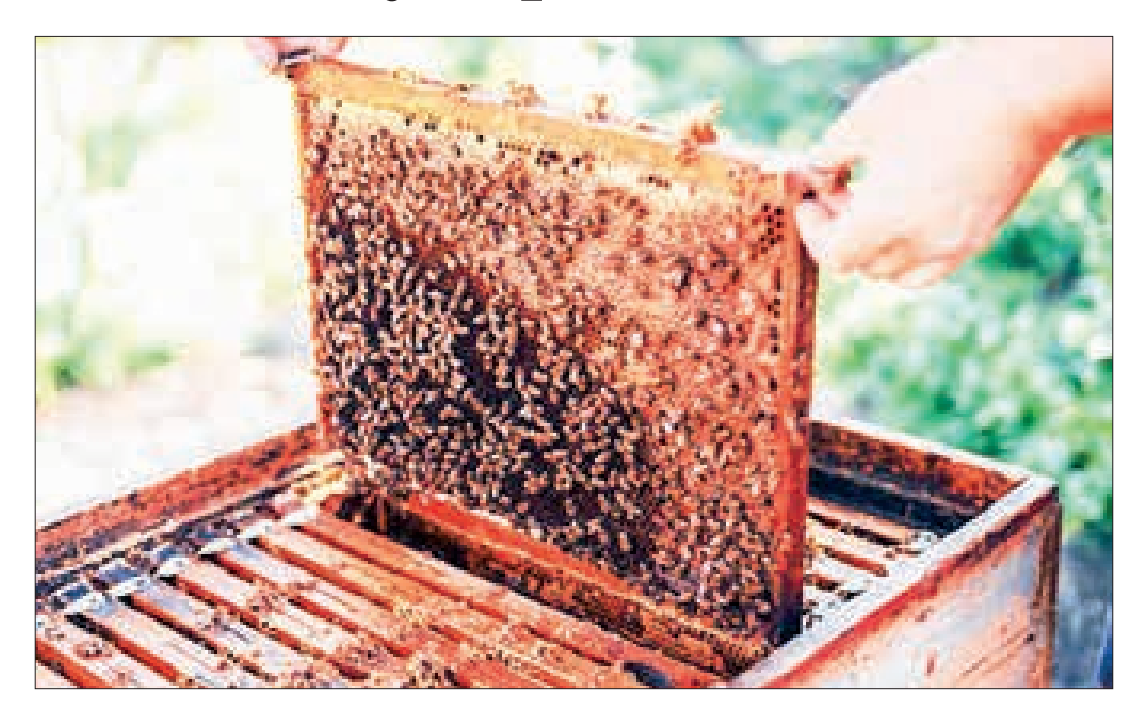
Beekeeper checks a honeycomb frame from a beehive box at an apiary.

MYANMAR earned almost US$1 million from export of over 664.8 metric tonnes of honey in the first four months of the current financial year 2024-2025, beginning 1 April, according to the Apiculture Division under the Livestock Breeding and Veterinary Department.