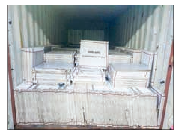
Confiscated illegal items in different states and regions.

UNDER the supervision of the Illegal Trade Eradication Steering Committee, efforts to combat illegal trade continue effectively in accordance with the law.