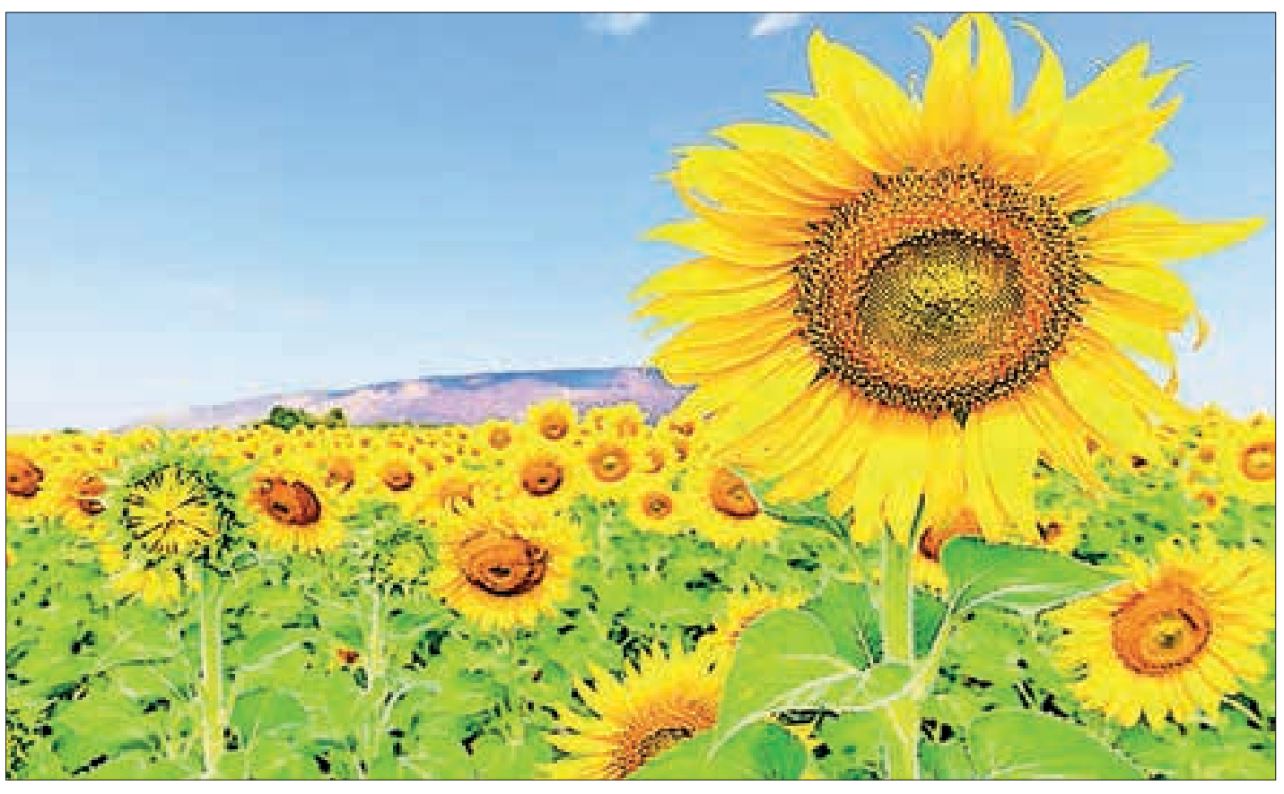
A sunflower plantation in the central Myanmar area – an essential oil crop to reduce palm oil imports.

Yangon house moving services market expands with increased users