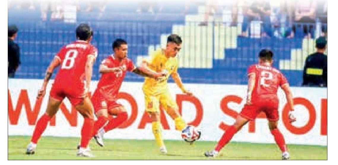
A player from Vietnam's Thanh Hoa dribbles the ball against players from Shan United on 21 August 2024.

The Shan United is scheduled to match with Indonesian club PSM Makassar on 25 September.