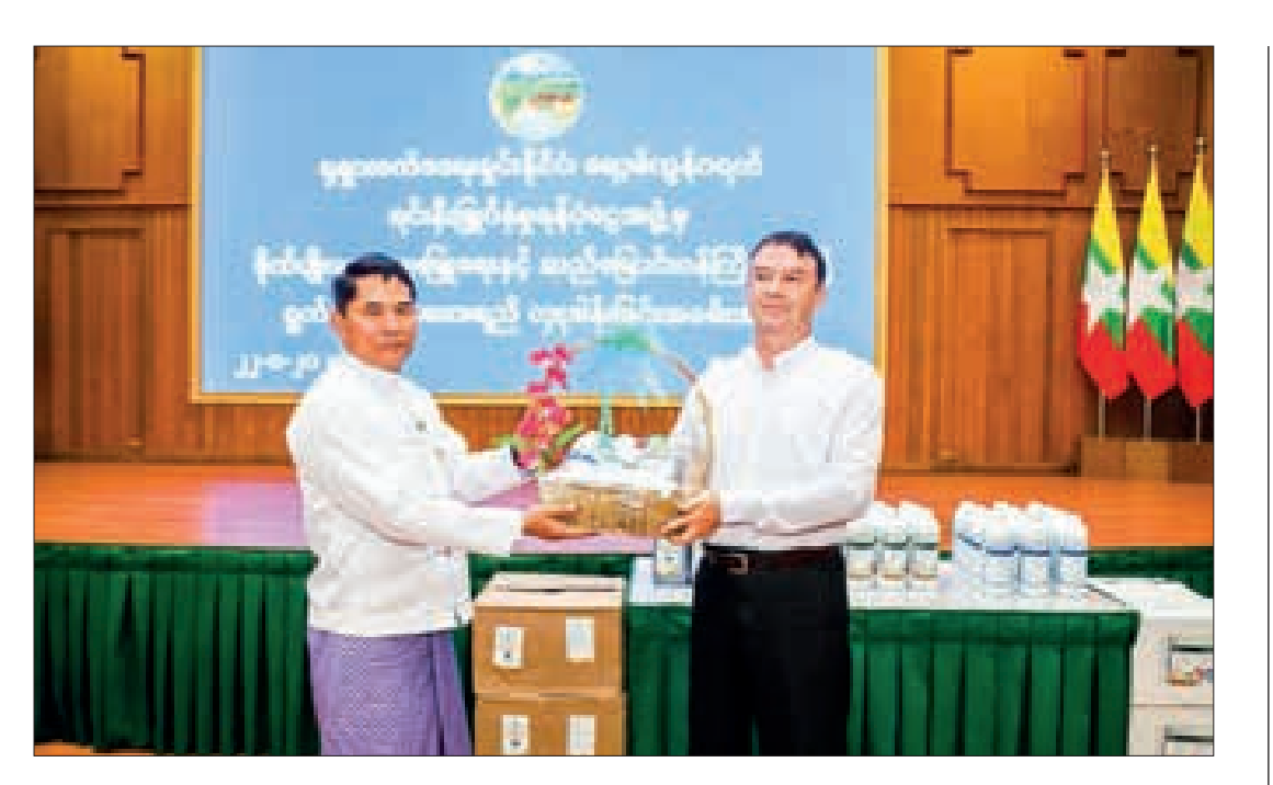
Union Minister U Min Naung receives the handover of plant nutrient spray for monsoon paddy yesterday.

Finally, the Union minister provided proper instructions. — MNA/KTZH