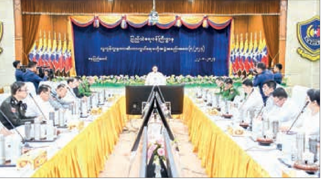
The 1/2024 meeting of the Central Body for Suppression of Trafficking in Persons in progress yesterday in Nay Pyi Taw, chaired by SAC Member Union Minister Lt-Gen Yar Pyae.

After the outbreak of COV-ID-19, online communication,