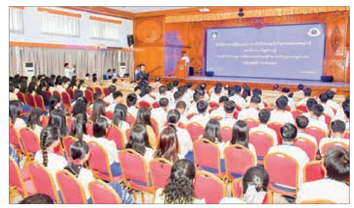
The awareness seminar on anti-corruption jointly organized by the Anti-Corruption Commission and the Ministry of Foreign Affairs in progress yesterday.