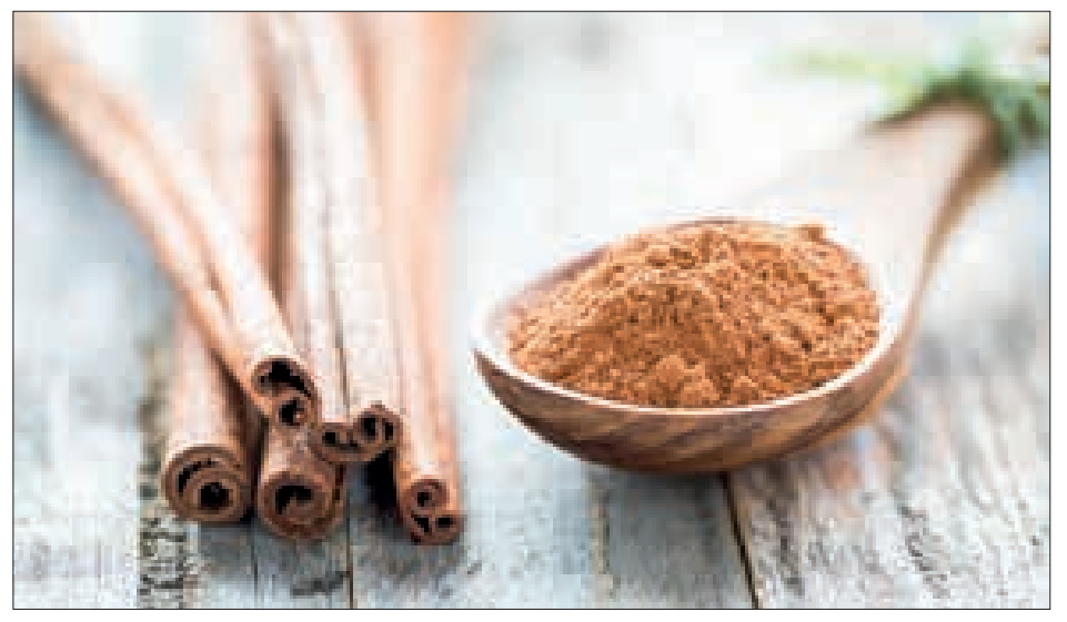
Cinnamon is a spice derived from the inner bark of trees from the genus Cinnamomum, commonly used in cooking and baking for its warm, sweet flavor.

The country's cinnamon is grown across 180,000 hectares, with reserves estimated at 900,000 to 1,200,000 tonnes and an annual harvest of 70,000 to 80,000 tonnes.