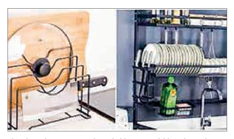
This photo showcases some household items available in the market.

THE sale of household utensils has flourished now in Yangon, according to shop owners.