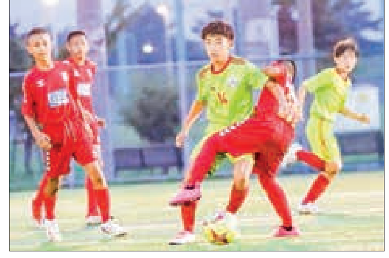
This photo shows the match between Myanmar U-12 and Japan's Dragon Kashiwa teams.