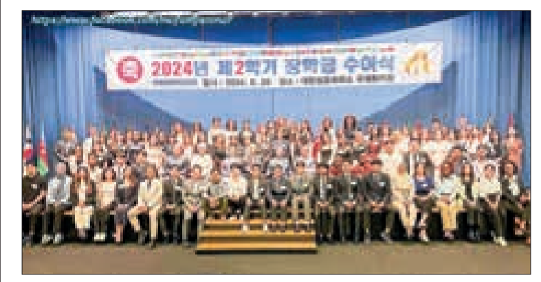
This photo shows attendees at the Woojung Education and Culture Foundation Scholarship Award.

It is confirmed that over 50 of Thu Wun's creations will be available for purchase at the exhibition. — ASH/TRKM