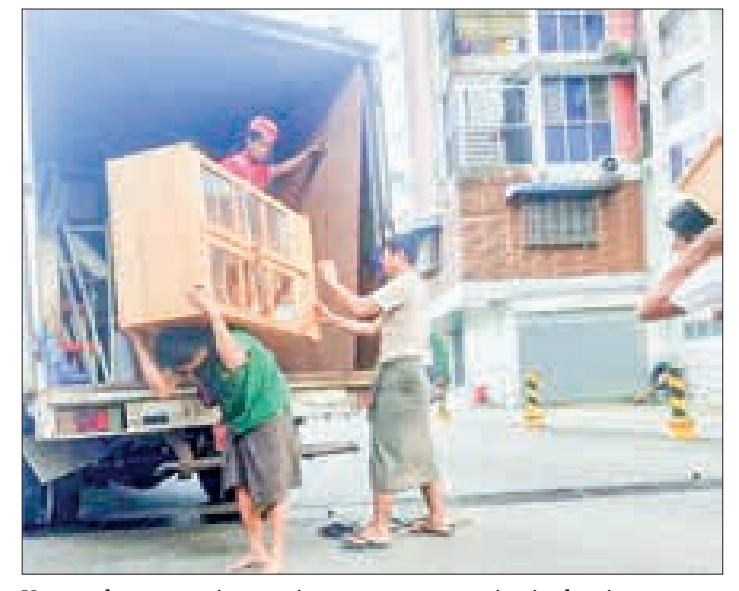
Yangon home moving services are seen operating in the city.

When using this service, in addition to saving time and