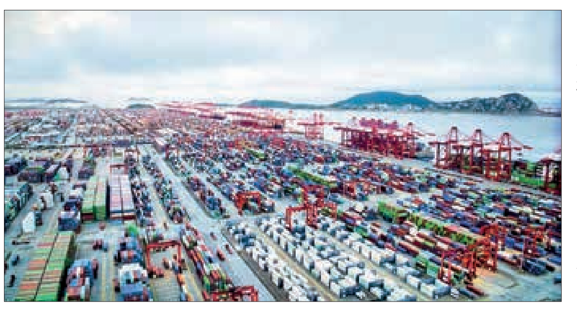
This photo taken on 17 September 2023 shows a view of the automated container terminal of Shanghai Yangshan Deep Water Port in east China's Shanghai.

In 2023, Shanghai Port handled 49.16 million TEUs, maintaining its position as the world's top port for container throughput for the 14<sup>th</sup> consecutive year.