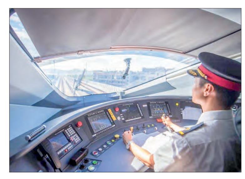
A bullet train driver works on the trial bullet train G55701 on the new high-speed railway linking Hangzhou and Wenzhou in east China's Zhejiang Province, 30 July 2024.

hooked with the high-speed railway network in the delta region. Rich tourism resources including Hangzhou, a city dubbed "Heaven on Earth" for its architectural delights, as well as Xianhua Mountain and Nanxi River are connected to the line. The line is of great significance for facilitating the public travel and promoting higher-quality integrated development of the Yangtze River Delta, said Wang. — Xinhua