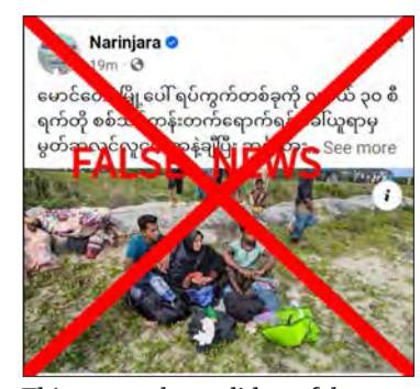
This screenshot validates false

According to a security official, such news was invalid, and AA terrorists launched attacks on non-military targets in towns and villages, killed local