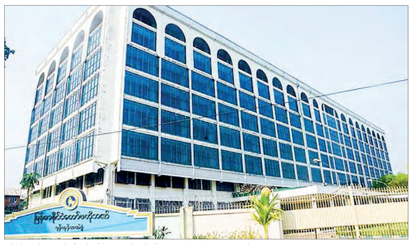
File photo showing the facade of the Central Bank of Myanmar (CBM) Yangon Branch.

With a view to facilitating the purchase of foreign currencies in addition to internationally accepted debit cards and credit cards and curbing foreign exchange market manipulation by illegal money changers, those studying abroad, working abroad and travelling abroad for medical treatment are entitled to buy foreign currencies that are equivalent to US$300-500 per person at the authorized banks' foreign exchange counters and money