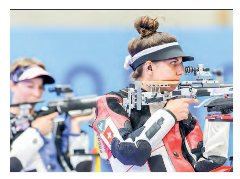
Chiara Leone of Switzerland competes during the 50-metre rifle 3 positions women's final of shooting at the Paris 2024 Olympic Games in Chateauroux, France, 2 August 2024.

CHIARA Leone won the women's 50-metre rifle 3 positions to win Switzerland's first gold medal at the Paris Olympics here on Friday.