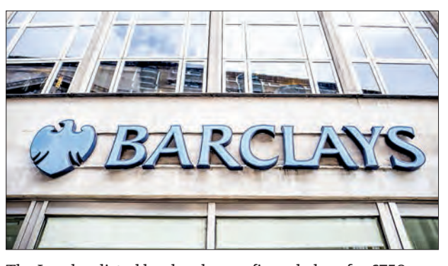
The London-listed lender also confirmed plans for £750 million in share buybacks.

However, in the same period, over 17,900 firms were estimated to withdraw from the market each month, according to the office. — Xinhua