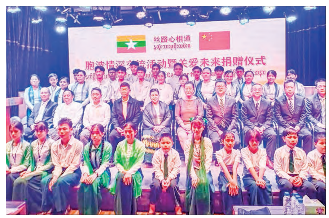
This photo shows the group documentary picture at the sports equipment donations to six schools as part of the 'Silk Road from the Hearth: Care for the Future'.

THE China Foundation for Peace and Development (CFPD) and the Myanmar Chinese Cooperation and Communication Centre donated sports equipment to six basic education schools in Yangon Region yesterday as part of the 'Silk Road from the Heart: