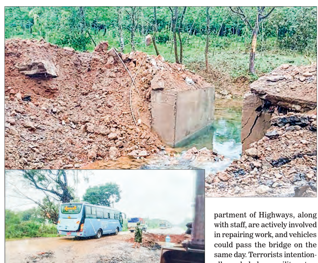
Photos (top and above) depict the aftermath of the bridge blast caused by terrorists.

KNLA and PDF terrorists reportedly planted explosives on the No 3/136 reinforced concrete bridge between 134/4 and 134/5 mileposts along the Yangon-Mawlamyine Union Highway in Thaton Township, Mon State, yes-