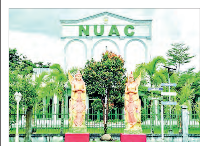
The National University of Arts and Culture, Yangon.

THE National University of Arts and Culture, Yangon, will conduct five courses for the Master of Arts in the 2024-25 academic vear.