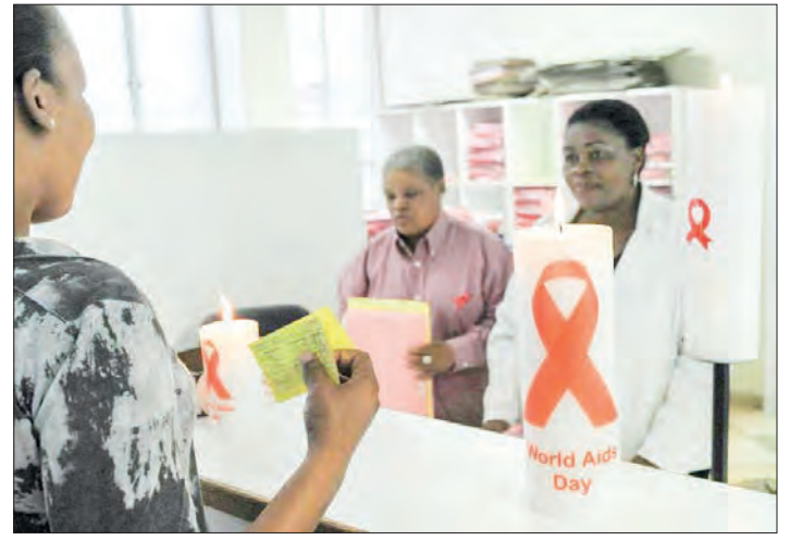
South Africa has the highest number of HIV-positive individuals globally.

South Africa has the highest number of HIV-positive individuals globally. The Tuesday report shows that the estimated overall HIV prevalence rate