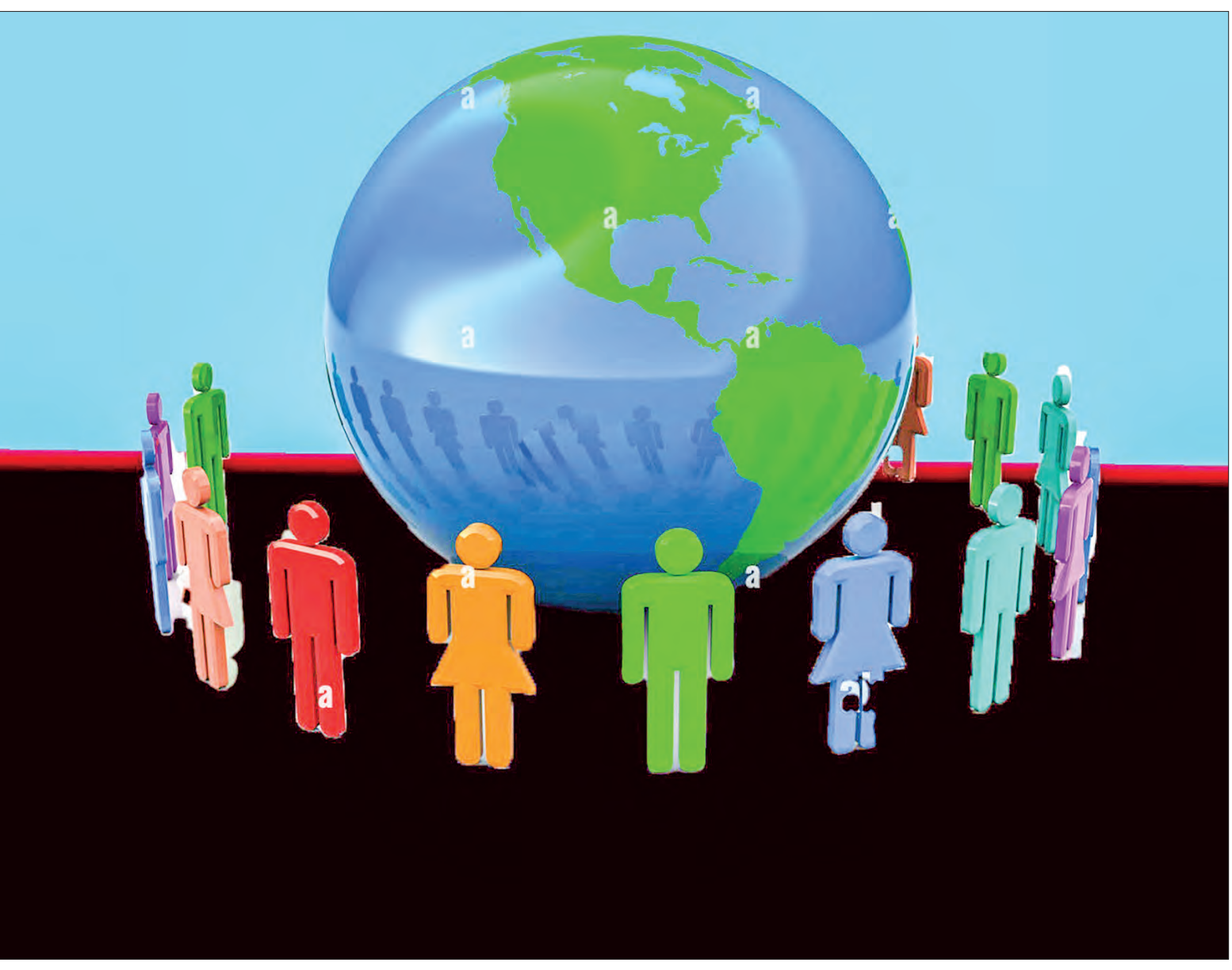
All in all, the comparison between the Earth and the World serves as a metaphor for understanding the differences and similarities between our

All in all, the comparison between the Earth and the World serves as a metaphor for understanding the differences and similarities between our personal worlds. While the Earth is a physical entity, the world is shaped by our experiences. actions, and relationships. By embracing our roles and responsibilities within our own worlds, we can make meaningful contributions to the broader human experience. And in doing so, we find contentment, purpose, and a sense of fulfilment that transcends the boundaries of our individual lives.