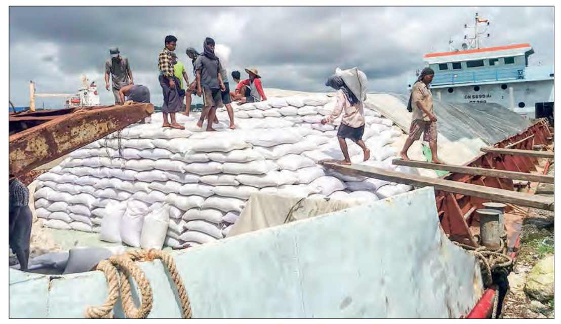
Rehabilitation cargo being loaded onto a vessel for transport to Rakhine State.

UNDER the guidance of the National Disaster Management Committee and managed by the Transport and Communications Committee, 404.75 tonnes of rehabilitation materials, including 7,897 rice bags (each containing 24-Pyi) sent by the Ministry of Social Welfare, Re-