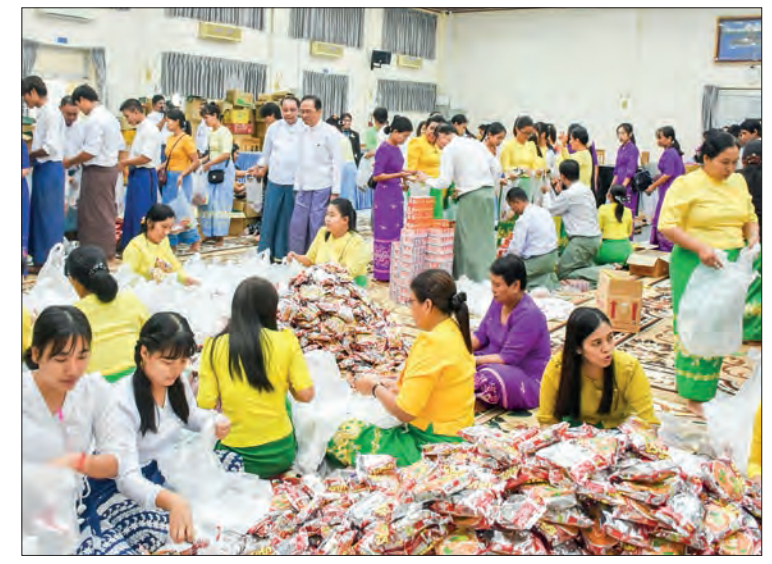
Union Minister Dr Thet Khaing Win views round the preparation for the ministry's donations yesterday.

Donations from the Ministry of Health include K22.6 million worth of foodstuffs and medicines. Moreover, officers and staff put their messages of encouragement in the parcels for Tatmadaw and security force members, who sacrifice for State defence and security duties on the frontline. — MNA/KTZH