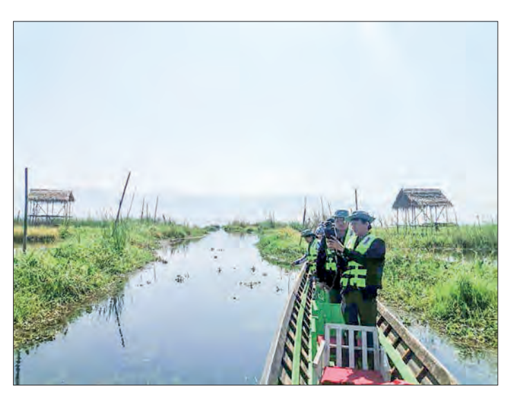
Air quality measurement operations are in progress in some areas of the country.

in Nay Pyi Taw Union Territory, Regions, and States in June 2024 indicates that most townships have an air quality index ranging from 51 to 100, which is considered satisfactory.