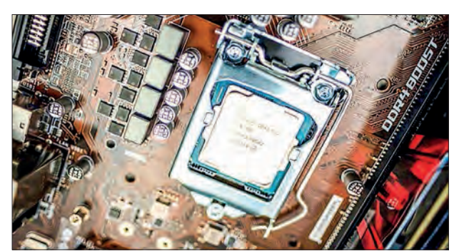
US chip maker Intel said Thursday it will slash more than 15 per cent of its workforce as it streamlines operations.

Second quarter earnings were negatively affected by "headwinds" to the ramp-up of Intel's artificial intelligence PC product and unused capacity at its facilities, according to