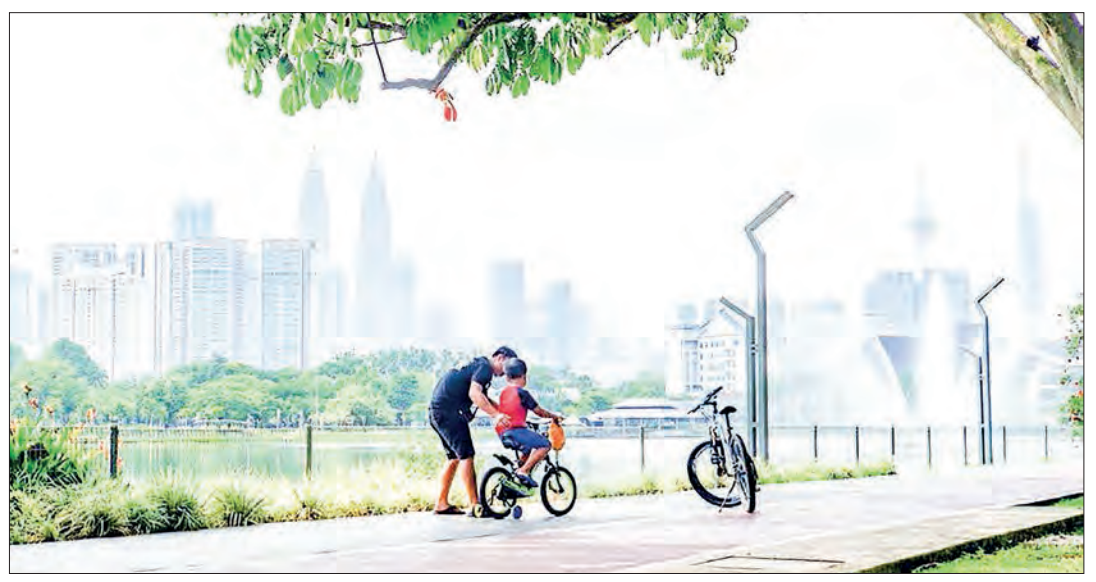
People ride a bicycle at a park in Kuala Lumpur, Malaysia, 11 March 2022.

The number of citizens rose from 30.4 million to 30.7 million, with the growth rate slowing from 0.8 per cent to 0.7 per cent.