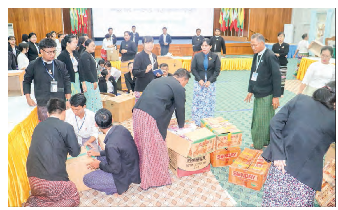
Union Minister Dr Thida Oo oversees the preparation for donations yesterday.

The collective donation includes K9 million in cash and food supplies worth K3.5 million, consisting of coffee, noodles, snacks, instant tea sachets, fish sauce, mixed fried snacks, and canned fish intended for 200 Tatmadaw members. The donation reflects the Ministry's gratitude and support for those who serve on the frontlines. — MNA/KZL