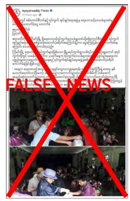
This screenshot reveals misinformation.