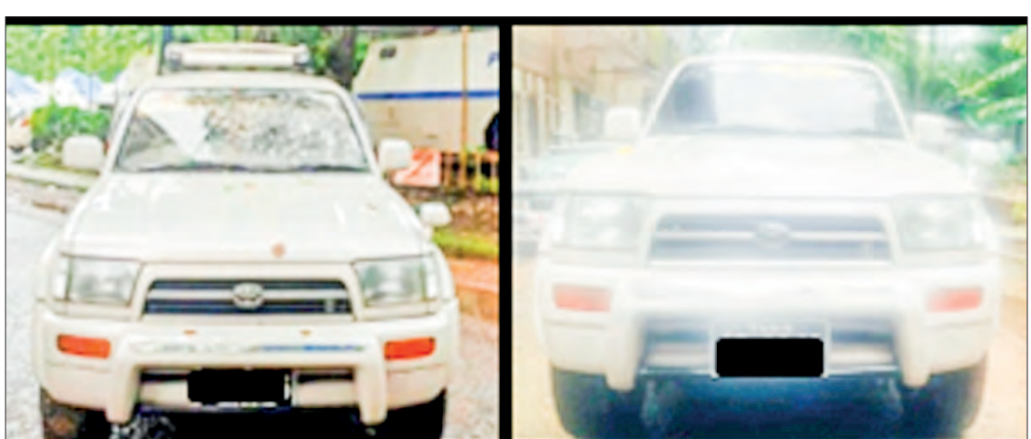
Photos\ show\ of fenders\ and\ confiscated\ drugs,\ a\ motor\ launch,\ vehicles,\ property\ and\ we apons.