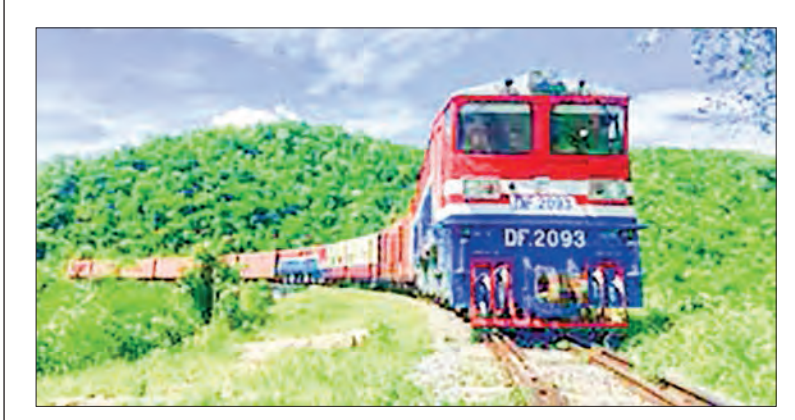
A Yangon-Mawlamyine train is seen running.

The train schedule was cancelled on 29 July due to the flooded railroad at the No 60 bridge in the Bago station yard. Yangon-Mawlamyine railway is used by many rail passengers, and train schedules are always packed. — MT/ZS