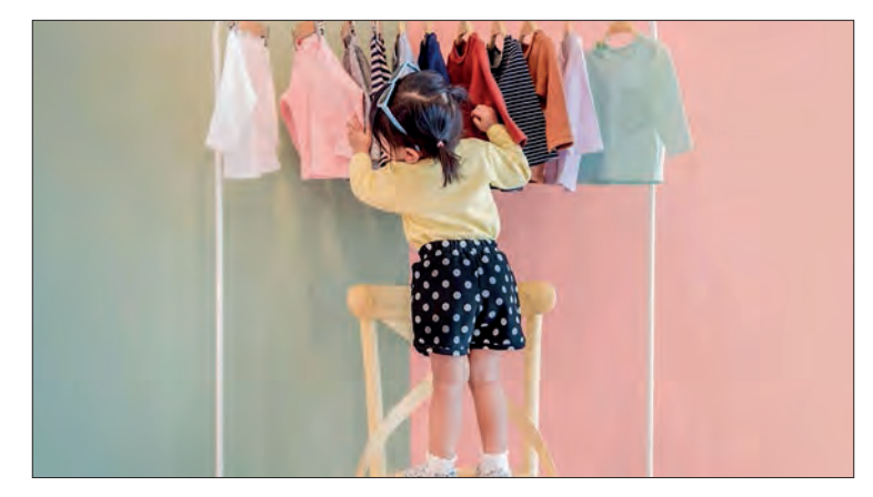
A line of children's clothes featuring slogans about lazy, uninvolved fathers have sparked an online backlash.

"This is discrimination against fathers," another posted. A satirical clothing line critiquing gender inequality in Japan highlights that women spend 5.5 times more on unpaid work than men. — AFP