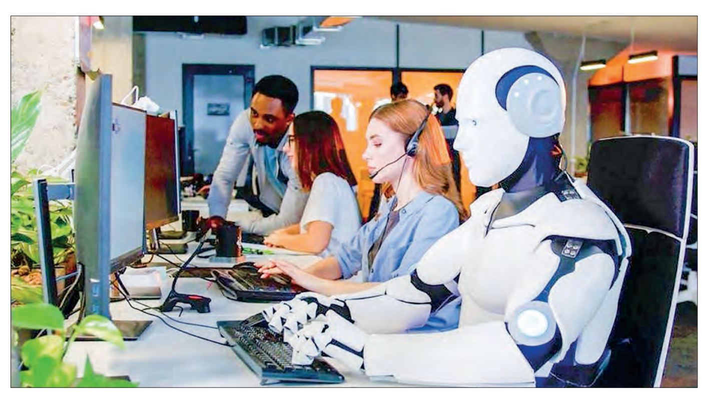
European Commission President Ursula von der Leyen emphasized the law's role in creating clear rules for businesses while safeguarding individual rights.

The European Union's new AI regulation went into effect on Thursday, aiming to balance innovation with citizen protection.