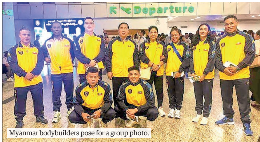
Myanmar bodybuilders pose for a group photo.

The Myanmar team will showcase their skills and represent the country in this prestigious regional competition. — Arka Lin/KZL