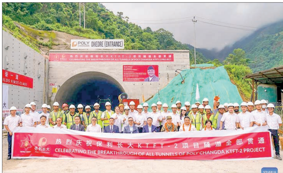
Participants pose for a group photo at the construction site of Nepal's major fast-track package 2 project in Makwanpur district of Nepal, 5 August 2024.

THE last tunnel was broken through on Monday for the package 2 project contracted by a Chinese company under the Kathmandu-Terai/Madhesh fast track project, which