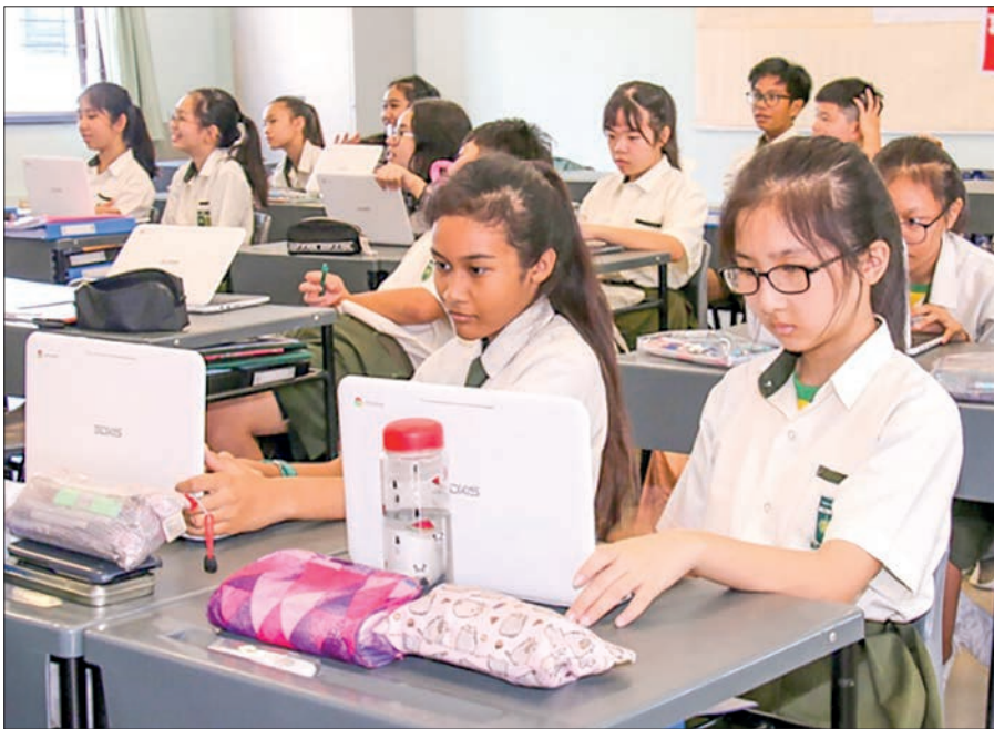
The photo shows some students learning in Singapore.

For other classes, the school leaving certificate (original) for the