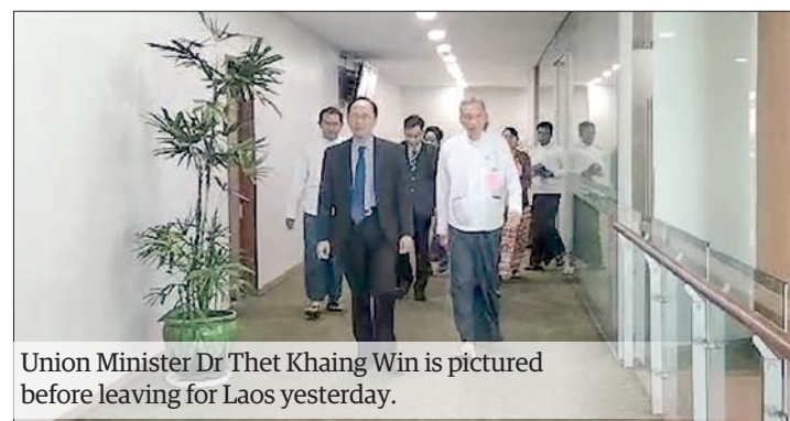
Union Minister Dr Thet Khaing Win is pictured before leaving for Laos yesterday.

and the advancement of digital technologies in healthcare. — MNA/KZL