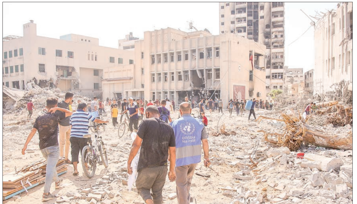
People walk on rubble as they inspect the damage at the UN Relief and Works Agency for Palestine Refugees (UNRWA) building complex in western Gaza City's Al-Sinaa neighbourhood on 12 July 2024, following the withdrawal of Israeli troops from the area amid the ongoing conflict between Israel and the militant Hamas group in the besieged Palestinian territory.

Hamas in retaliation for the 7 October attack, which resulted in the deaths of 1,197 people, mostly