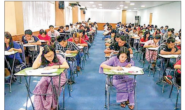
This photo shows students sitting for the Japanese Language Proficiency Test (JLPT) last year.

Further detailed information will be announced later. — TWA/MKKS