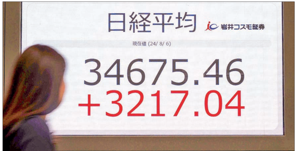
A financial data screen in Tokyo shows the Nikkei stock index soaring over 3,200 points to close at 34,675.46 on 6 August 2024.

THE Nikkei stock index closed with its largest single-day point gain in history on Tuesday, soaring over 3,200 points as shares drew widespread buying after the previous day's record plunge.