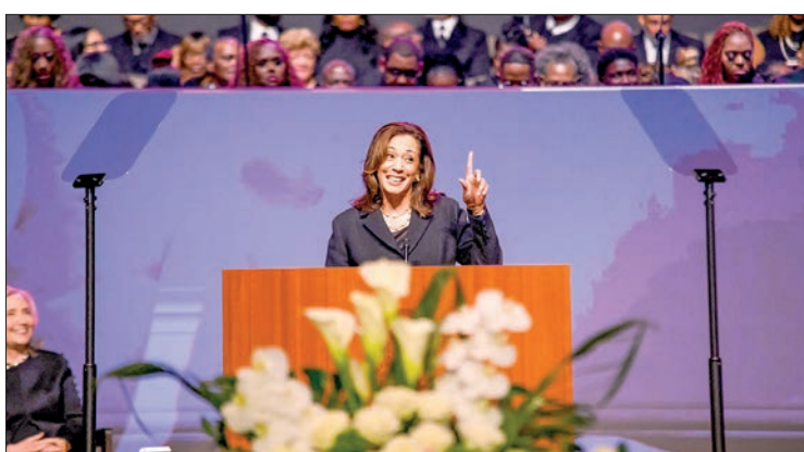
US Vice-President and 2024 Democratic presidential candidate Kamala Harris delivers the eulogy for US Representative Sheila Jackson Lee at Fallbrook Church in Houston, Texas, on 1 August 2024.

Prime Minister Fumio Kishida, who represents a constituency in Hiroshima, cautioned in his speech at the ceremony that the momentum toward a world without nuclear weapons is on the verge of reversal for the first time since the height of the Cold War: "It is our duty as the sole country to have experienced the use of nuclear weapons in war to steadily work towards realizing a world without nuclear weapons," he said. — Kyodo