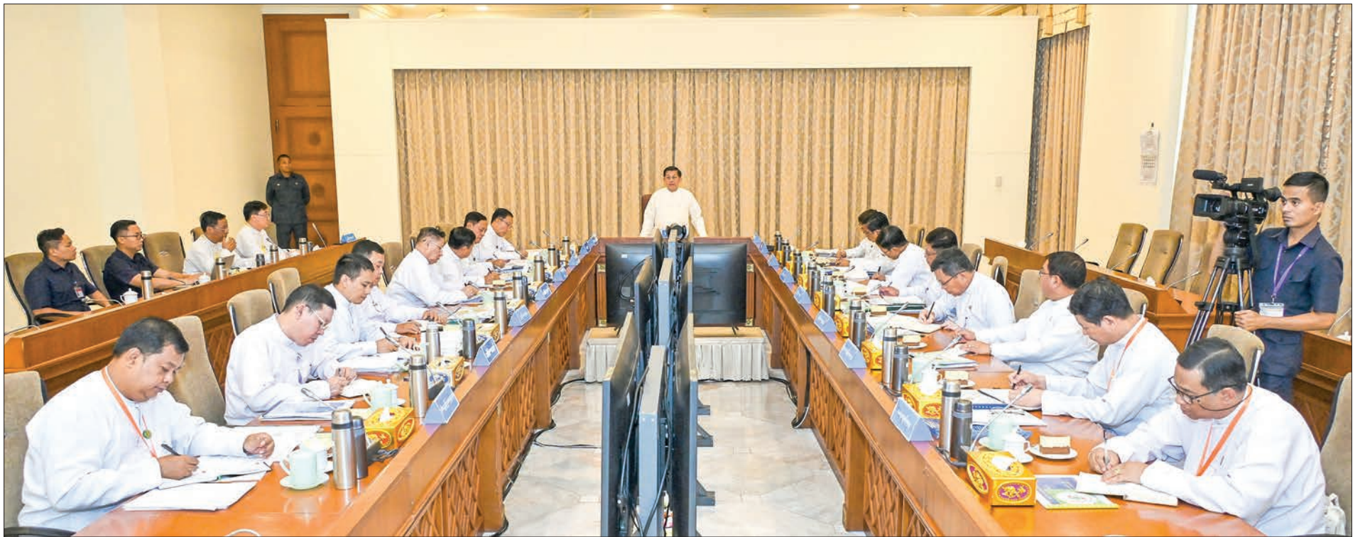
State Administration Council Chairman Prime Minister Senior General Min Aung Hlaing delivers a speech at the agriculture and livestock coordination meeting yesterday in Nay Pyi Taw.