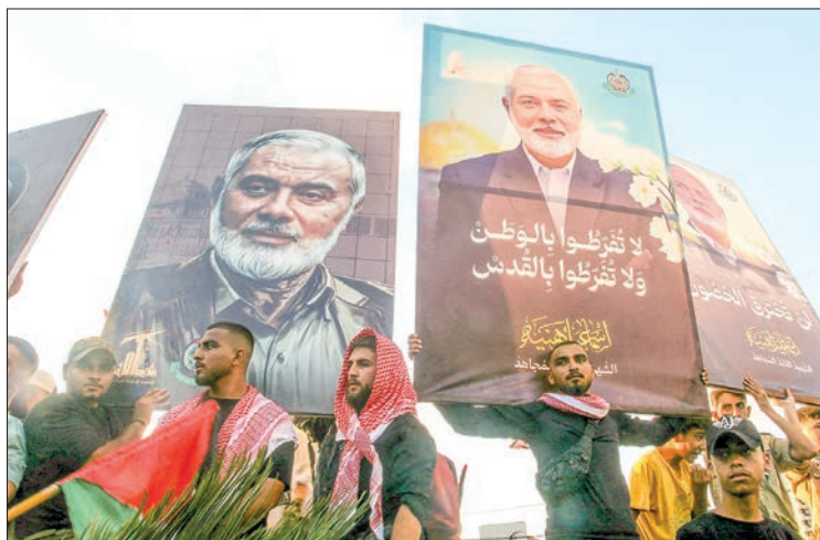
People take part in a march called by Palestinian and Lebanese youth organizations in the southern Lebanese city of Saida on 5 August 2024 to protest against the assassination of Hamas chief Ismail Haniyeh (portrait) and a Hezbollah military commander.