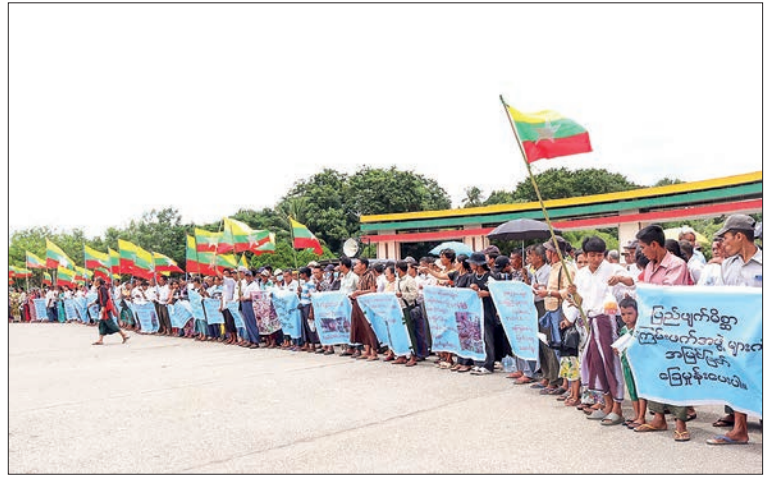
Photos show anti-terrorism protests are in action yesterday in Yangon (L) and in Nay Pyi Taw (R).