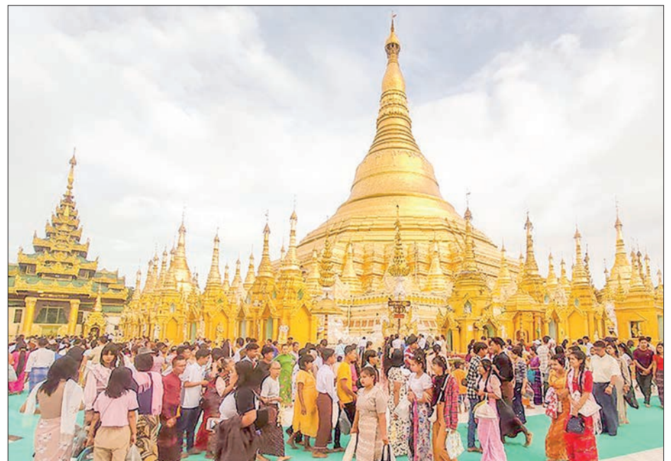
Devotees and well-wishers throng on the platform of Shwedagon.