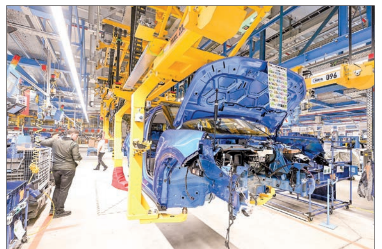
Employees work on the production line of the 100% electric Ford Explorer at the Ford Electric Centre Factory in Cologne, western Germany, 4 June 2024.

But the order data, closely watched as an indicator of future business activity, was 11.8 per cent lower from the same month a year earlier, according