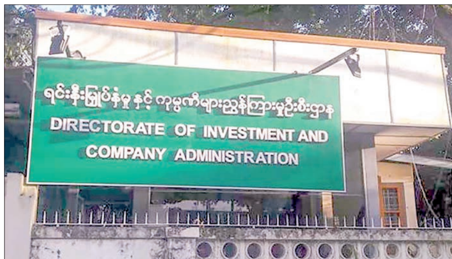
The signage of the Directorate of Investment and Company Administration (DICA) office in Yangon.

A total of 11,500 companies were struck off the register in the past seven months (January-July) of 2024 as they failed to file annual returns (AR) on the online registry system, MyCO, according to the Directorate of Investment and Company Administration (DICA).