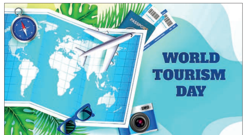
The photo commemorates the 2024 World Tourism Day. PHOTO:

This competition aims to highlight the role of tourism in promoting peace and fostering global cooperation, aligning with World Tourism Day's celebration. — ASH/KZL