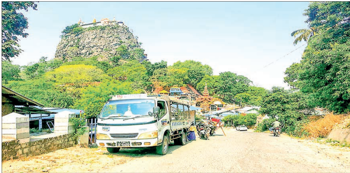
Vehicles with visitors on board are seen at the scenic backdrop of Mount Popa and its Taungkalat.

"Now they travel between Bagan and Popa. There are more visitors on holidays and religious occasions. Fewer people come on office days. Most people go to Taungkalat in Popa. As we provide services to Mount Popa, some come to hike. They spend one night at Bagan and a night camp here. The ordinary pilgrims go to Taungkalat. There is a direct bus from Yangon to Popa. Some visitors are from Mandalay, Magway and Pakok-