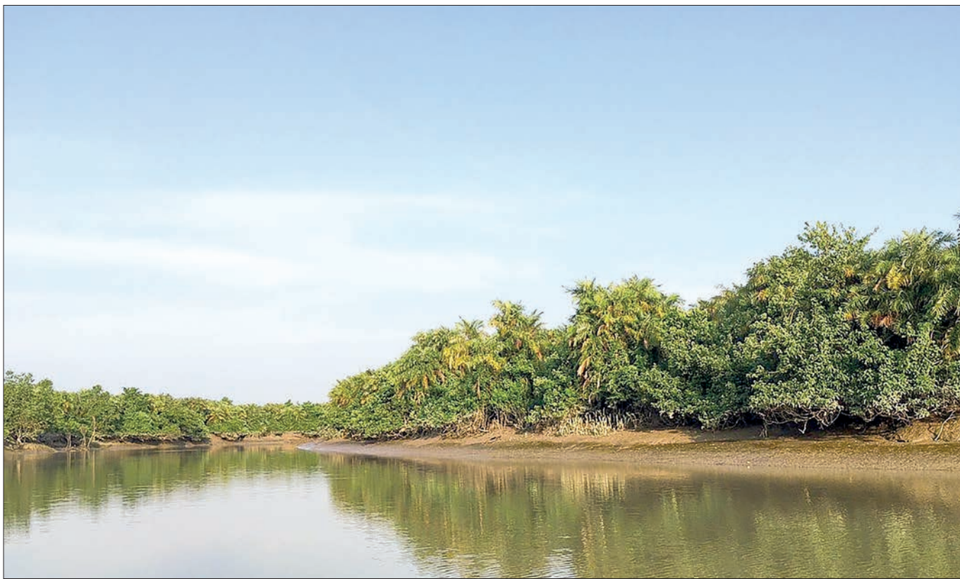
The picture captures the Mainmahla Kyun Wildlife Sanctuary in Bogale Township, Pyapon District of Ayeyawady Region.

sesame, Niger and oil palm are thriving in Myanmar, the country imports cooking oil yearly. As oil crops do not meet the target production, production cost is higher, he added. SEE PAGE 3