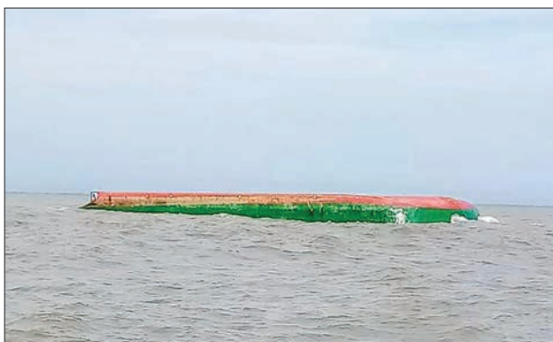
The picture captures the real-time condition of the sinking MV Tung Sung.

THE life compensation for three Myanmar sailors who died in the sinking of MV Tung Sung is likely to be quickly received, according to the Myanmar Seafarers Federation (MSF).