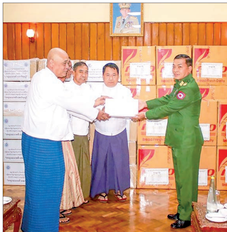
The Nay Pyi Taw Command commander accepts the donations.

The staff also sent their messages of encouragement to