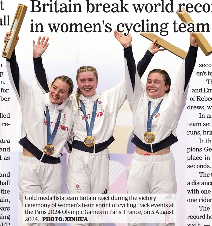
Gold medallists team Britain react during the victory ceremony of women's team sprint of cycling track events at the Paris 2024 Olympic Games in Paris, France, on 5 August 2024.

BRITAIN set a new world record of 45.186 seconds in winning the gold medal in the women's team sprint at the Paris Olympics on Monday.