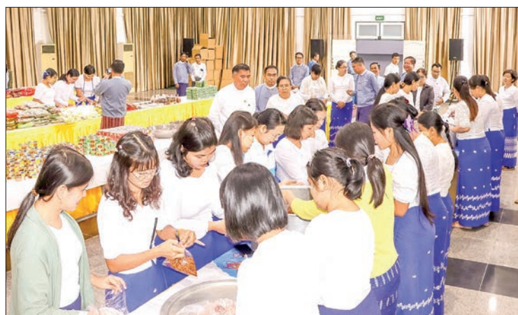
The preparations for the donations to Tatmadaw and security force members are in progress yesterday in Nay Pyi Taw.

Similarly, the Ministry of Immigration and Population family led by Union Minister U Myint Kyaing donated K25 million worth of 19 types of foodstuffs on that day.