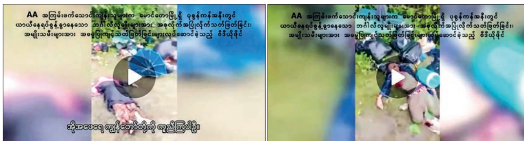
Images of the video footage showing AA's sexual assault and killing.

AA terrorists were anxious that the international community should know their terror acts, and so they brutally killed Bengalis who arranged to move to other countries. The video footage of AA's murder went viral on social networks. — MNA/KTZH