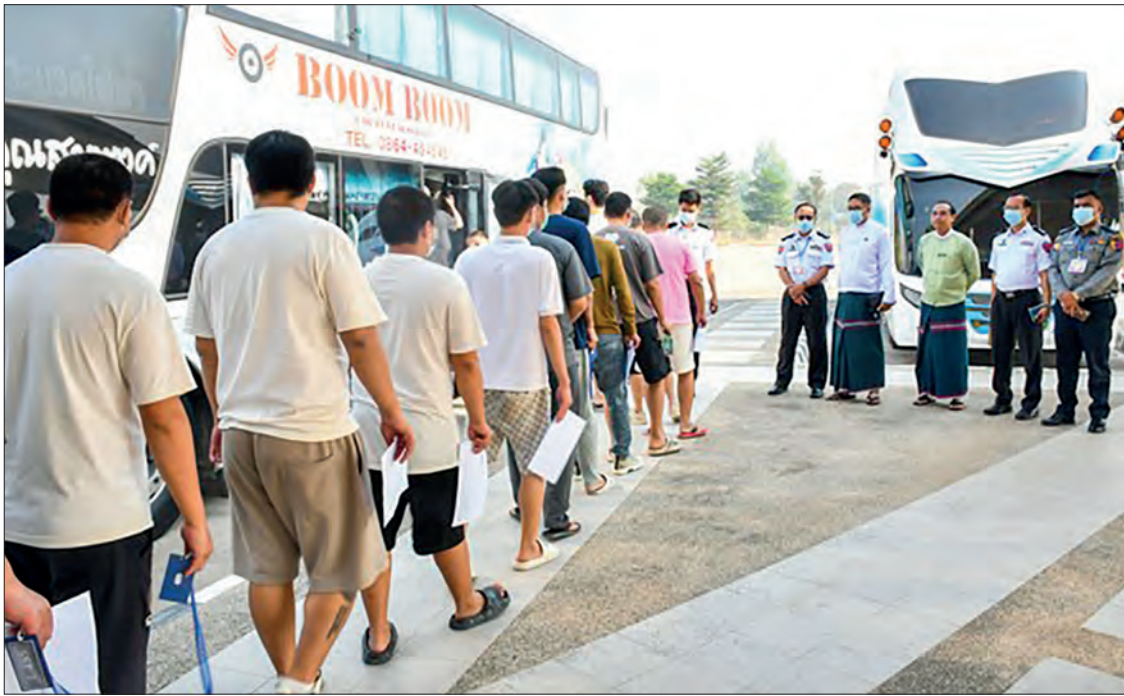
Myanmar Immigration and officials overseeing the deportation of foreign nationals yesterday.

MYANMAR authorities sent back 365 Chinese nationals, who were involved in online gambling, telecom fraud and destructive actions, via the Myanmar-Thailand Friendship Bridge II on humanitarian grounds and for bilateral relations yesterday.