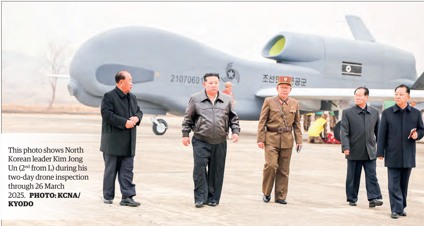
This photo shows North Korean leader Kim Jong Un (2 nd from L) during his two-day drone inspection through 26 March 2025.