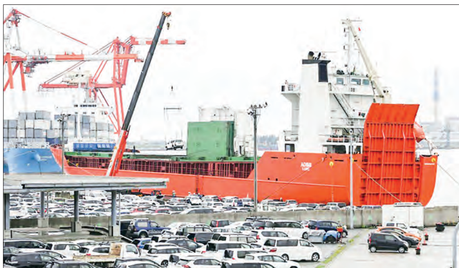
A cargo vessel loads cars at a port in Imizu, Toyama Prefecture.

“We strongly urged (the US government) to exclude Japan from the measure,” Chief Cabinet Secretary Yoshimasa Hayashi said, adding he was instructed by Prime Minister Shigeru Ishiba to have related ministers cooperate in responding to the issue. Industry minister Yoji Muto separately told reporters the government