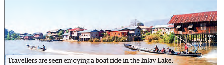
Travellers are seen enjoying a boat ride in the Inlay Lake.

The Myanmar traditional New Year festival, Ata Thingyan, was inscribed on the Representative List of Intangible Cultural Heritage of Humanity on 5 December at UNESCO’s 19th World Conference held in Asunción, Paraguay.