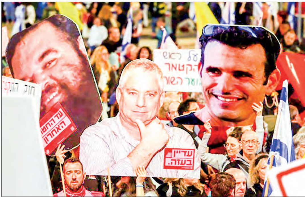
Israeli anti-government demonstrators carry pictures of hostages held in Gaza, during a protest in Jerusalem.

Israel resumed military operations in Gaza just over a week ago after a January truce, leading to increased tensions and violence.