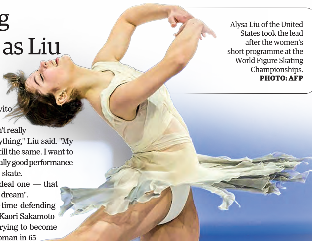
Alysia Liu of the United States took the lead after the women's short programme at the World Figure Skating Championships.

Three-time defending champion Kaori Sakamoto of Japan, trying to become the first woman in 65