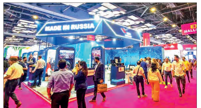
For Russian companies that attended the exhibition, the REC organized over 150 B2B meetings with potential partners, providing opportunities to conclude agreements and establish business contacts.

For Russian companies that attended the exhibition, the REC organized over 150 B2B meetings with potential partners, providing opportunities to conclude agreements and establish business contacts, as per the TV BRICS report. — ANI