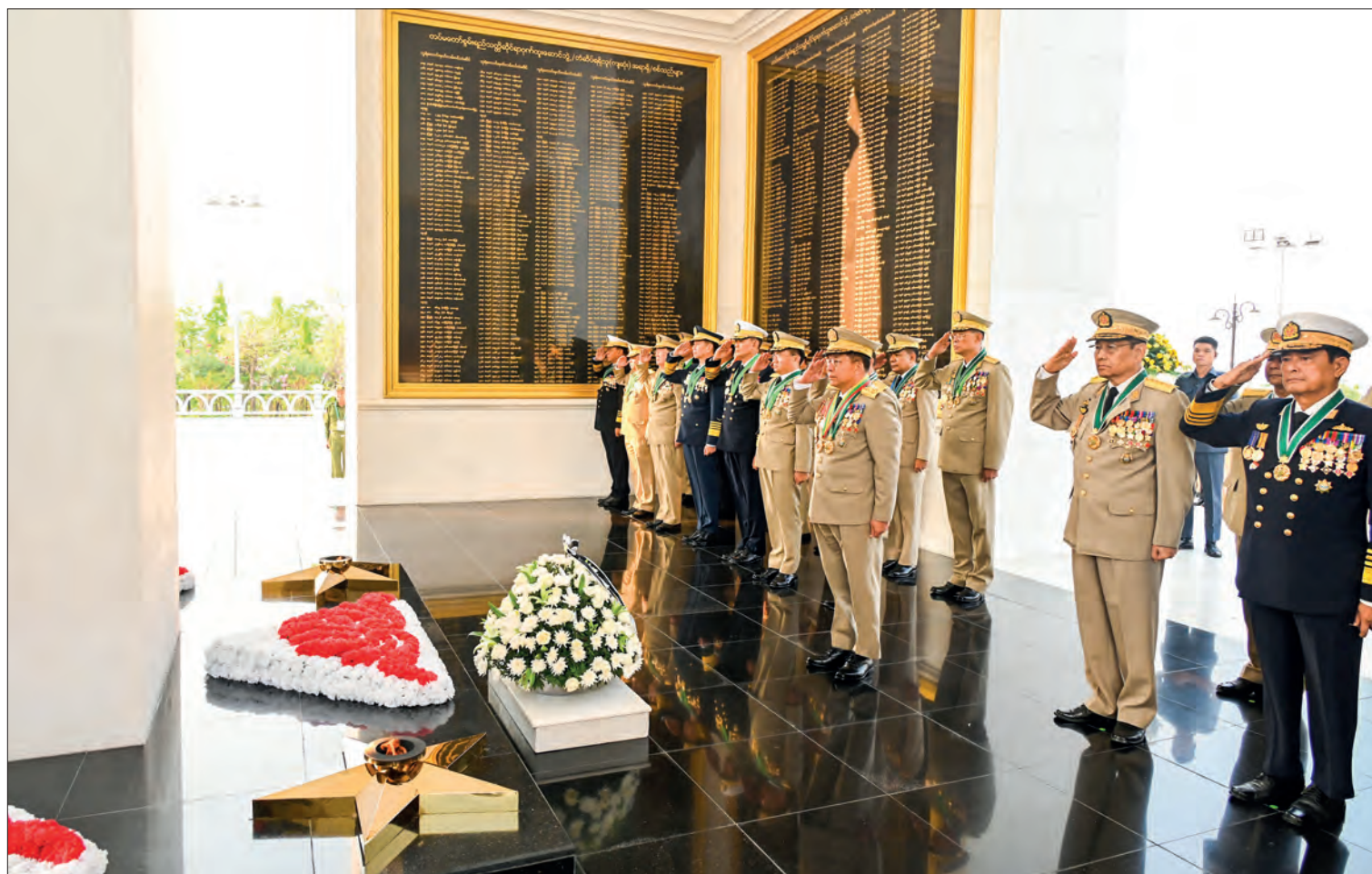
The Senior General alongside senior Tatmadaw officers honour fallen Tatmadaw heroes who gave their lives defending the State's security.

The Memorial to Fallen Heroes (Nay Pyi Taw) was established to honour Myanmar's brave heroes who sacrificed their lives to safeguard the independence and sovereignty of the nation. It also serves as a tribute to those who demonstrated exceptional courage and dedication after the country achieved sovereignty, giving their lives in the process. The memorial aims to ensure that these heroes are forever remembered by future generations and to instil a deep sense of patriotism and willingness to sacrifice for the nation