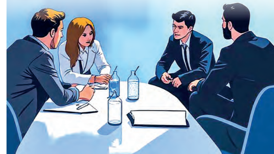
Workplaces are filled with examples of how tone of voice affects interactions. ILLUSTRATION: CONCEPT ART