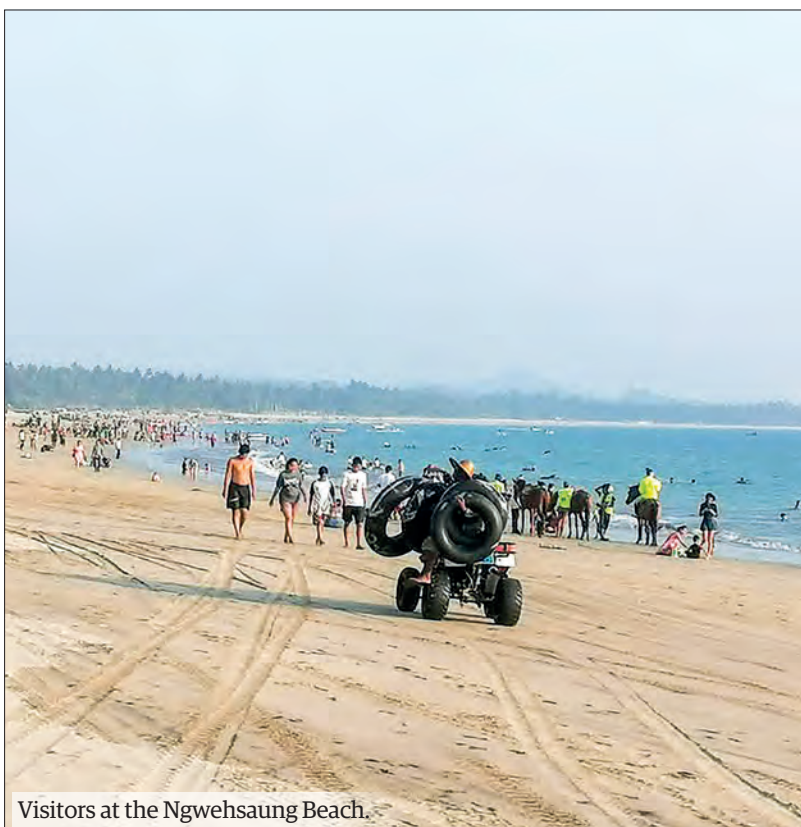
Visitors at the Ngwehsaung Beach.

During the Thingyan holidays, local visitors have made preparations for vacations in local famous destinations and for going on overseas trips, according to tour companies.— MT/ZS