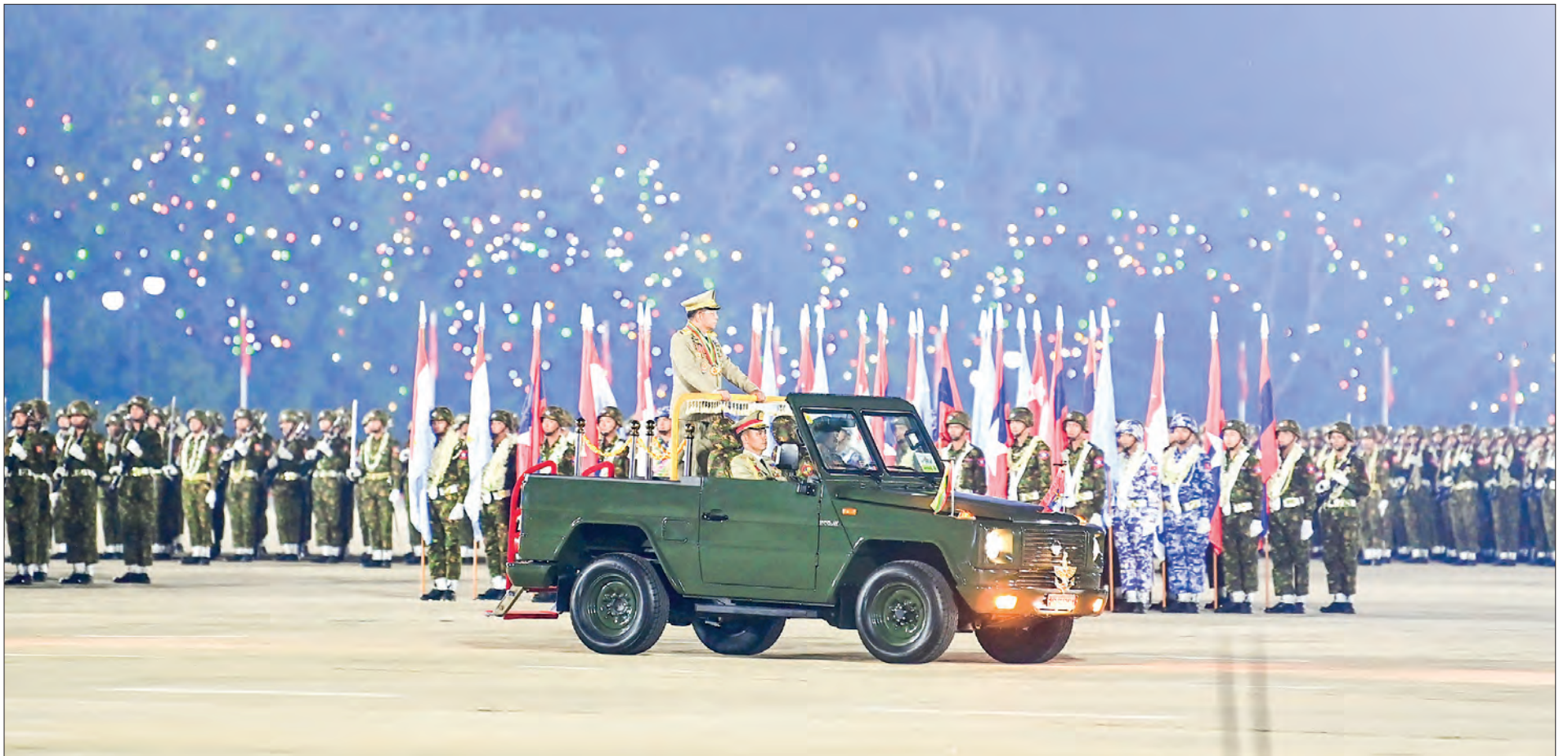
State Administration Council Chairman Defence Services Commander-in-Chief Senior General Thadoe Maha Thray Sithu Thadoe Thiri Thudhamma Min Aung Hlaing inspects the parade columns yesterday in Nay Pyi Taw.

C hairman of the State Administration Council Commander-in-Chief of Defence Services Senior General Thadoe Maha Thray Sithu Thadoe Thiri Thudhamma Min Aung Hlaing delivered a speech at the 80 th Anniversary of Armed Forces Day Parade at Nay Pyi Taw Parade Ground yesterday evening.