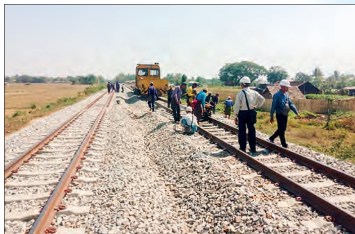
Photos showcase blast damage and ongoing repairs to fast-track the reopening of rail tracks.

Region, exploded yesterday morning. The uptrain rail track was destroyed, and the single rail system was adapted along the Nyaungchayhtauk and Kywepwe route of down train rail track.