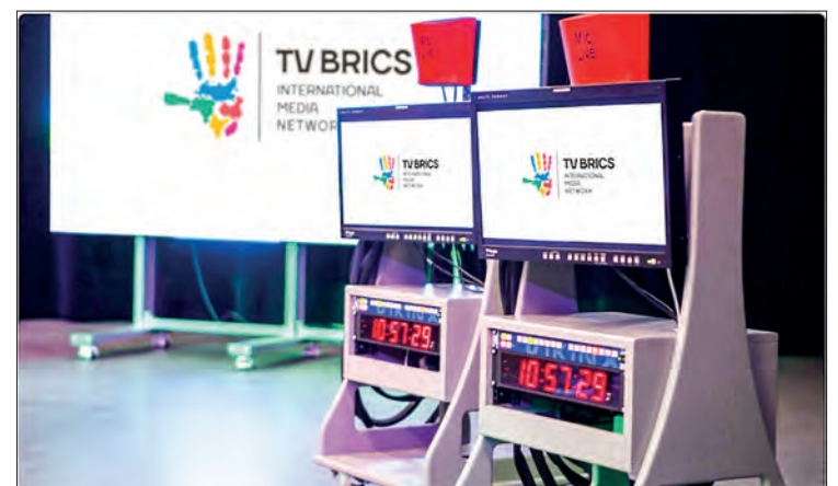
TV BRICS has launched a new educational television project aimed at learning Russian as a foreign language and popularizing Russian culture abroad.

“Russian Lessons”, which started on 25 March, will be broadcast twice a week. People can watch the programme on Tuesday and Thursday in English on the TV BRICS channel and on the English version of the international media network’s information portal, as reported by TV BRICS. — ANI