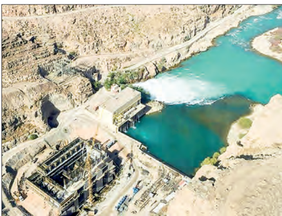
The Kajaki Dam is a significant hydroelectric power facility located on the Helmand River in Afghanistan's Helmand Province.

tariff on all automobiles made outside the United States, following a similar request when he visited the country earlier this month. — Kyodo