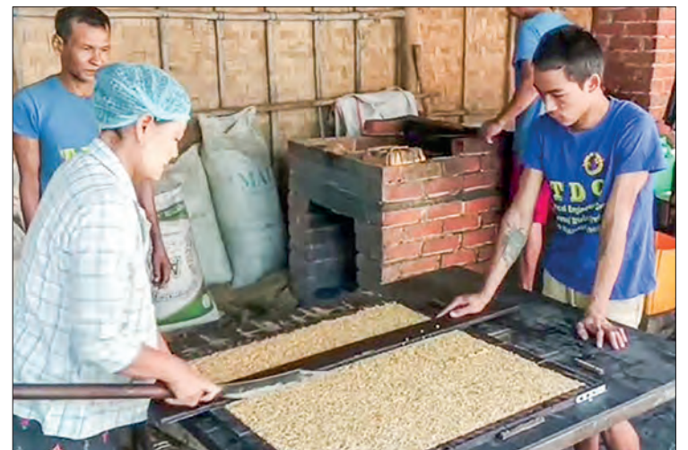
A glimpse of a small, micro, or medium-sized business in operation.

The competition will be recorded and broadcast on Skynet's Up to Date Channel and Channel 9 HD. Additionally, a press conference for the event will be held on 30 March in the Hexagon Studio at Shwe Htut Tin Ground. — ASH/KNN