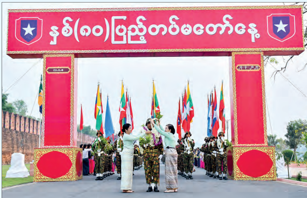
Tatmadaw members from the 80 th Armed Forces Day parade in Mandalay adorned with garlands yesterday.

MILITARY parade companies heading to the 80 th Armed Forces Day parade in Mandalay's royal city began their march from the gathering point to the Kyauktine parade ground at 6 am yesterday.