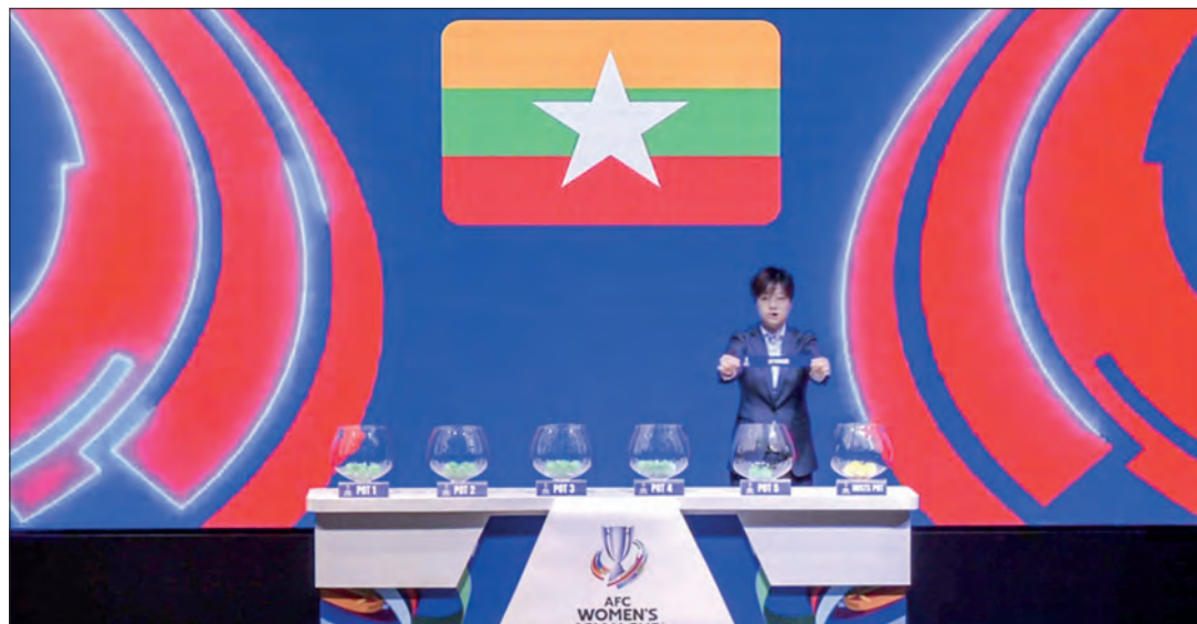
The drawing lots event for the 2026 AFC Women's Asian Cup qualifiers.

MYANMAR has been drawn into the same group as Bahrain, Bangladesh, and Turkmenistan for the 2026 AFC Women's Asian Cup qualifiers, following the group stage draw held on 27 March in Malaysia.